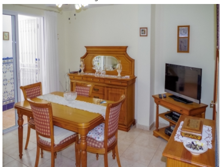
Bright dining area