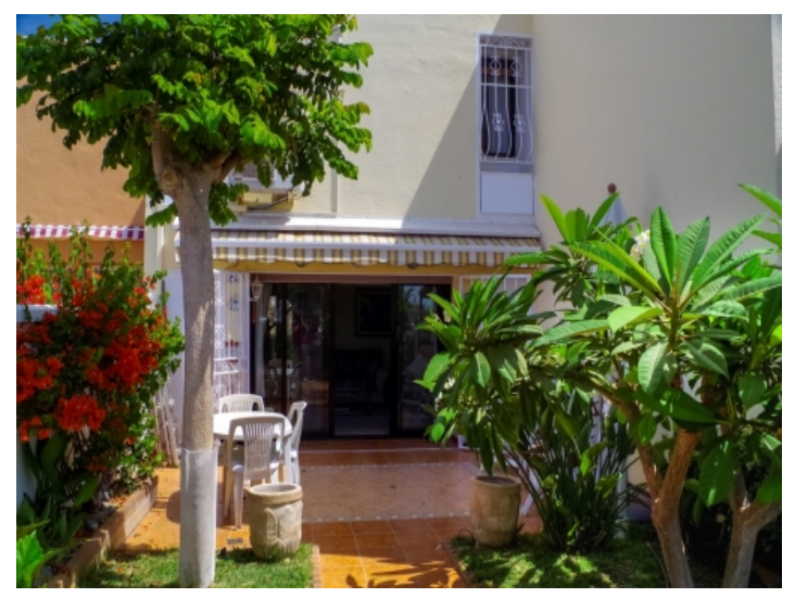
Beautiful garden with terrace