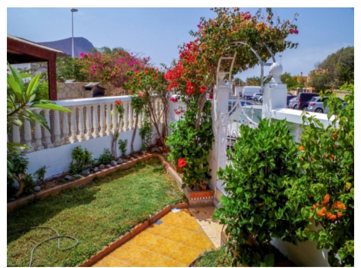
Wonderful front garden