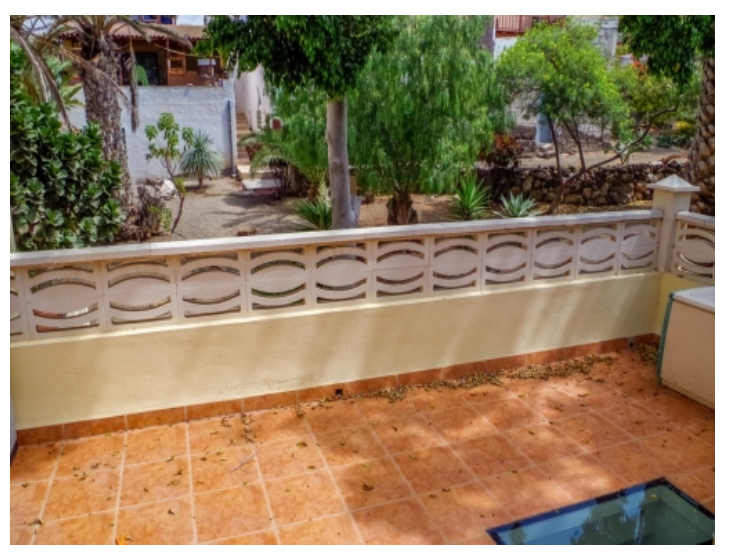
Lovely terrace with garden views