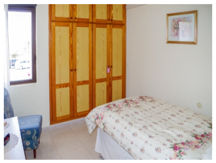
Bedroom with built-in wardrobe