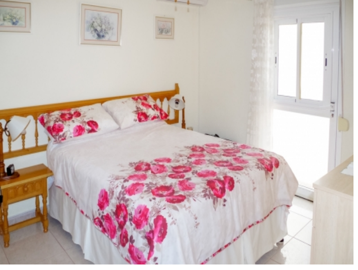
Double-bedroom with bathroom en suite