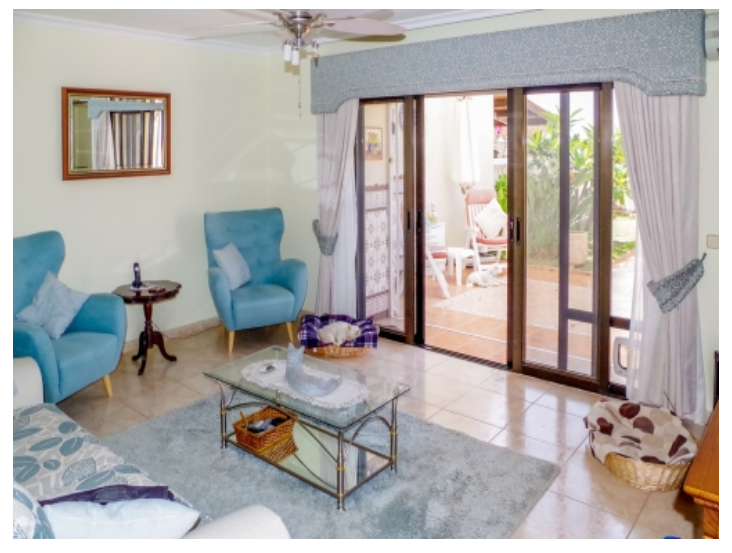
Living area with terrace access