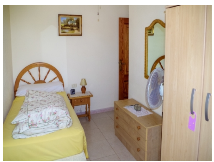
The third bedroom