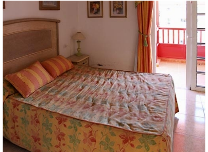
Bright bedroom with balcony