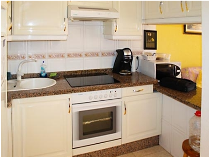
Fitted kitchen with view to the living room