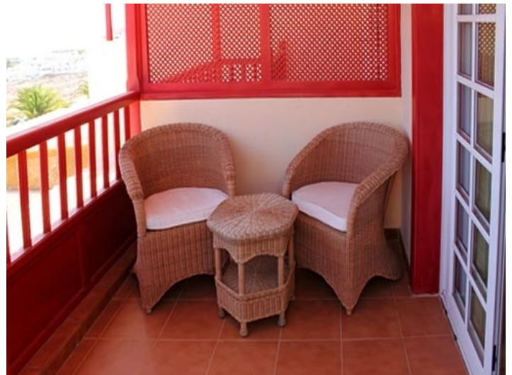
Comfortable spot on the balcony