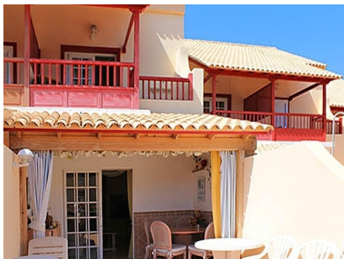
View to the back area of the house