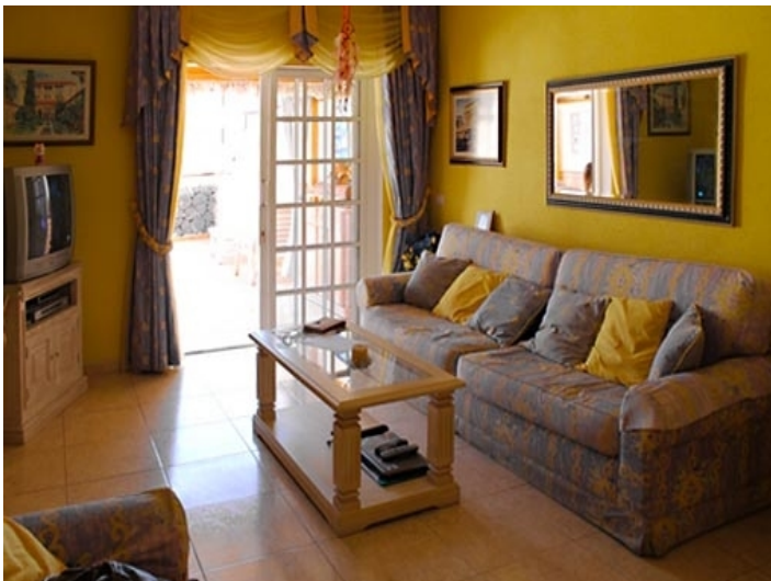
Exclusive designed living room