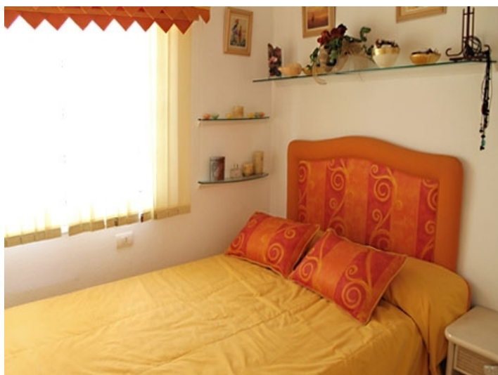
Comfortable bedroom with double bed