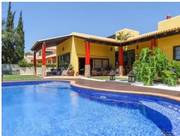
Inviting pool and terrace of the property