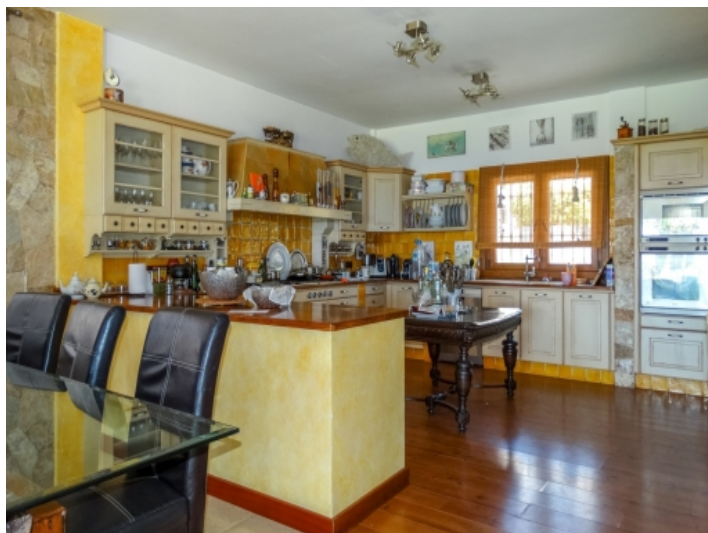
Fully equipped kitchen with views to the dining area