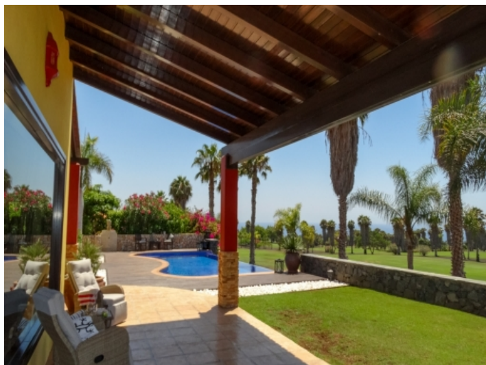
Covered sitting area next to the pool