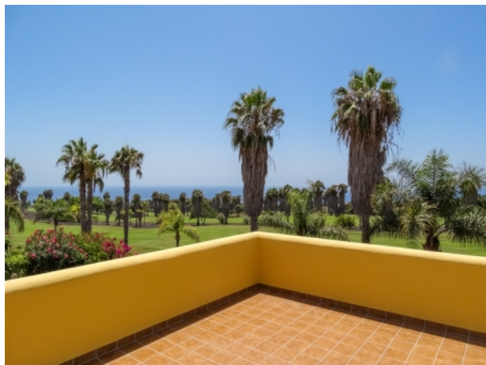
Sunny balcony with a view