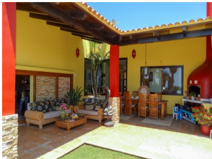
Exterior dining area and chill-out lounge