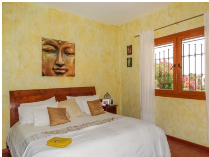
Master bedroom with comfortable double bed