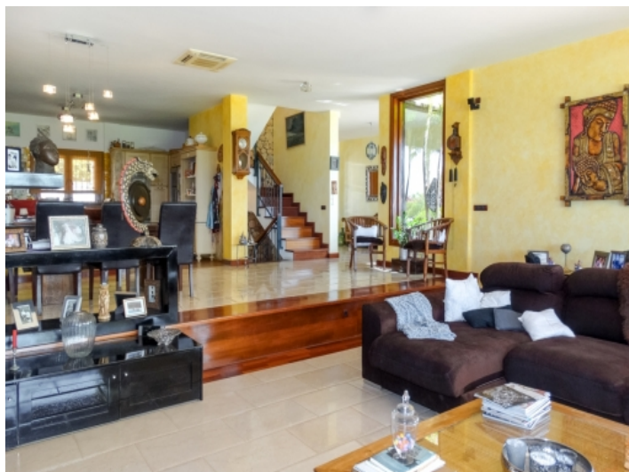
Views of the lower lounge area