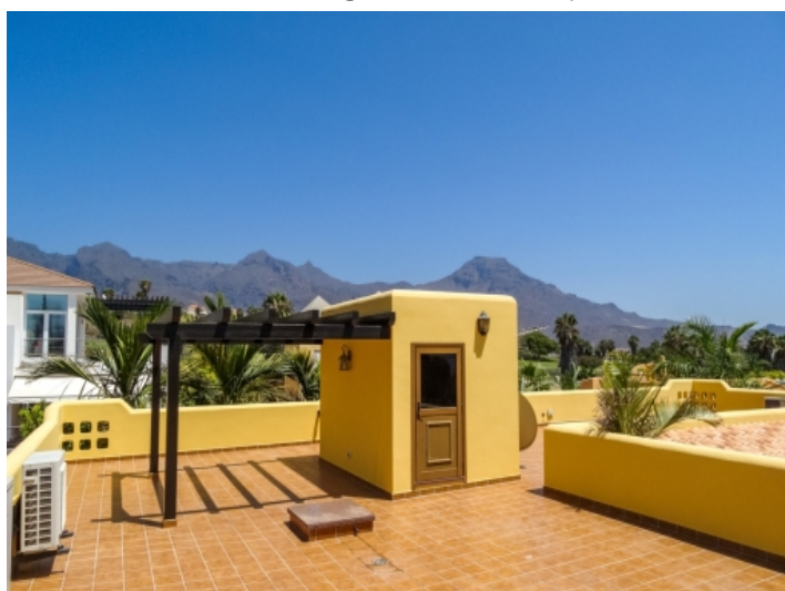
views of the spacious roof terrace