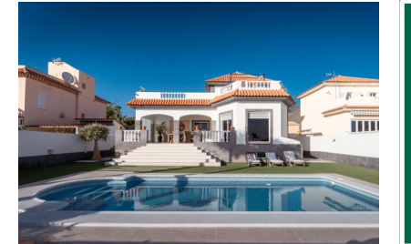
Torviscas Alto search for property TEN-108006