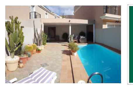
Palm Mar search for property TEN-107982