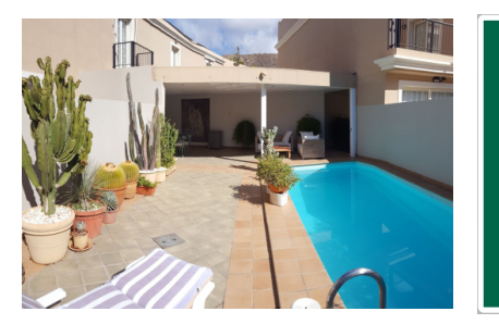
Palm Mar search for property TEN-107982