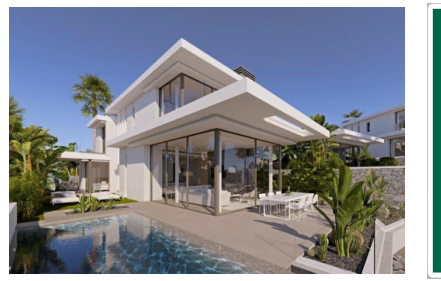
Abama search for property TEN-107957