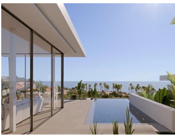
Large terrace with sweeping views