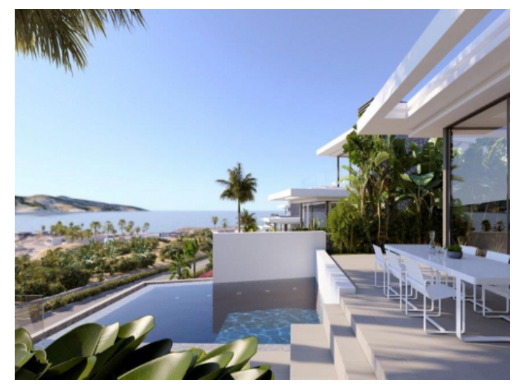
Fantastic sea views