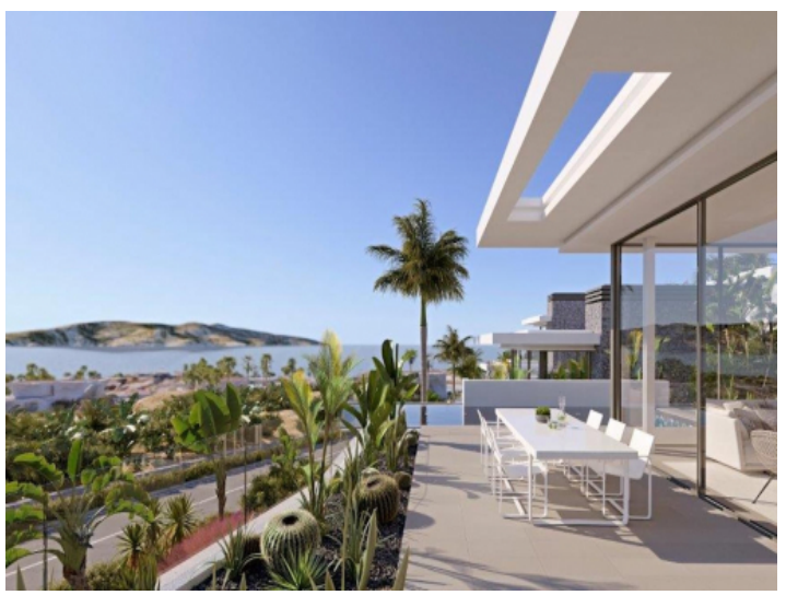
Sunny terrace with outdoor dining area