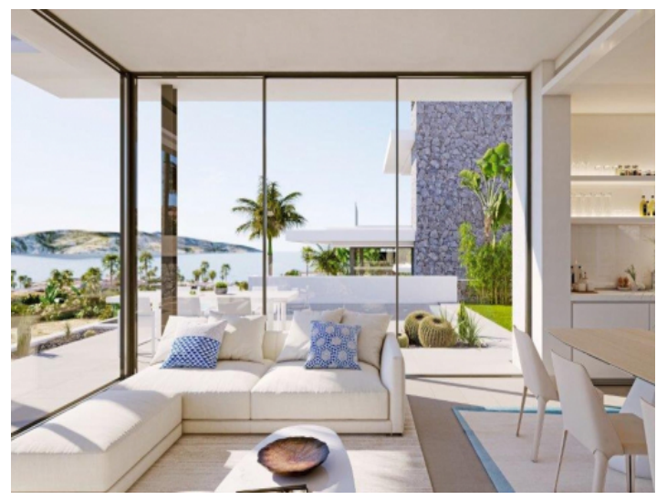
Light-flooded living area