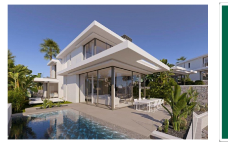
Abama search for property TEN-107957