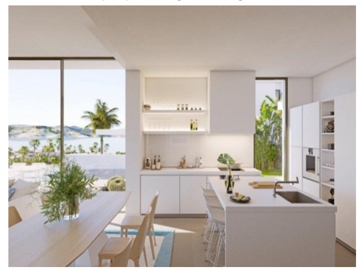
Modern kitchen with island

PORTA TENERIFE • CALLE LUIS DE LA CRUZ 10, 38400 PUERTO DE LA CRUZ, SPAIN TEL.: +34 922 386 273 • INFO@PORTATENERIFE.COM • WWW.PORTATENERIFE.COM