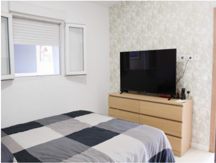
Finca with 2 bedrooms