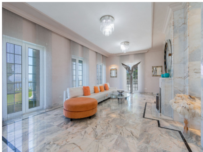
Second living area with fireplace