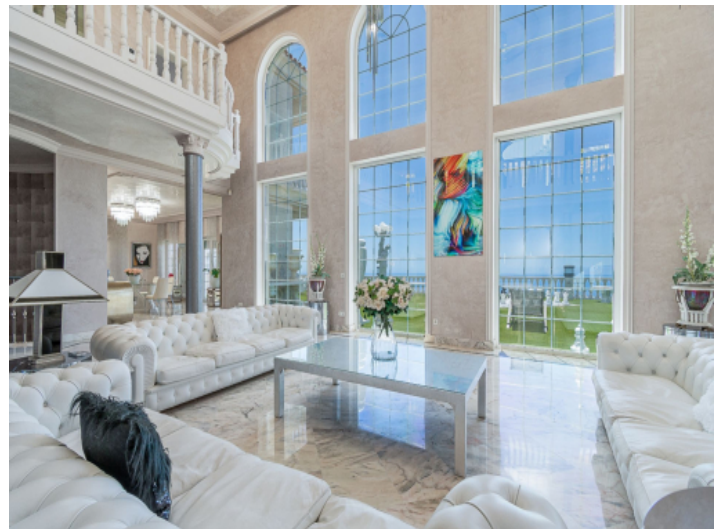
Living area with sea and garden views