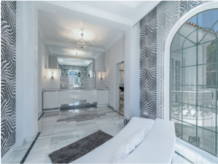
Villa with 8 bathrooms