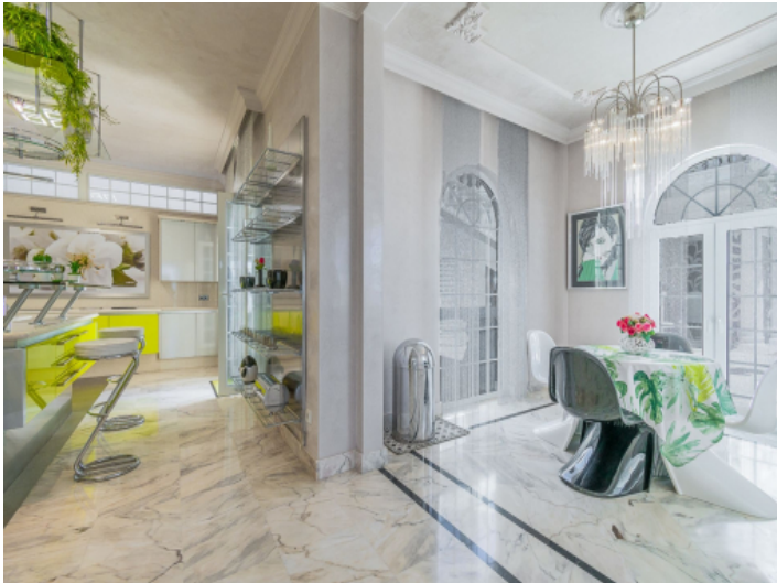
Breakfast area in the kitchen