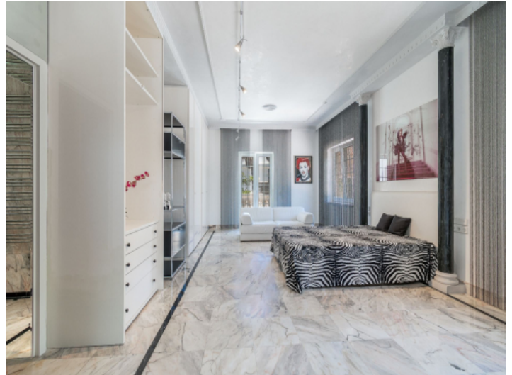
Five elegant bedrooms