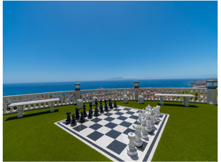
Amazing sea views