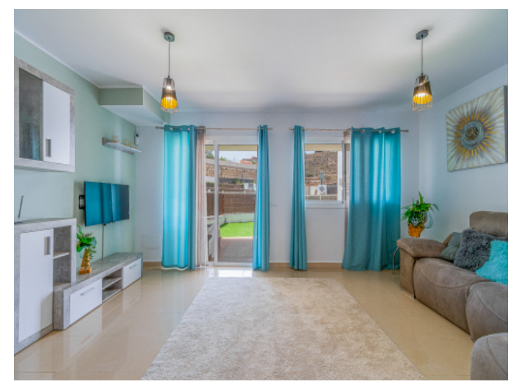
Living area Living area