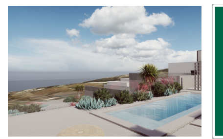
Guía de Isora search for property TEN-107921