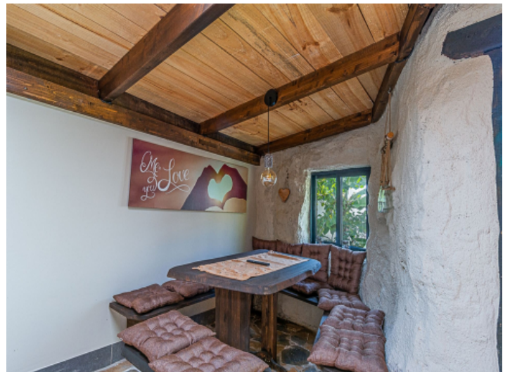
Relax and chill