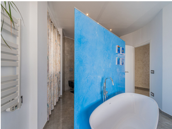
Bath en suite masterbedroom