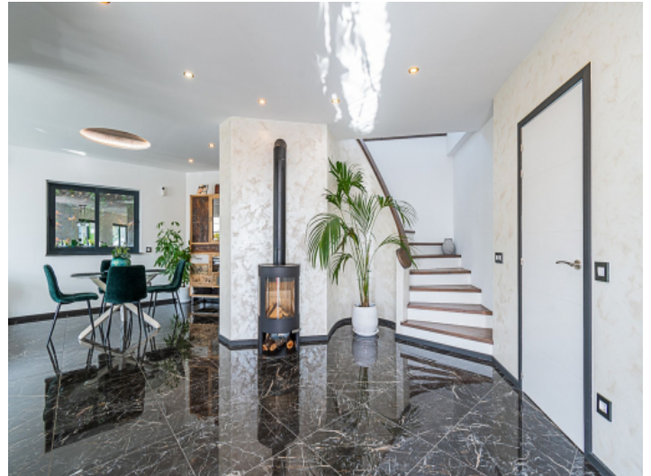
Bright and modern furnished