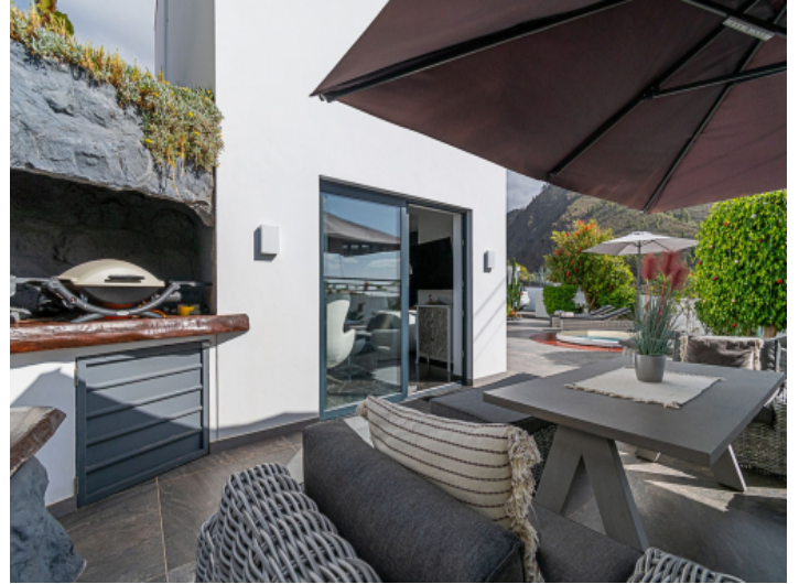
Outdoor area in front of the living room