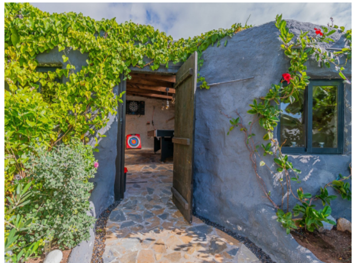
Garden area and acces to the chill out area