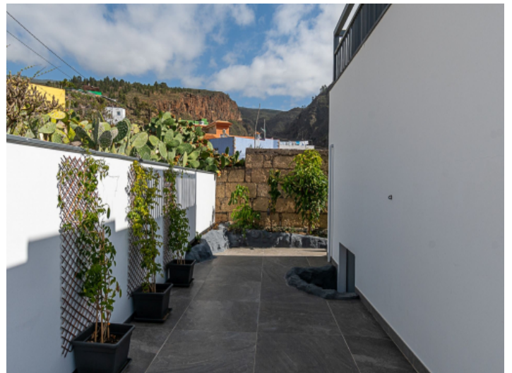
Easy maintain patio area