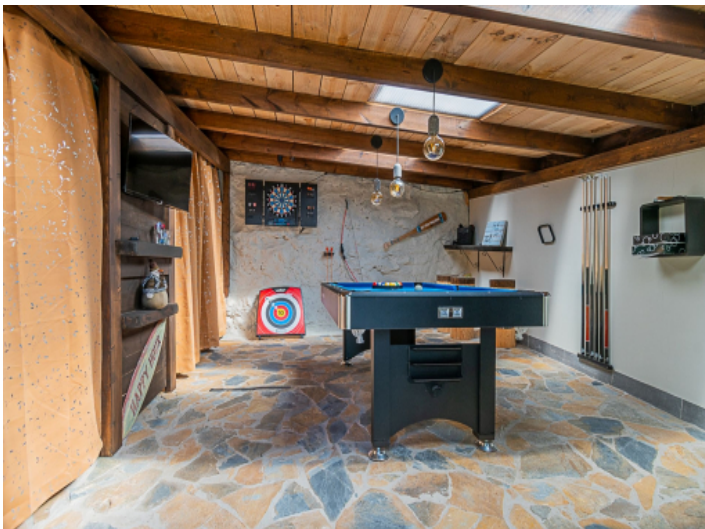
Billard and gaming area