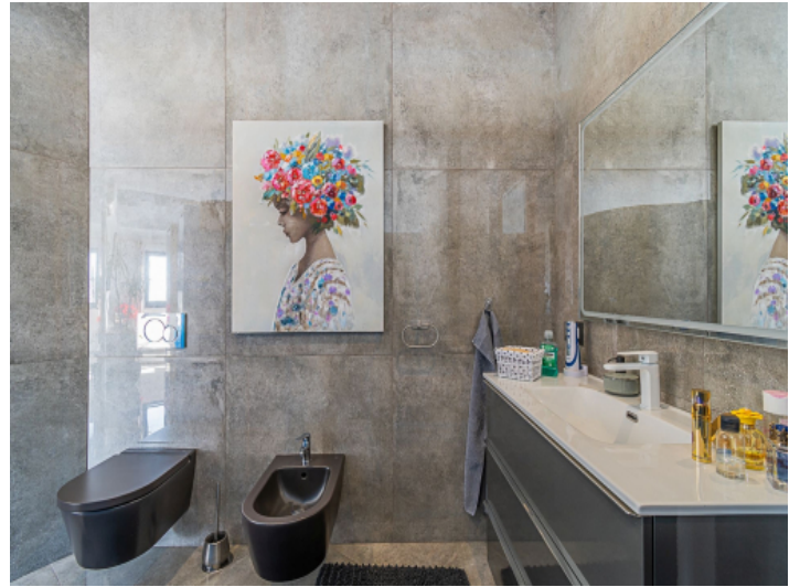
Fully equipped 2nd bathroom