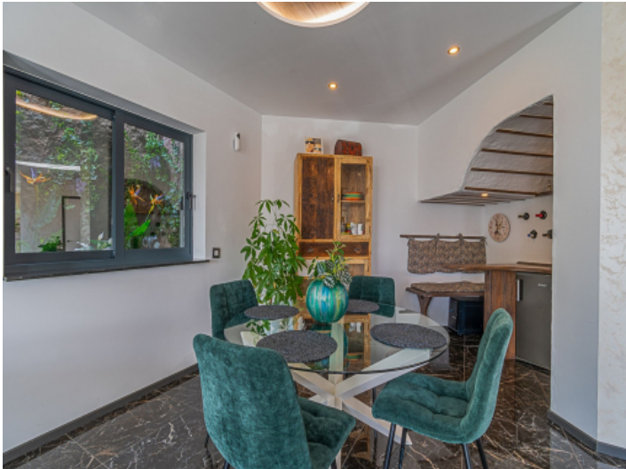
Beautiful dining area