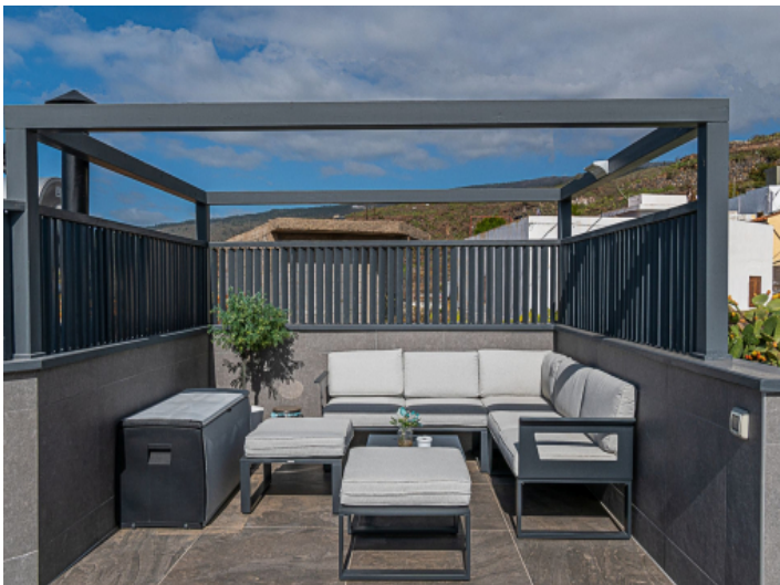
Porched rooftop veranda