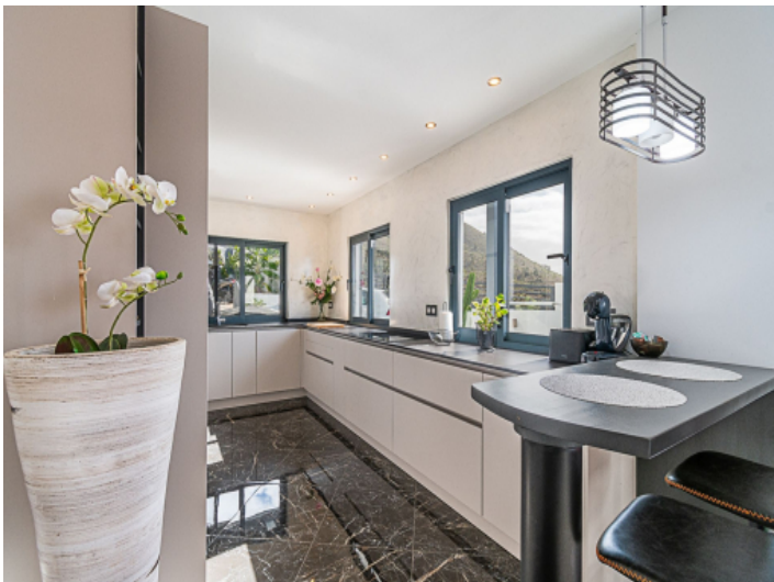
Quality kitchen furnitures vom "Leicht"