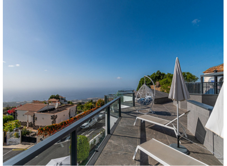
Amazing views and sunsets