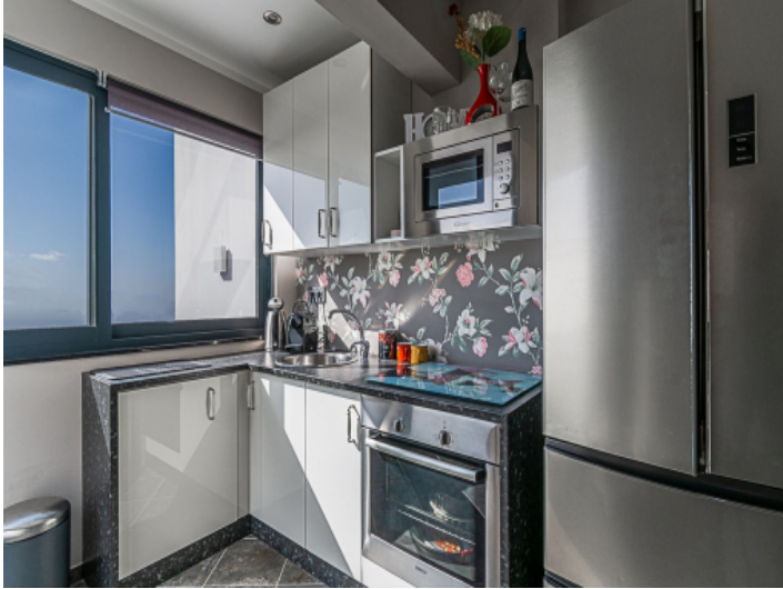
Kitchen for the guest area