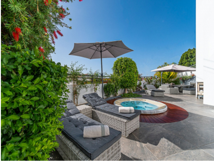
Beautiful sundeck with a refreshing whirlpool