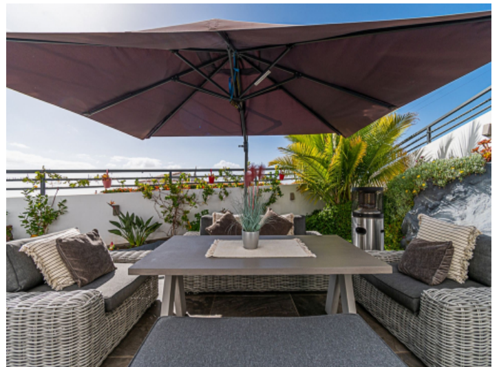
Comfortable chill out