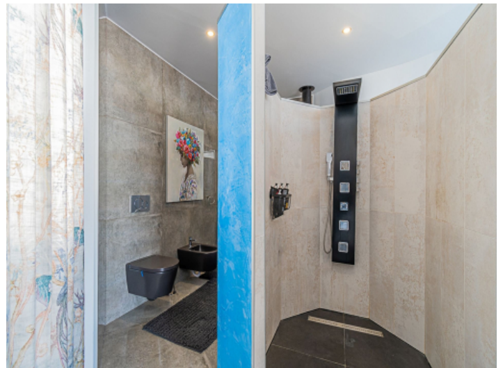
Shower area of the en suite bathroom