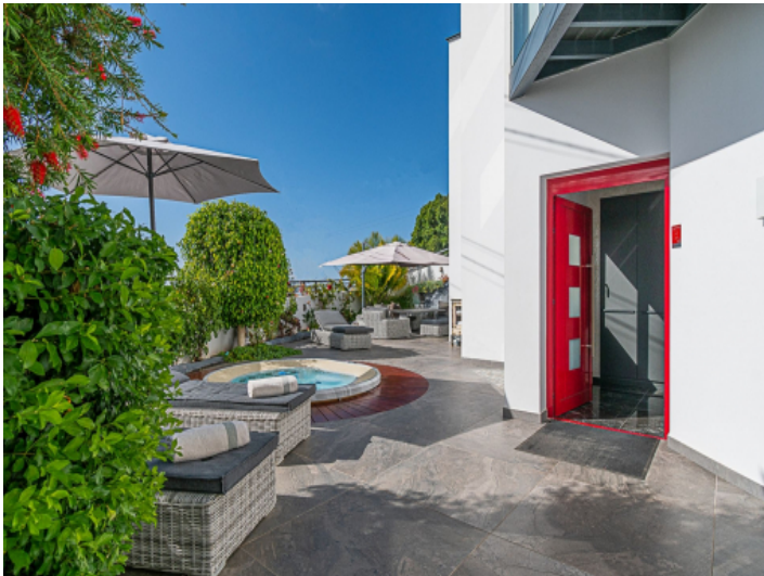
Entrance of this charming villa