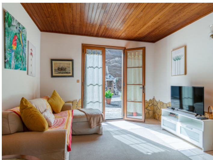
Cozy living room