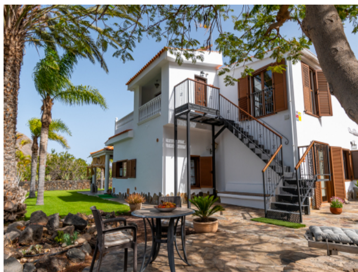
Finca with outdoor parking spaces