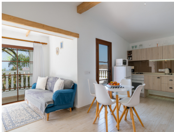
Apartment with open plan kitchen