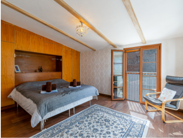
Comfortable holiday destination