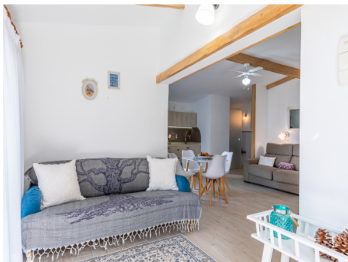
Open plan apartment