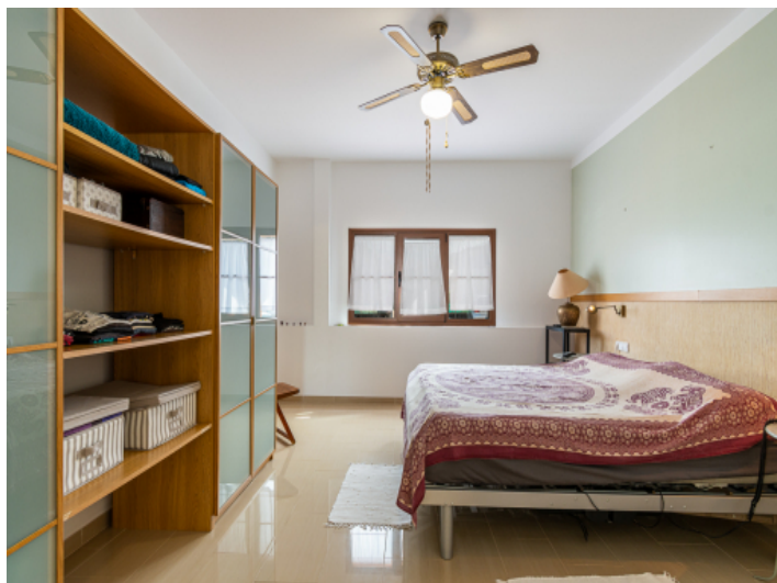
Bedroom with ventilator