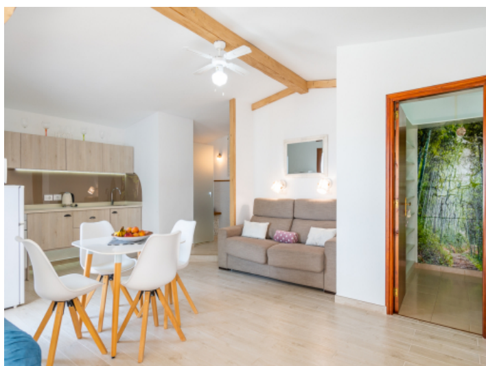
4 apartments are rented the whole year