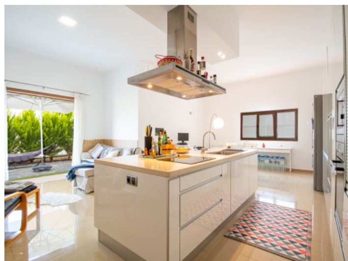
Beautiful kitchen in one of the 4 apartments