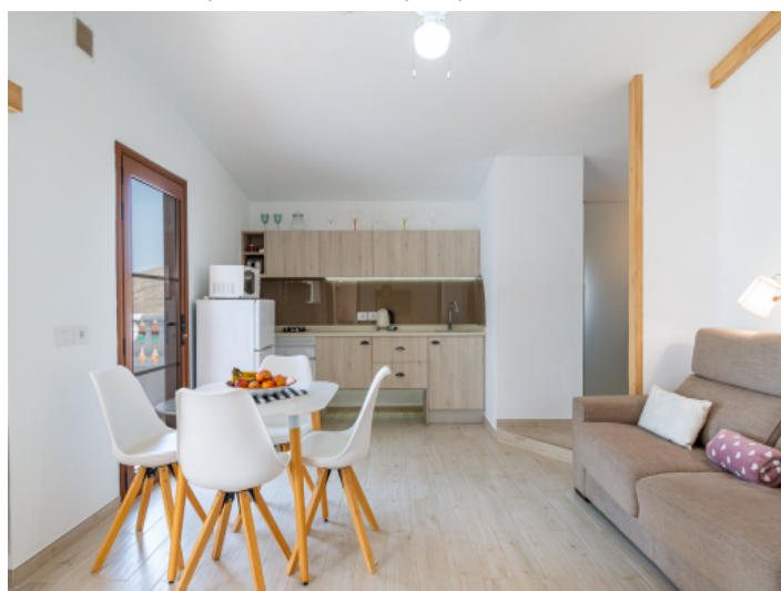
One of 4 holiday apartments