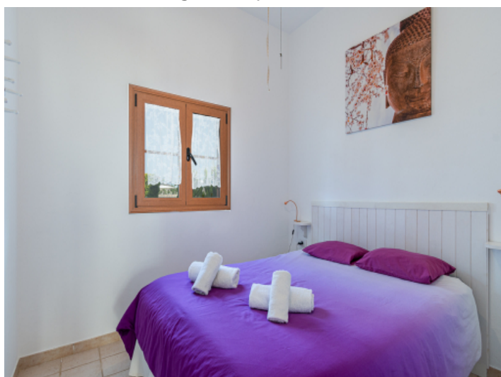
Welcome your guests the whole year round