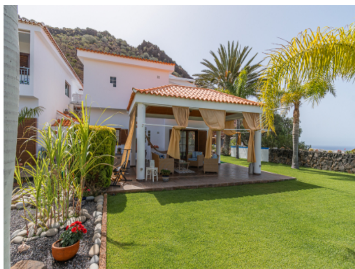
Main house surrounded by a tropical garden