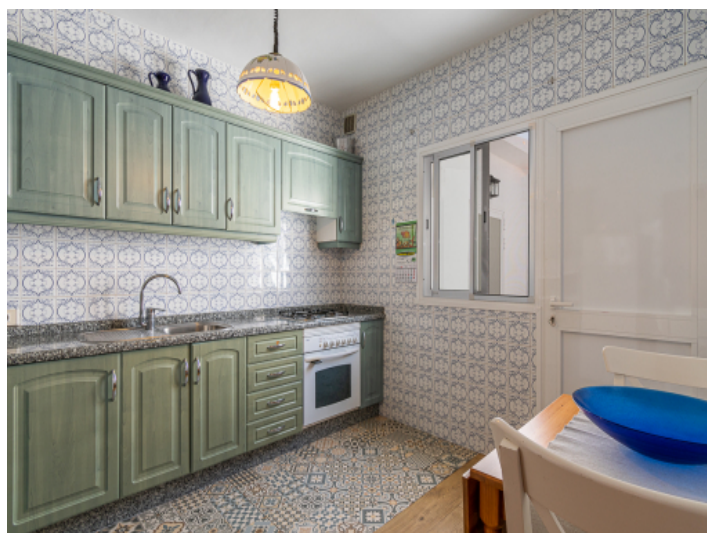
Nice equipped kitchen in one of 4 apartments