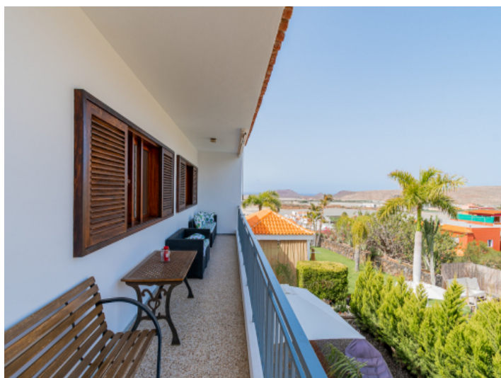
Large balcony with views