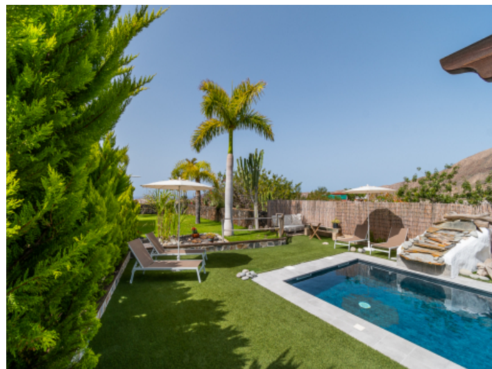
Relax with sea and mountain views