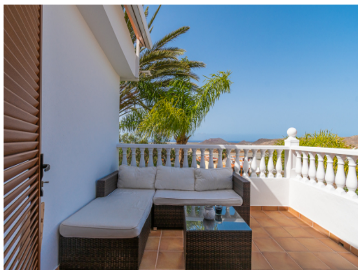
Beautiful private terrace