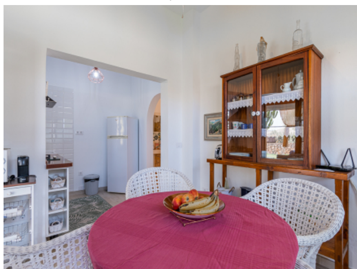
Comfortable living area in one of 4 apartments