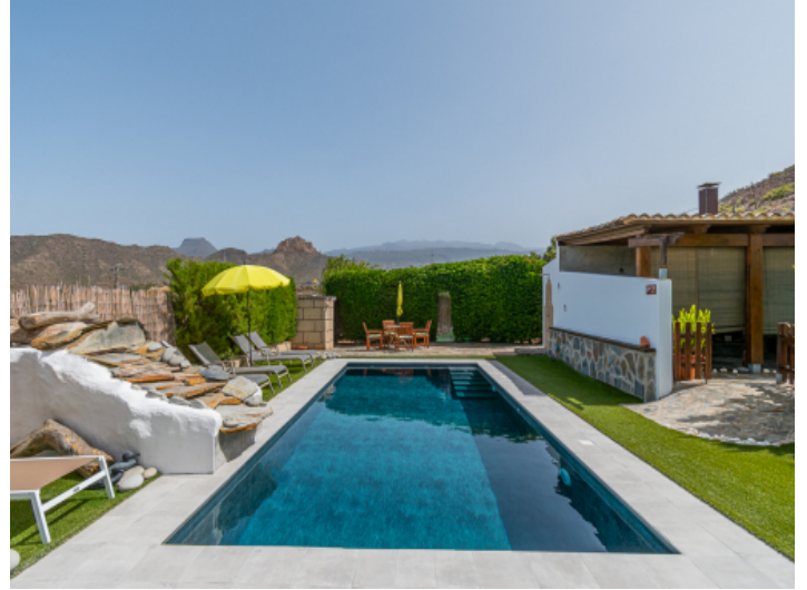
Well maintained pool area