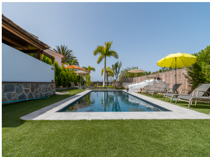
Heated saltwater pool