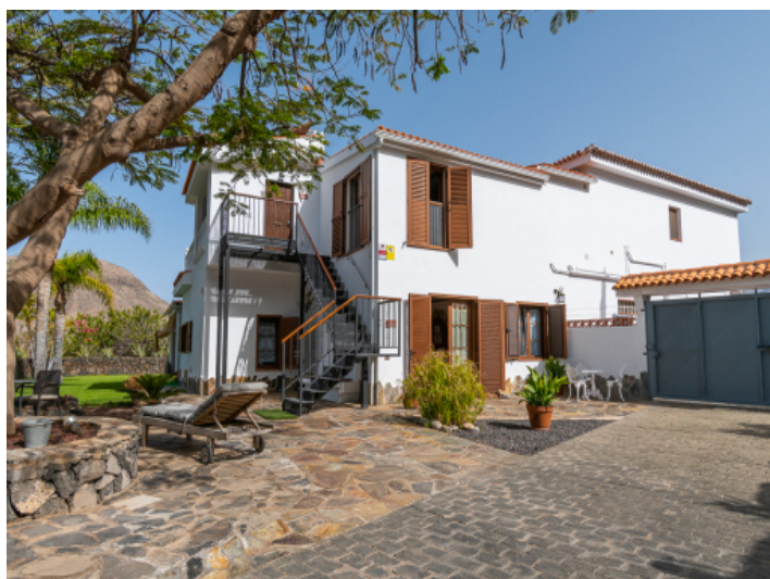
Lovely facade of the anex building