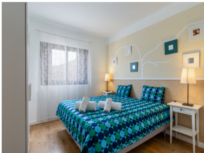
One bedroom of 10 bedrooms