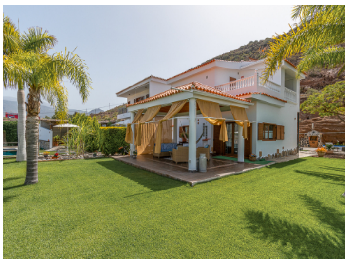
Elegant main house