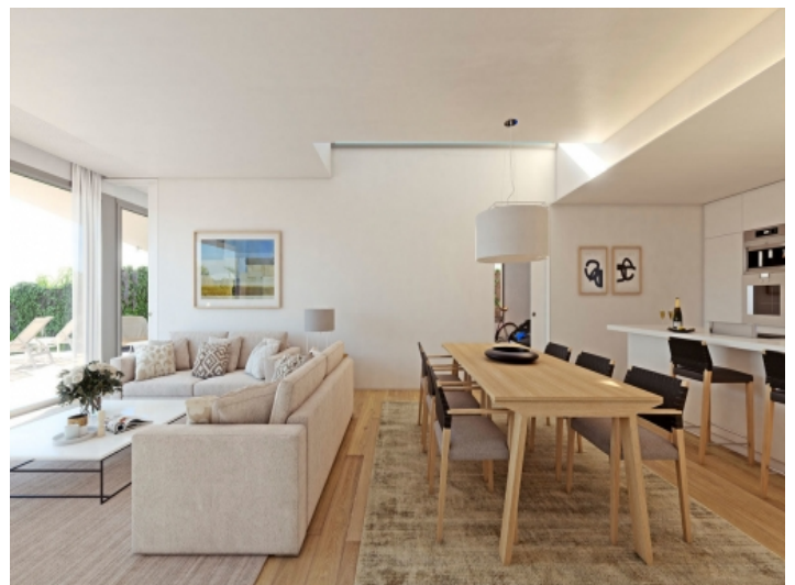
Light flooded living area