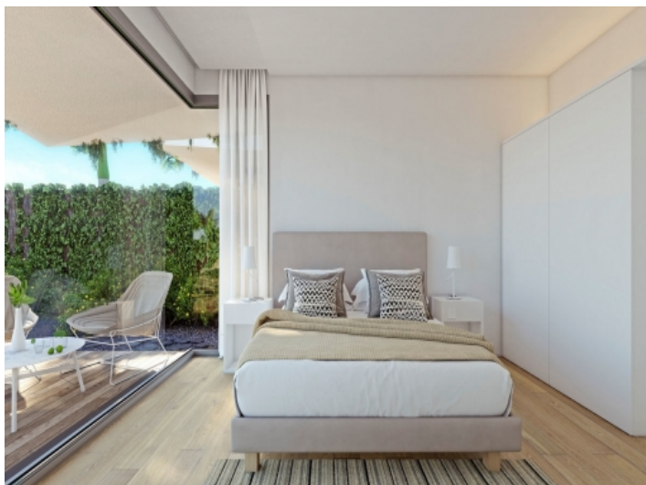
Master bedroom with panoramic windows