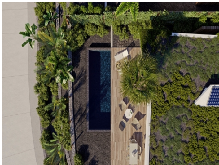
The villa from a birds-eye view