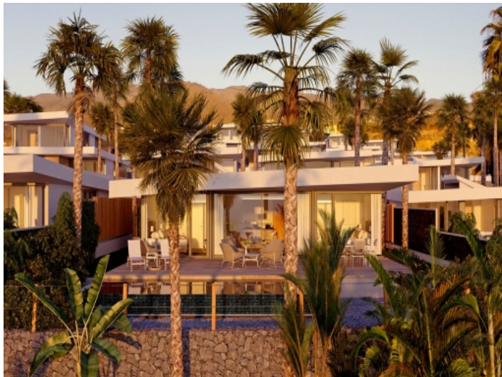
The villa by night