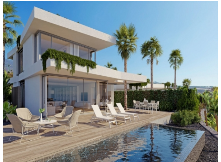
Inviting pool area