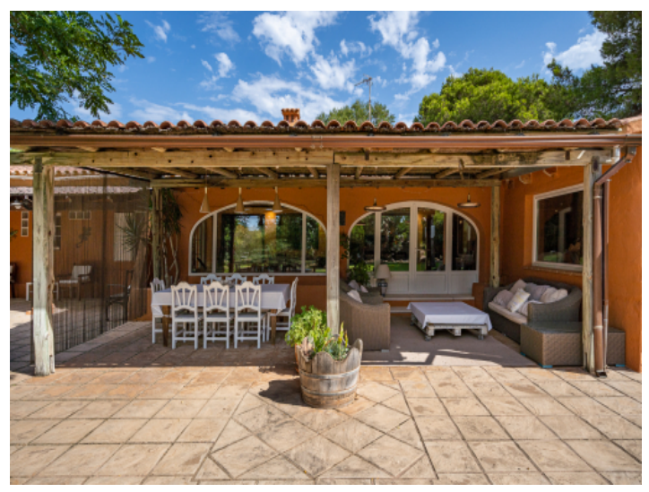
Large outdoor dining area