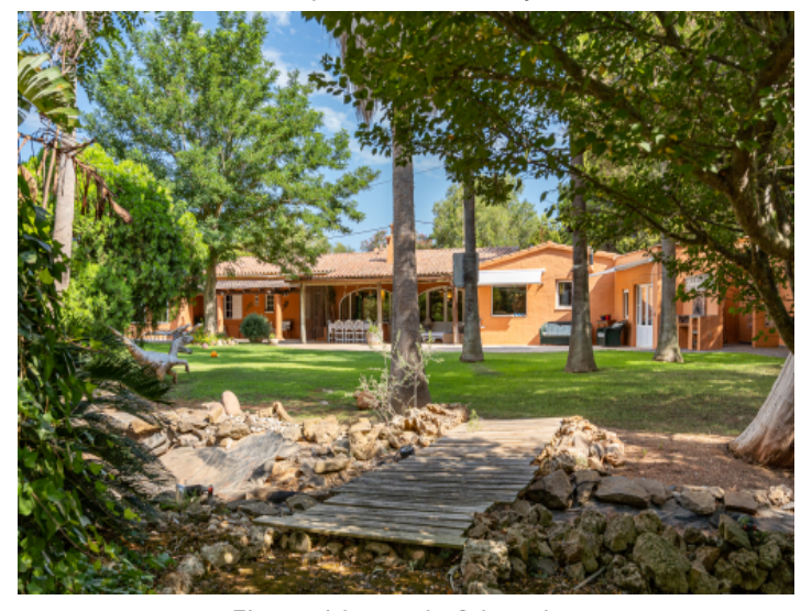
Finca with wonderful garden