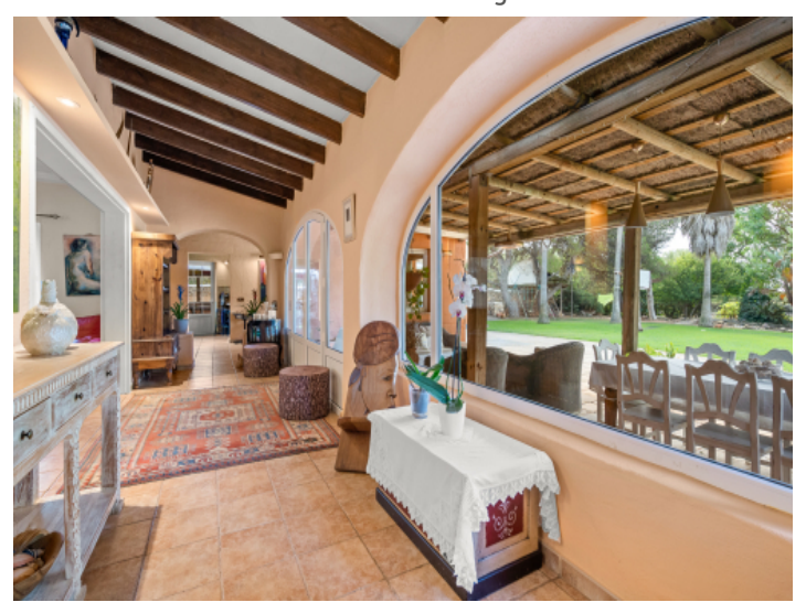
Large window front and terrace access