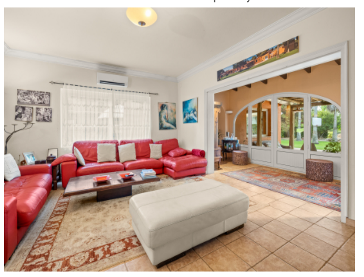
Generous living area

PORTA MONDIAL MENORCA • AVENIDA FORT DE L'EAU, 175, LOCAL 6, 07701 MAHÓN, MENORCA, SPAIN TEL.: +34 871 510 261 • MENORCA@PORTAMONDIAL.COM • WWW.PORTAMONDIAL.COM/EN/MENORCA/