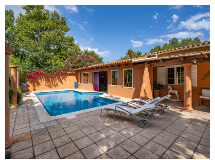
Lovely pool and terarce area