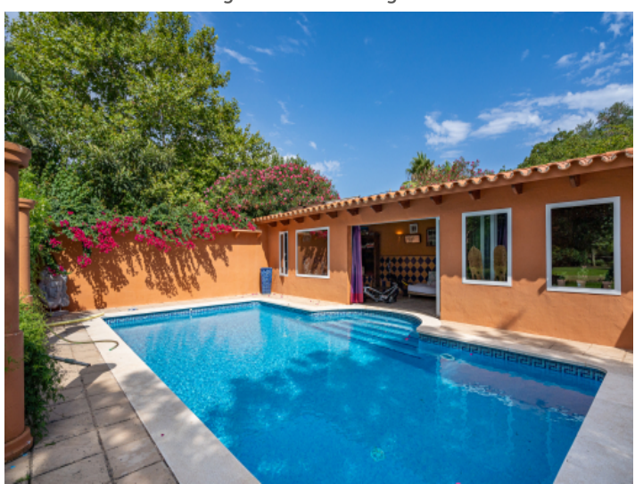
Pool with absolute privacy