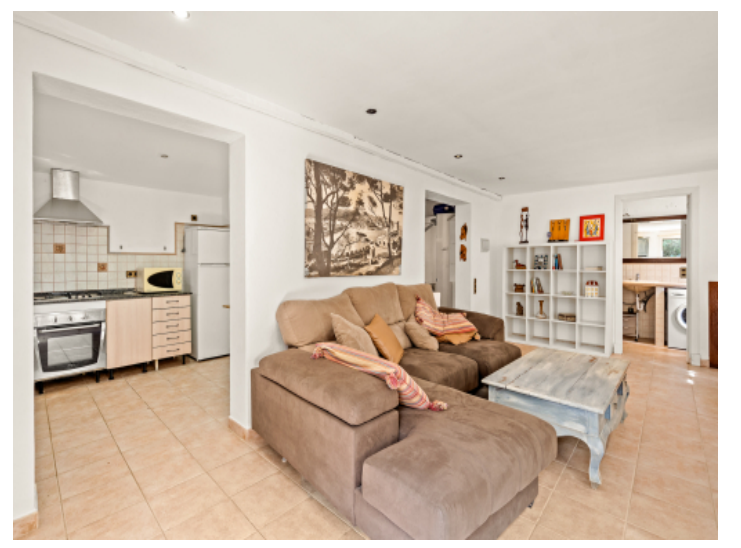
Separate guest apartment