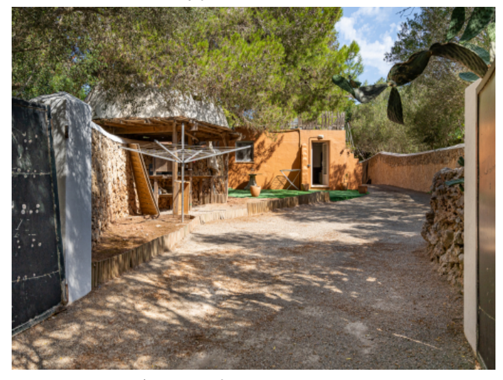
Access to the guest apartment