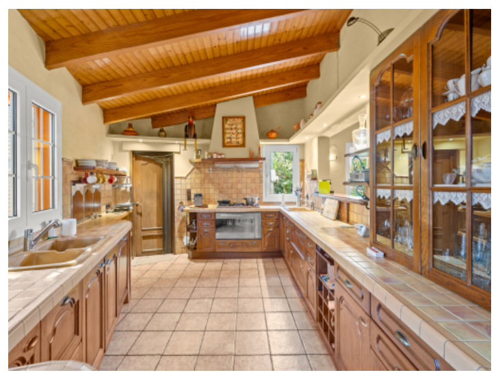
Large country house kitchen