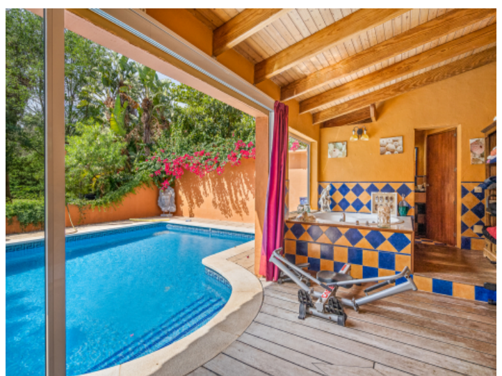
Covered pool terrace with jacuzzi