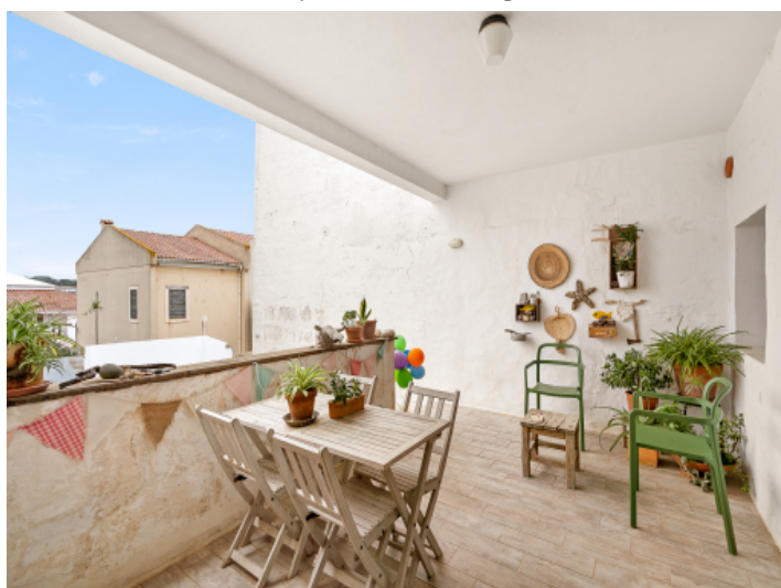
Outdoor dining area and access to the garden