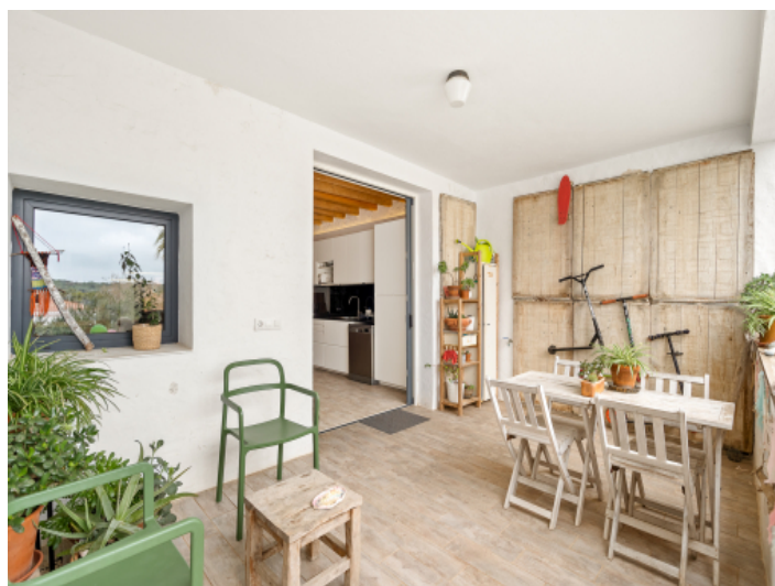
Fantastic covered kitchen terrace