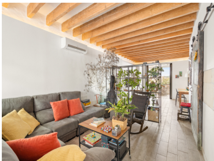
Beautiful living area with wooden ceiling beams