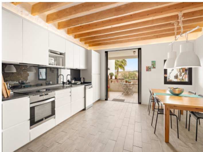
Fantastic and tastefully renovated village house with terrace