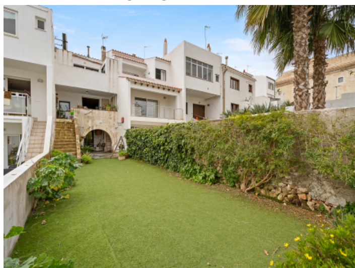
Townhouse with spacious patio / garden