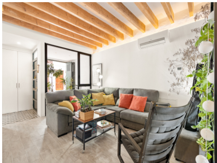
Inviting living and entrance area