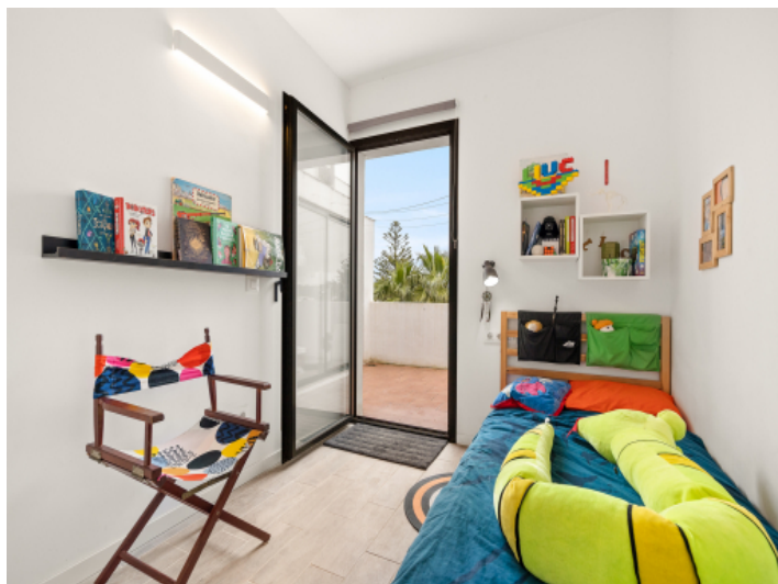
Kids room with further terrace