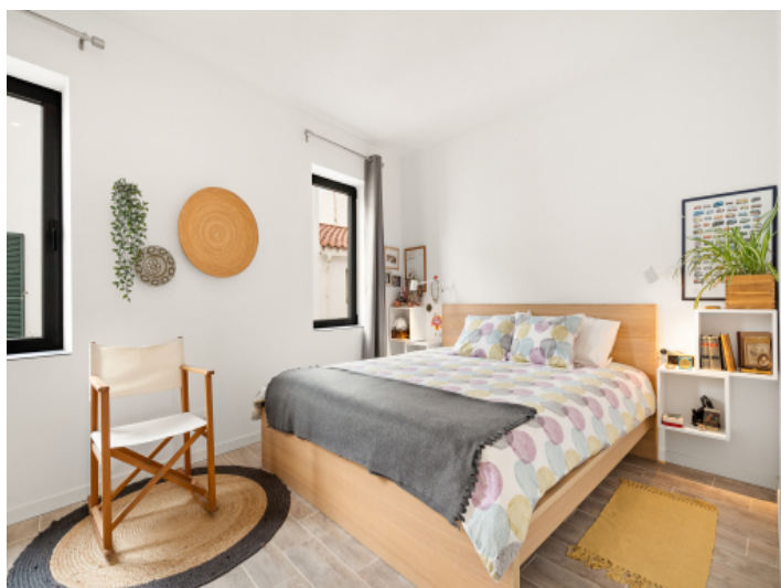
Beautiful double bedroom on the upper floor