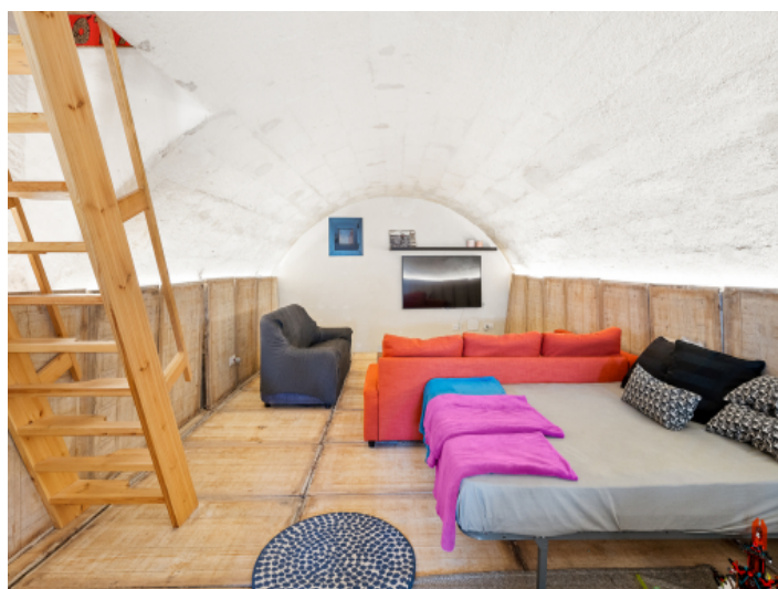
Separate living/ sleeping area in the souterrain