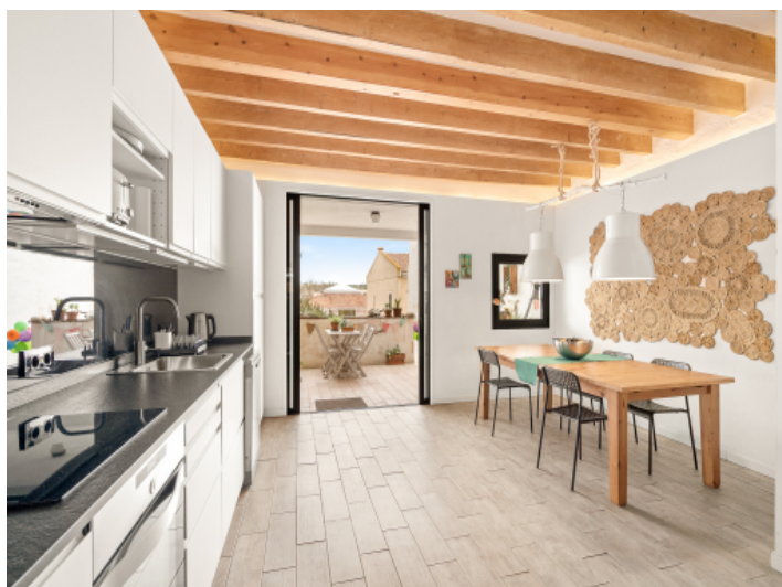
Wonderful kitchen with terrace