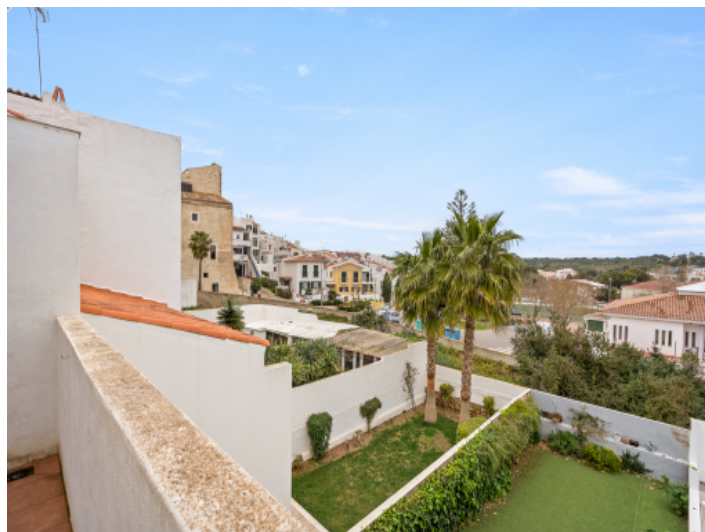
View from the upper terrace