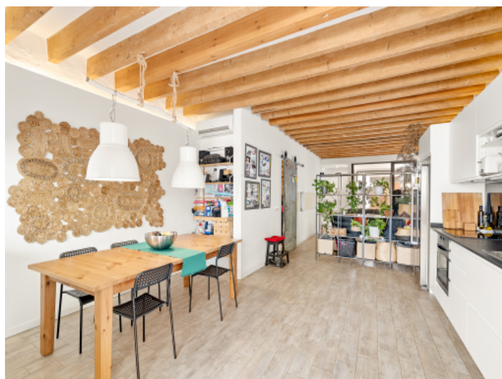
Adjoining, open dining area