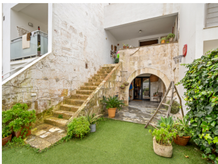
Enchanting garden with access to the souterrain