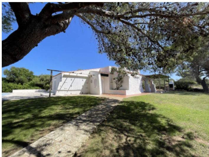
Very nice house