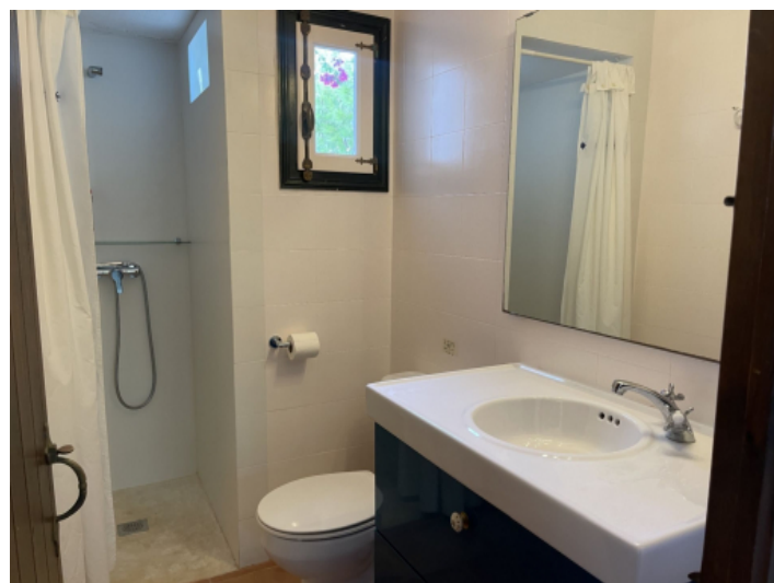
Chalet with 2 bathrooms