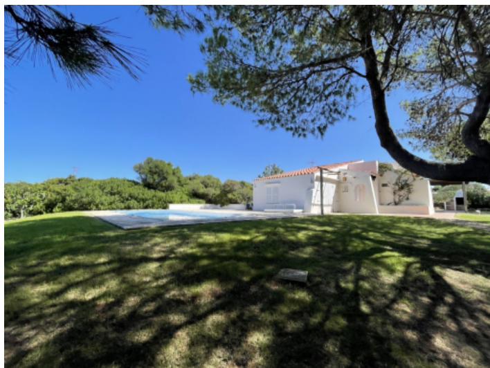
view to the house