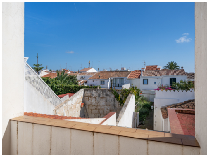
Menorquin house with garden for reformation in Sant Lluís