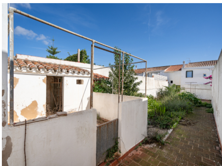
Terrace and garden