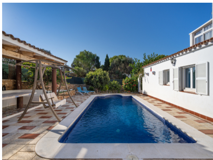
Tranquil pool area