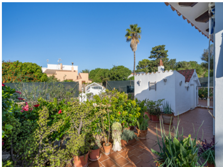
Inviting access to the house