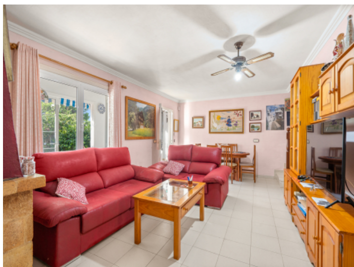
Living and dining area with terrace access