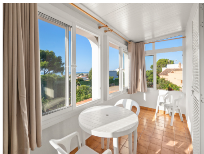
Adjoining closed terrace with sea views