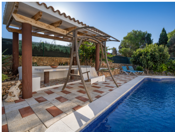
Tranquil lounge area