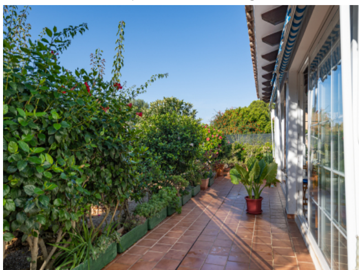
Beautifully planted terrace