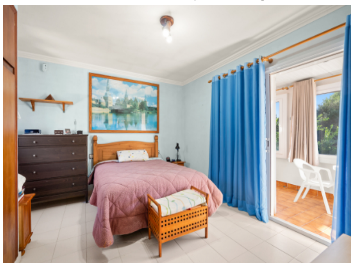
Bedroom on the upper floor