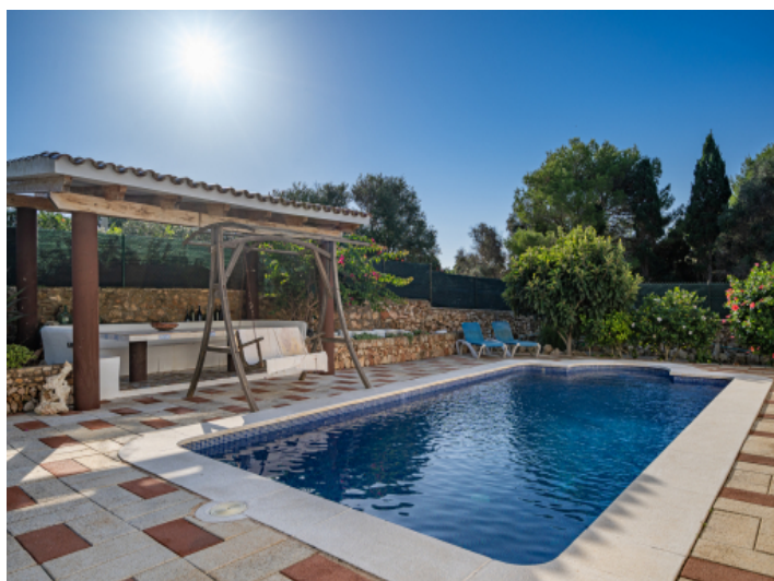
Beautiful pool area with seating area