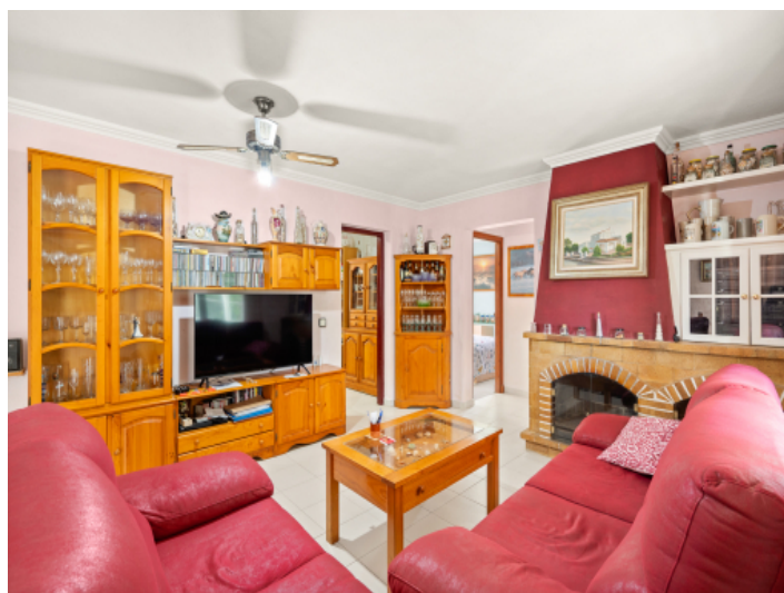
Comfortable living area with fireplace