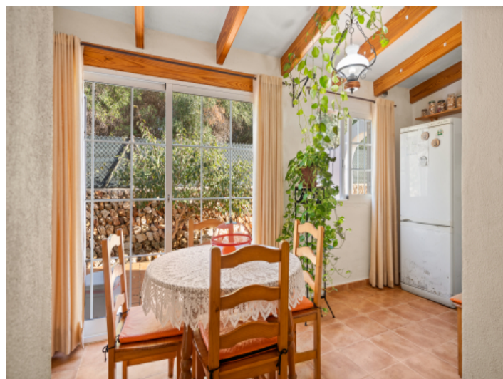
Bright dining area with terrace access