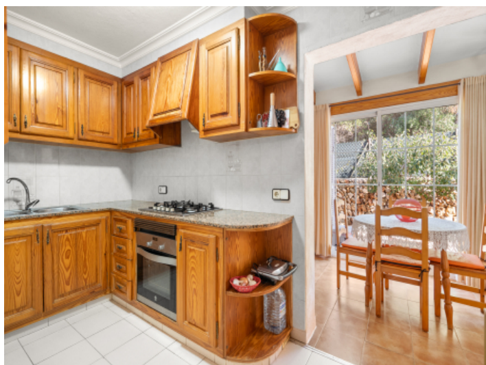
Wooden kitchen with separate dining area