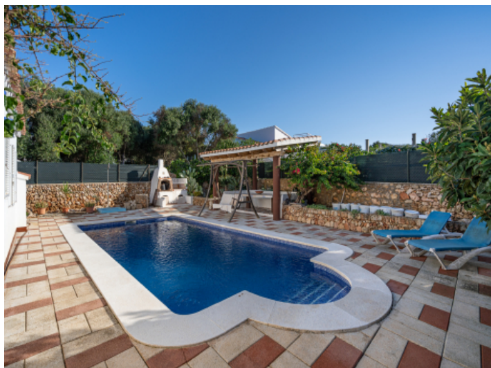
Pool with bbq area