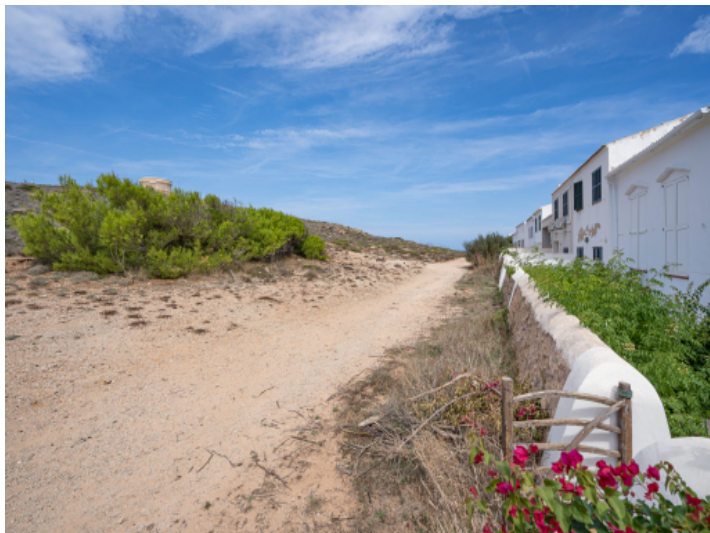
Rear view of the house