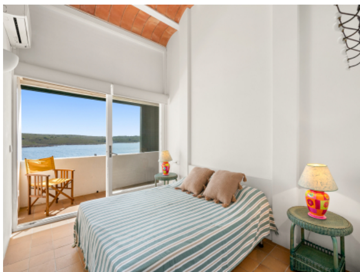
Dreamlike sea view bedroom