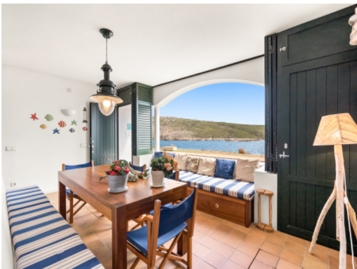
Enchanting indoor-veranda with sea views