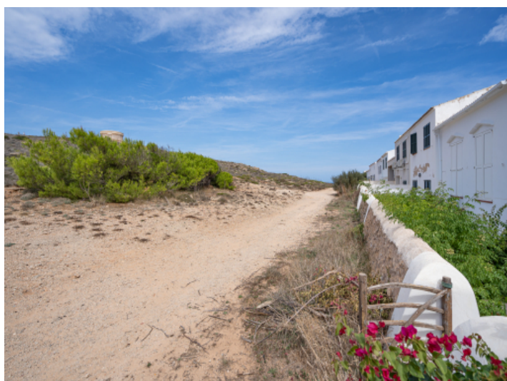
Rear view of the house