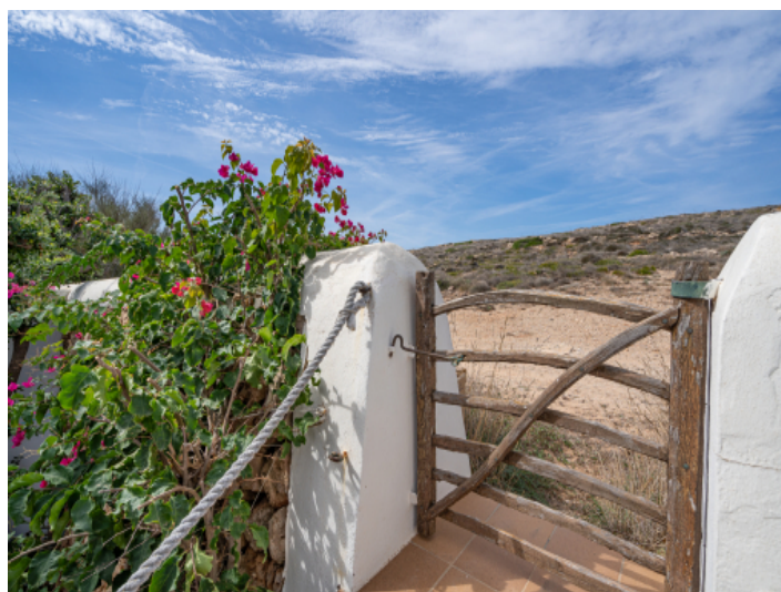
Access to the Cami de Cavalls