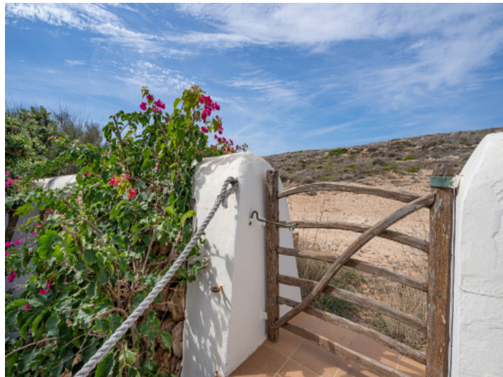
Access to the Cami de Cavalls