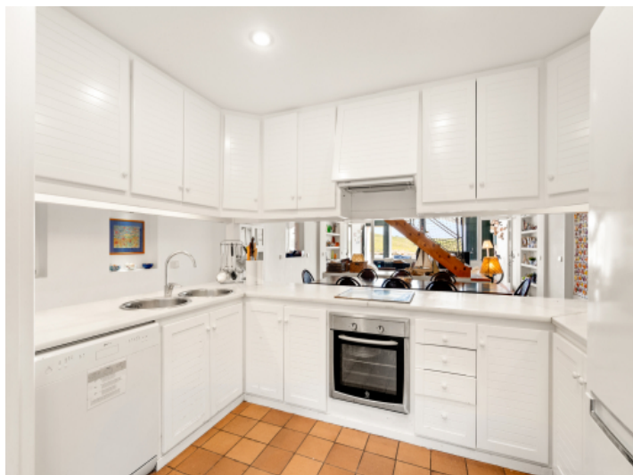
Wonderful kitchen in white