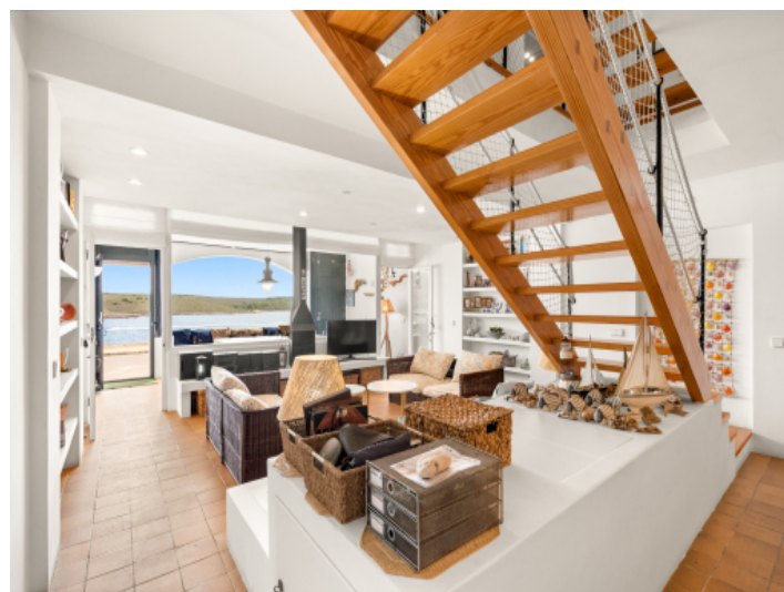
Wonderful sea views from the living area