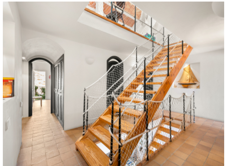
Upper floor with access to a attic room