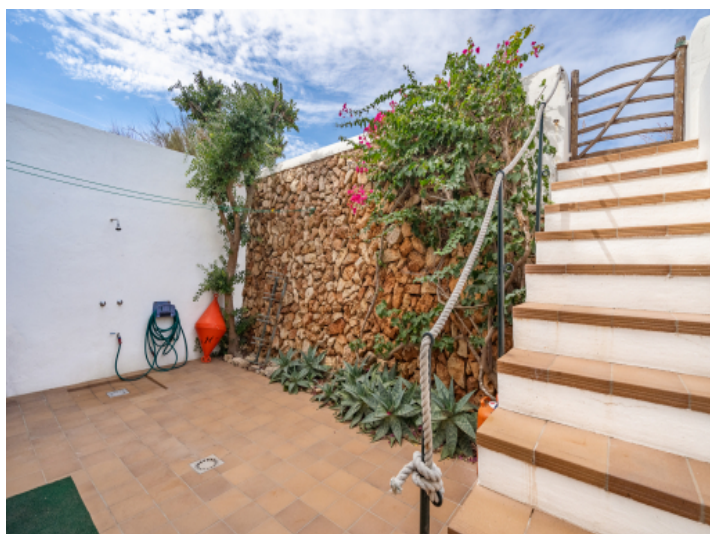
Private terrace on the rear side