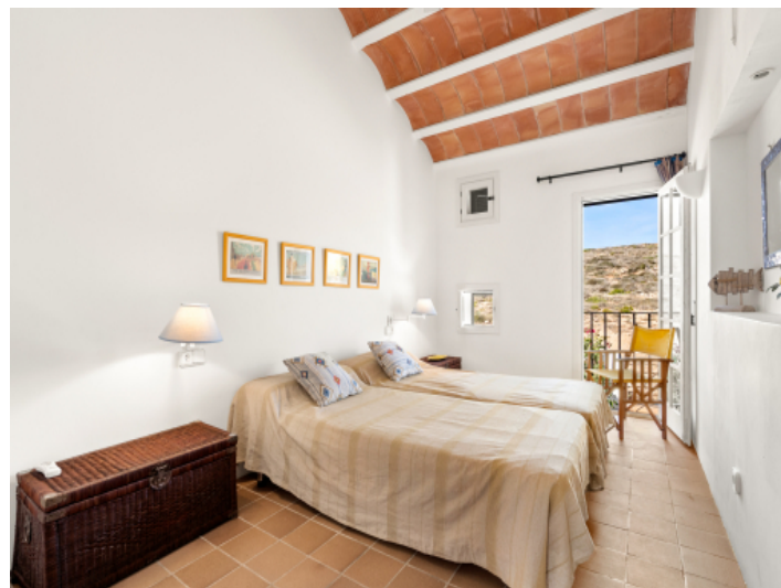
Double bedroom with balcony