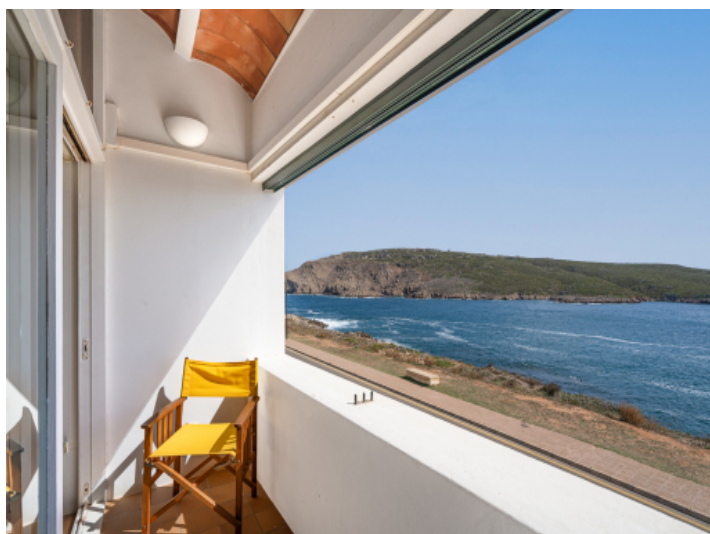
Stunning sea views from the balcony