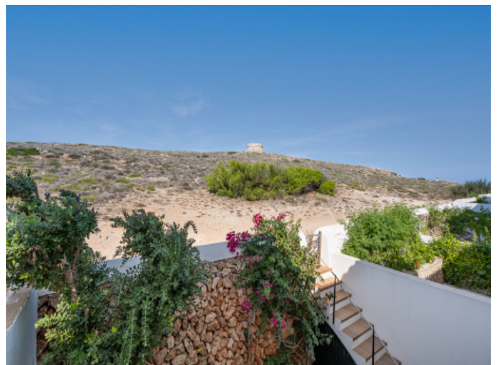
View from the rear side of the house