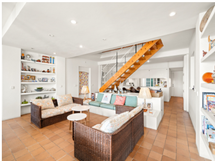
Spacious, open living area