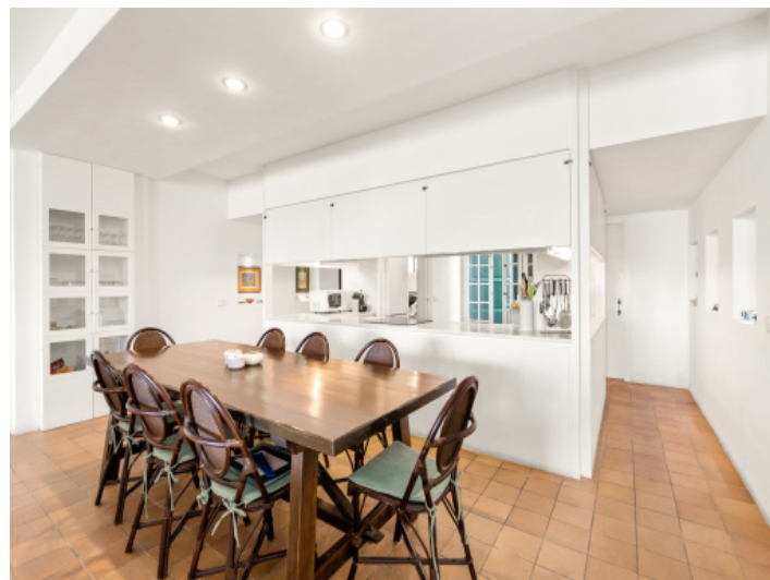
Dining area and half-open kitchen