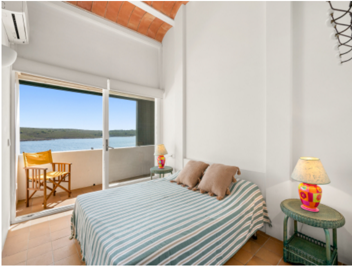
Dreamlike sea view bedroom