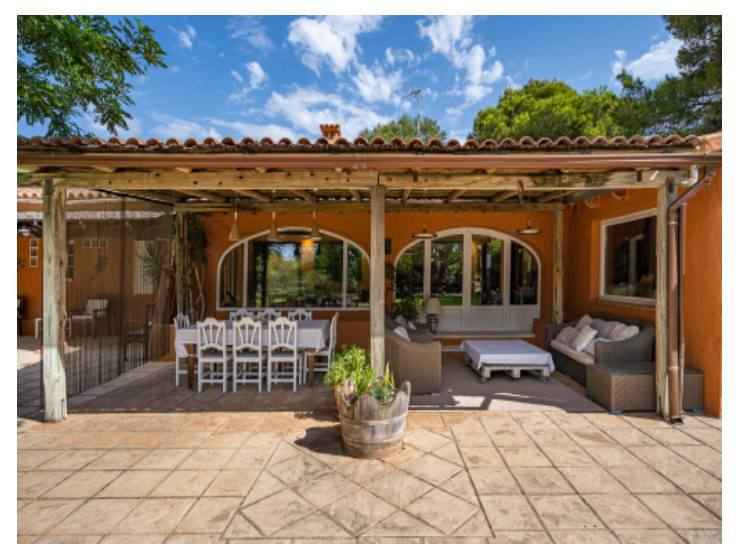
Large outdoor dining area