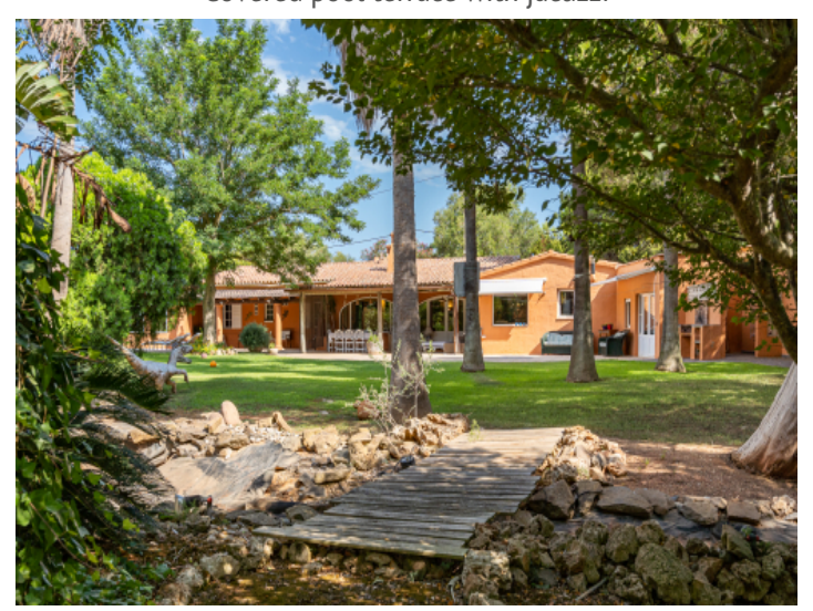
Finca with wonderful garden