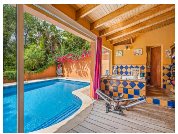
Covered pool terrace with jacuzzi