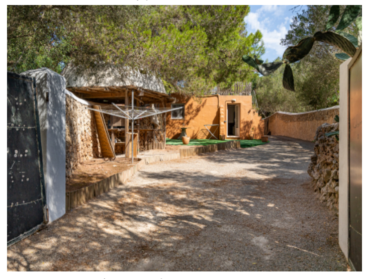
Access to the guest apartment