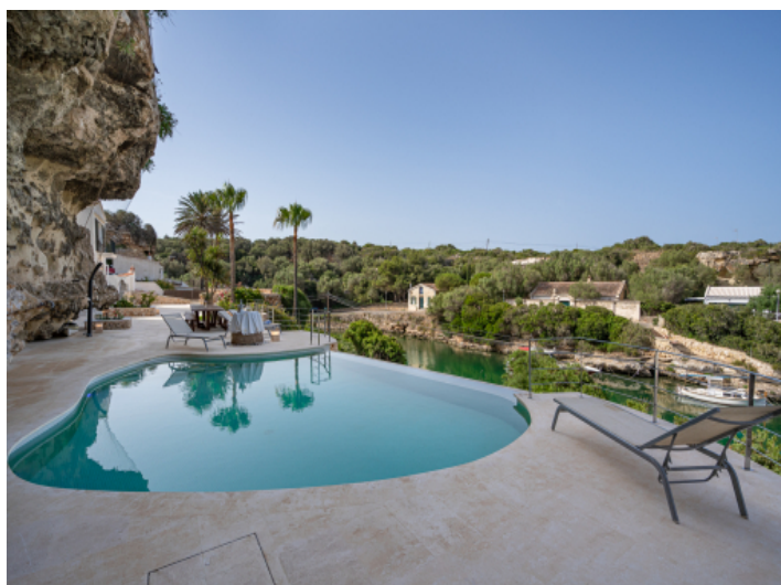
Pool in first sea line