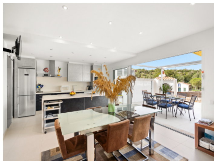
Bright dining area with access to the terrace