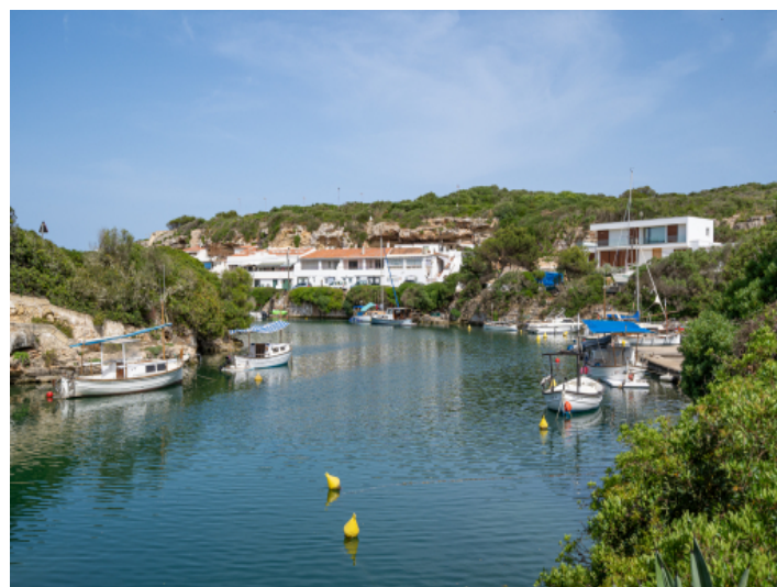
Beautiful views over the bay