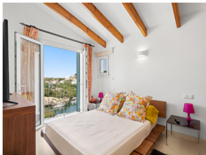
Further sea view bedroom