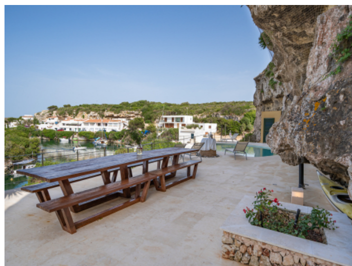
Large outdoor terrace with sea views