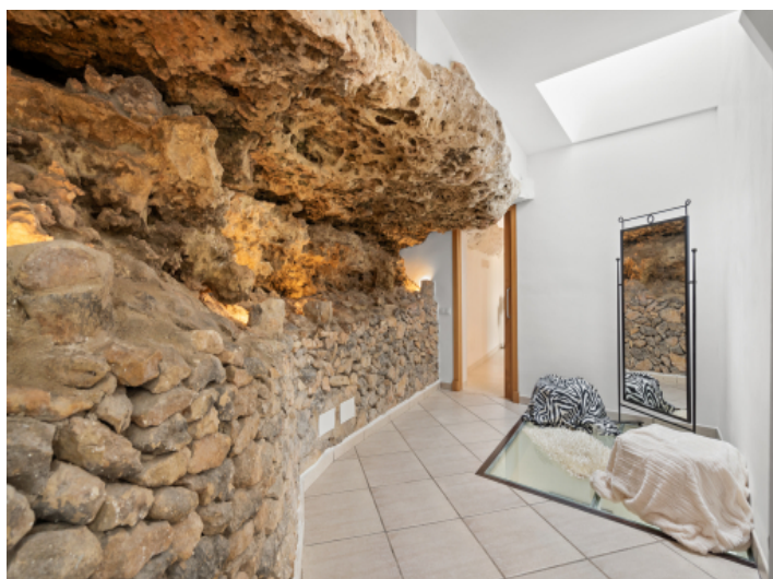
Corridor with original rock