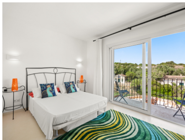
Double bedroom with balcony