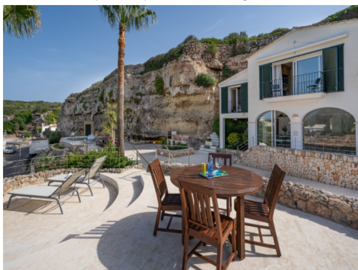
Extensive terrace with various areas