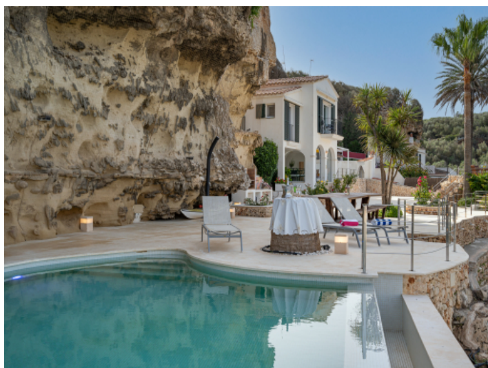
Impressive pool area with huge rock