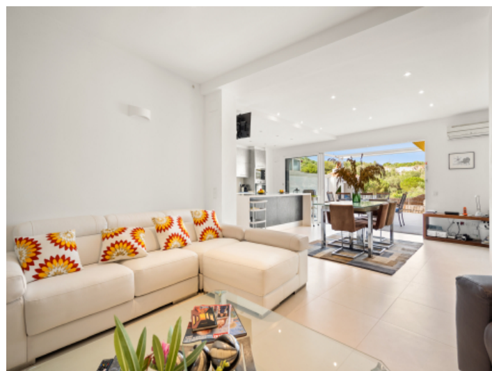
Lightflooded and adjoining living area