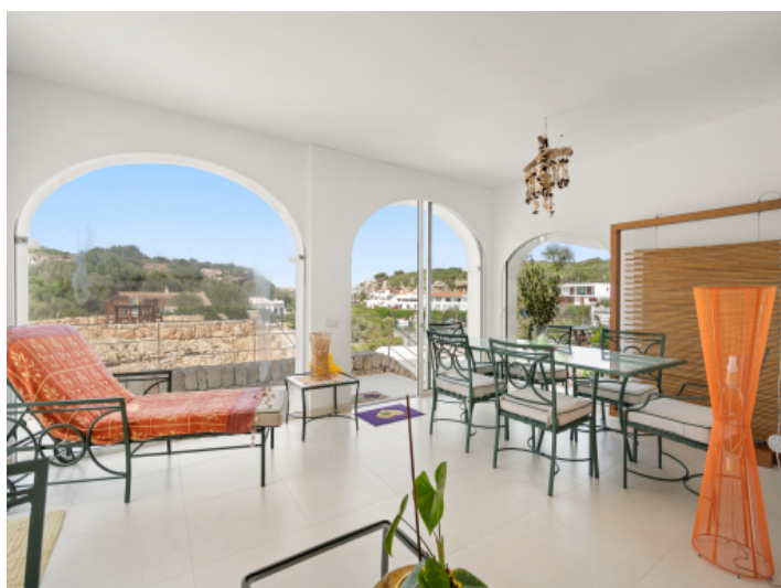
Further living area with panorama windows