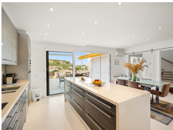
High-quality, open kitchen