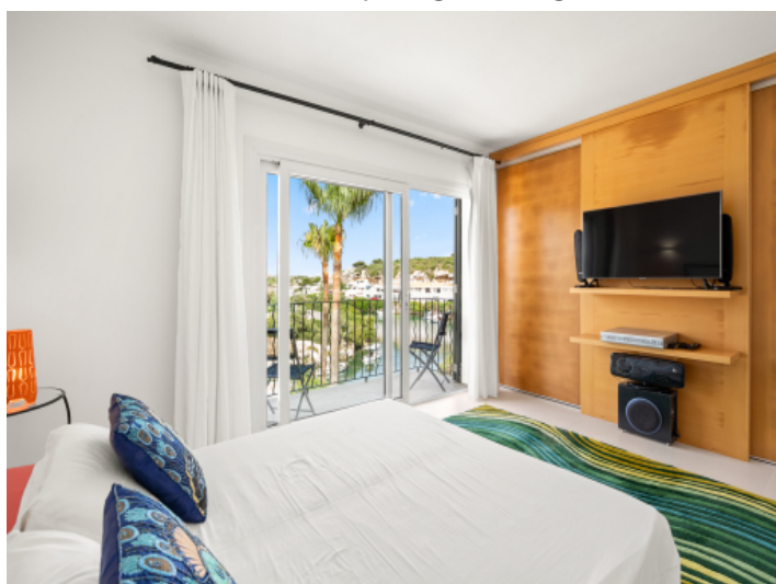
Wonderful sea view bedroom