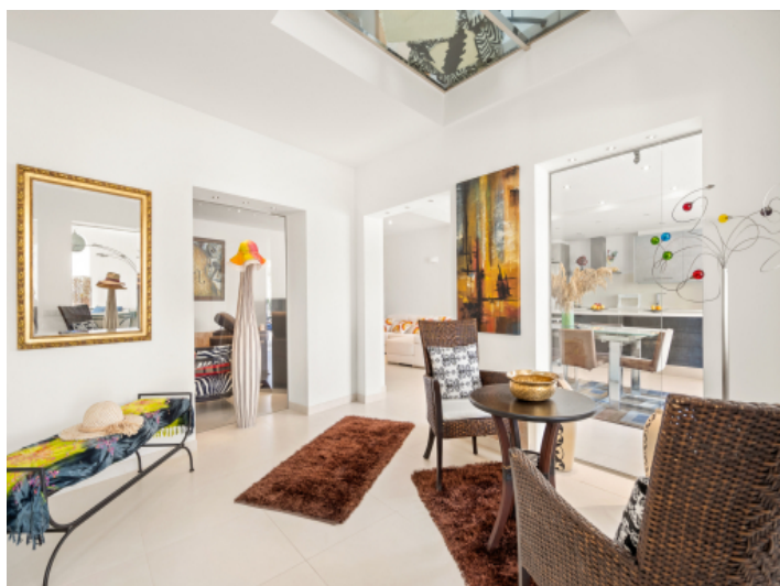
Further beautifully designed living room