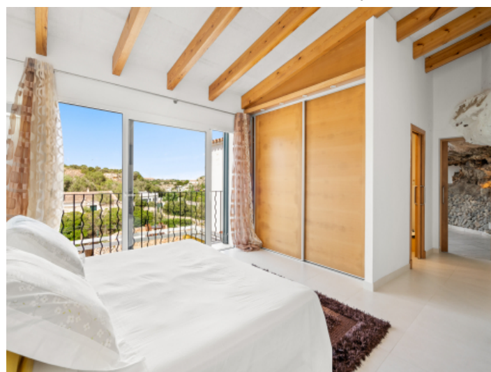
One of 3 bright bedrooms