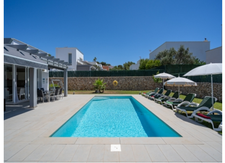
Wonderful pool for hot summer days