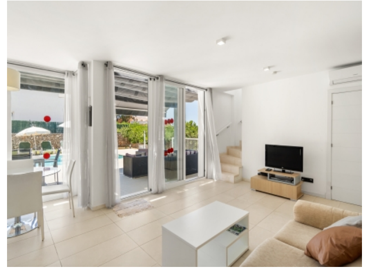
Bright living area with terrace access