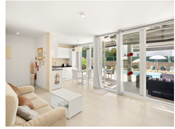
Living area and open kitchen