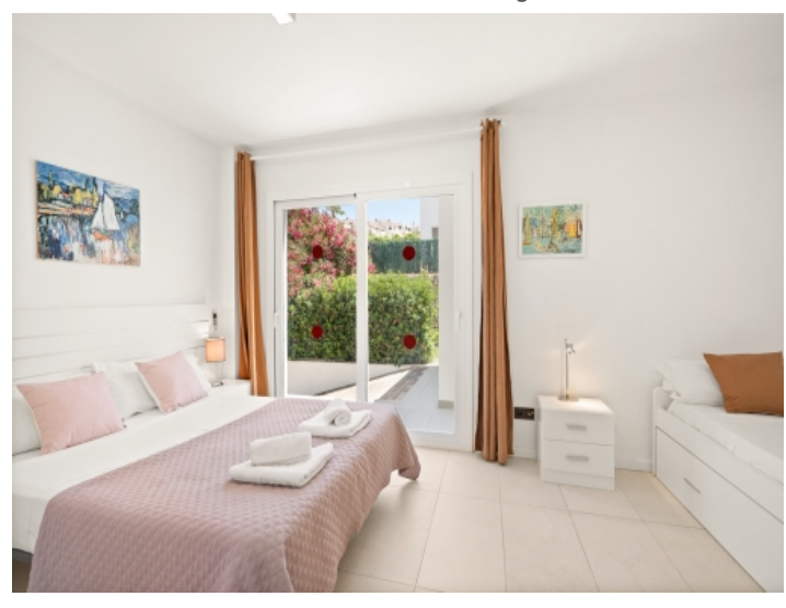
Bedroom with garde n access