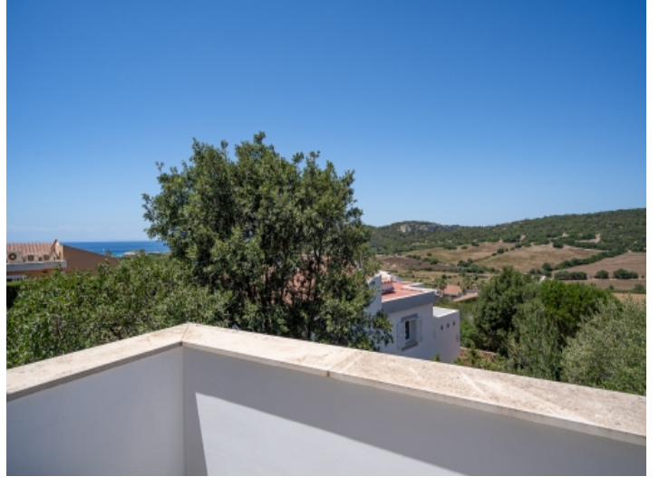
Beautiful sea views