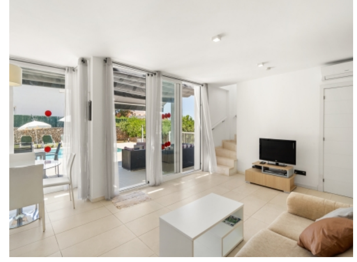
Bright living area with terrace access