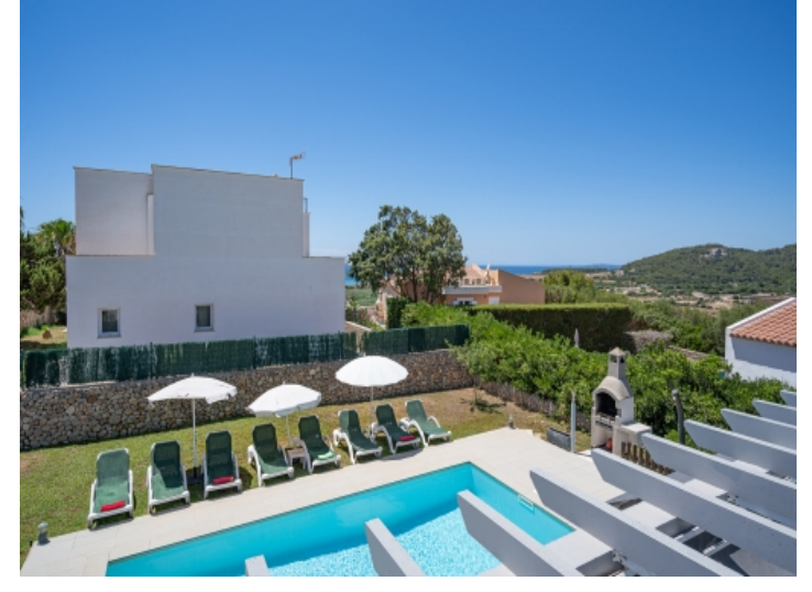
Views as far as the sea