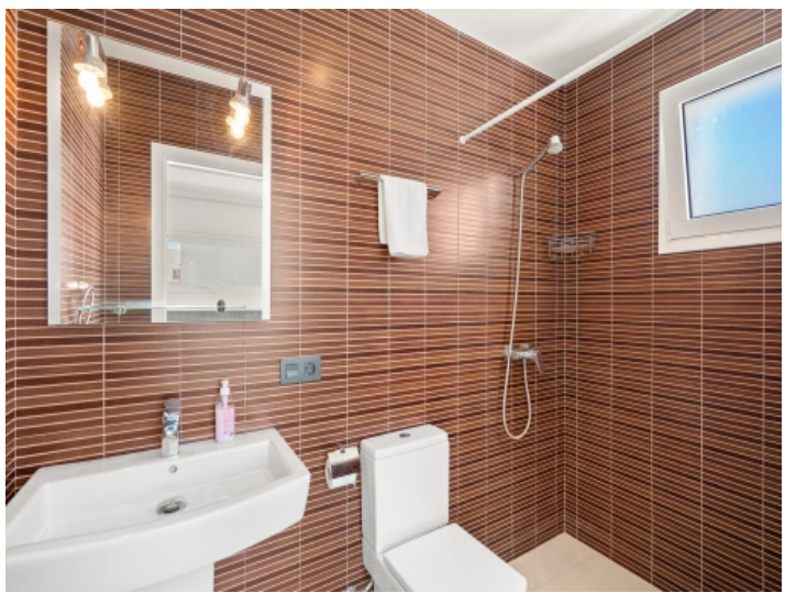
Modern shower bathroom