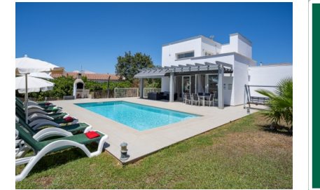
Son Bou search for property MEN-100553