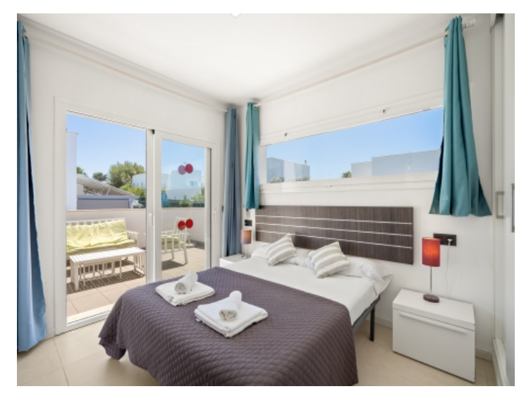
Bedroom with sea view terrace