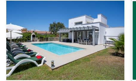
Son Bou search for property MEN-100553