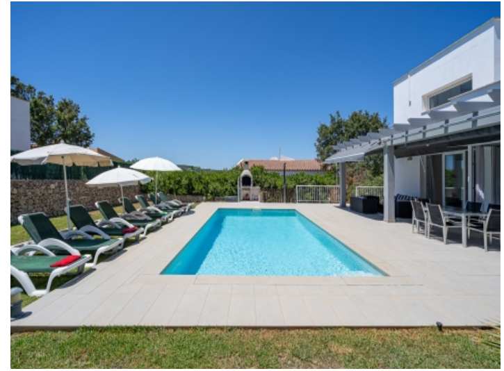
Splendid pool area