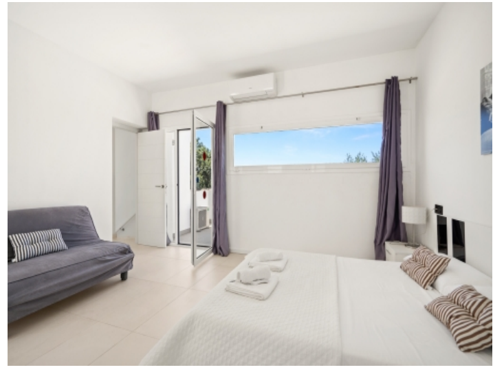
Bedroom on the upper floor