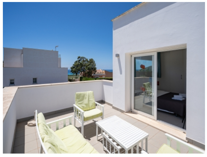
Sunny terrace with seating area