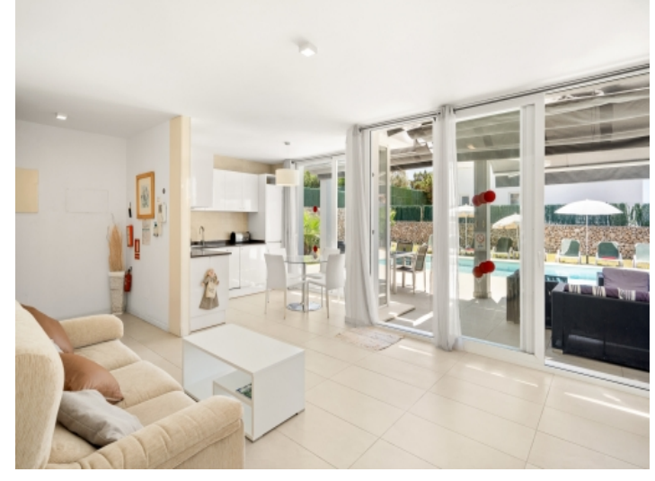
Living area and open kitchen