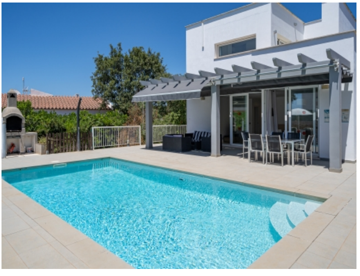
Pool and covered terrace