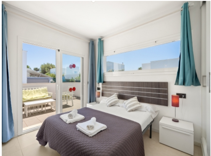
Bedroom with sea view terrace