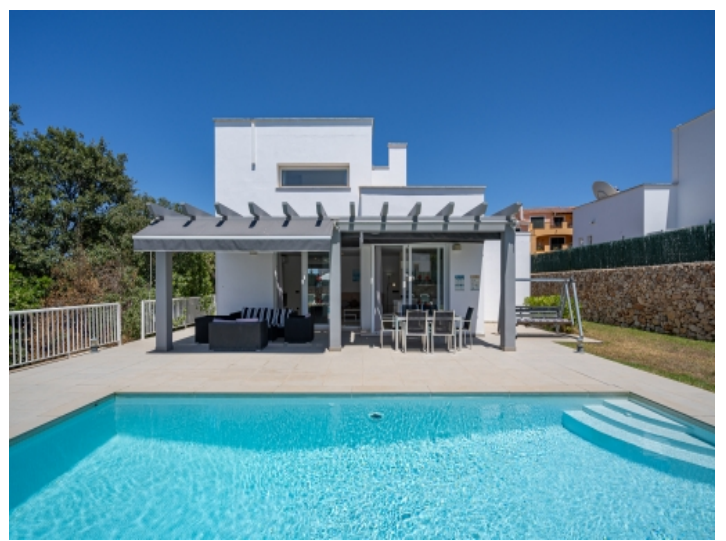
Outside view of the house