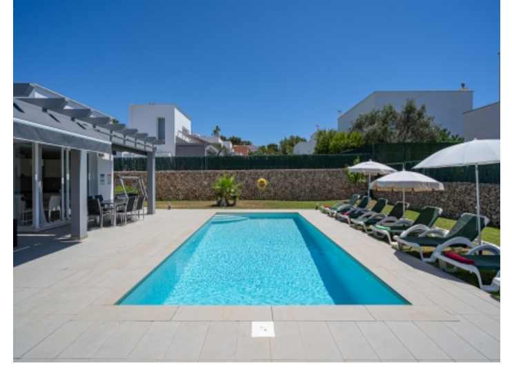
Wonderful pool for hot summer days