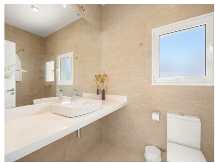
One of the 4 bathrooms