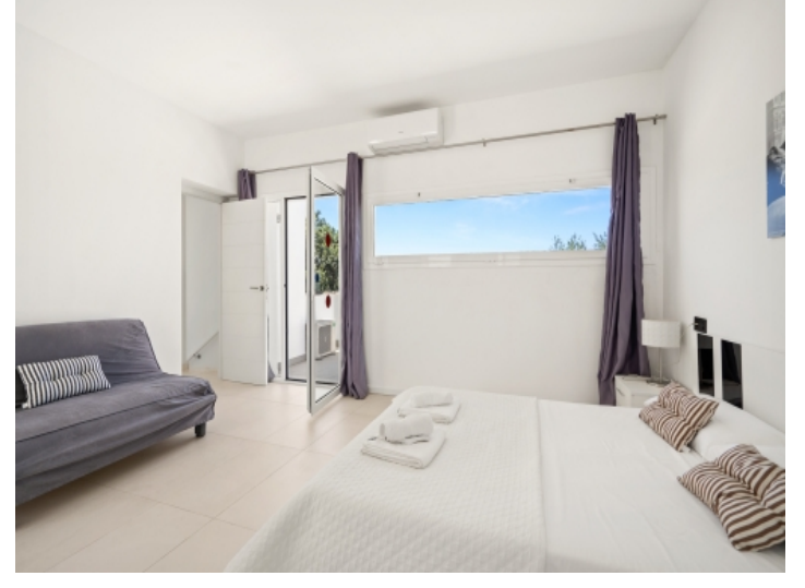
Bedroom on the upper floor