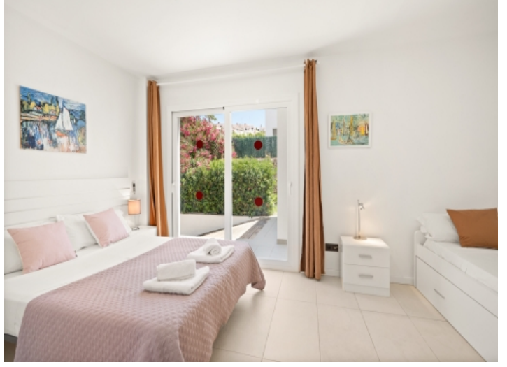
Bedroom with garde n access