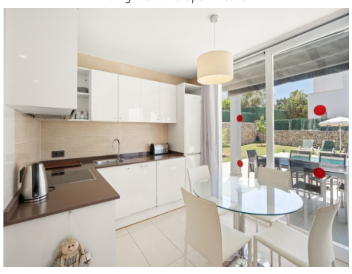
Modern kitchen and dining area