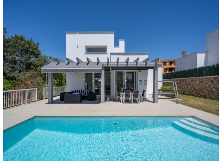
Outside view of the house