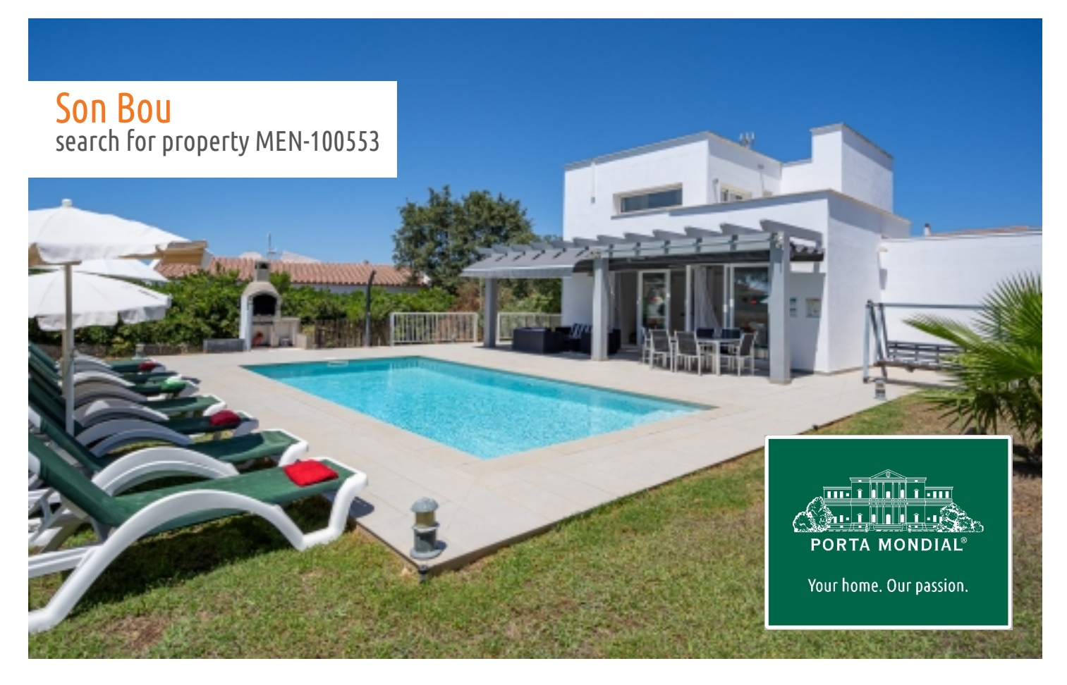
Villa with sea and country views in Son Bou