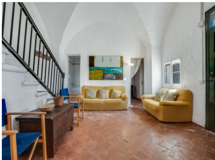
Living area at the entrance