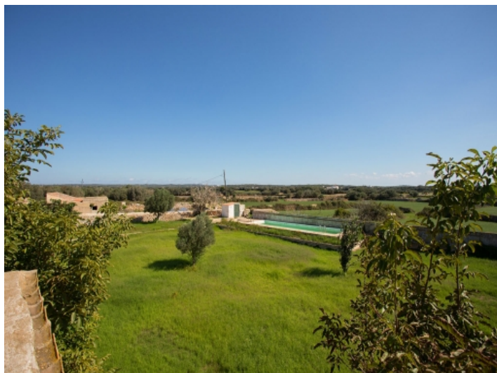
Green garden with pool