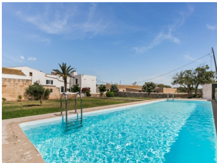
Enchanting pool area