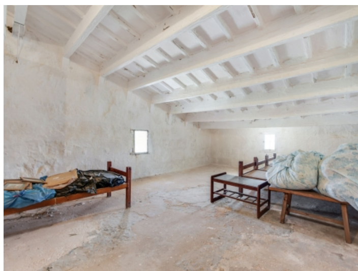
Attic room for renovation