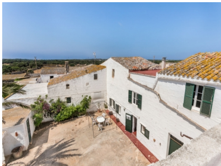
Roof terrace with panoramic views