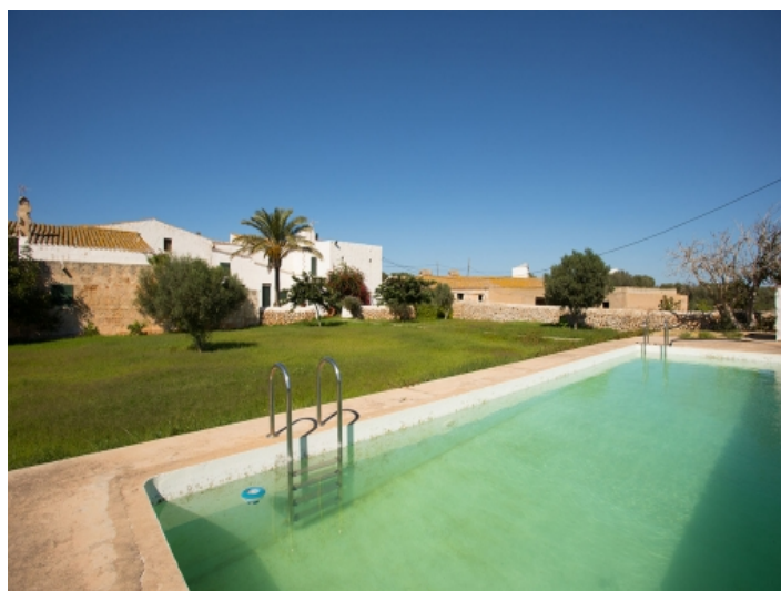
Pool area surrounded by a large garden