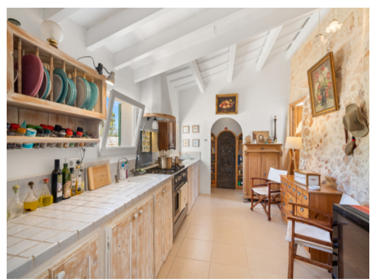
Kitchen with traditional charme