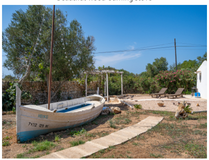
Large outdoor and garden area