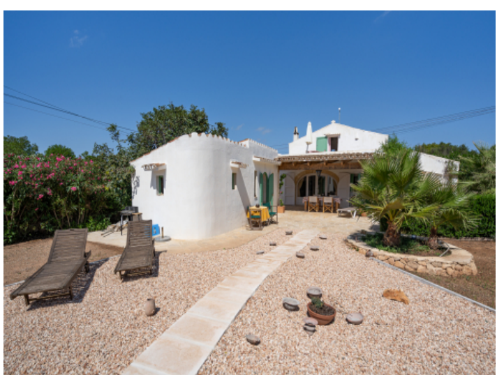
Exterior view and terraces