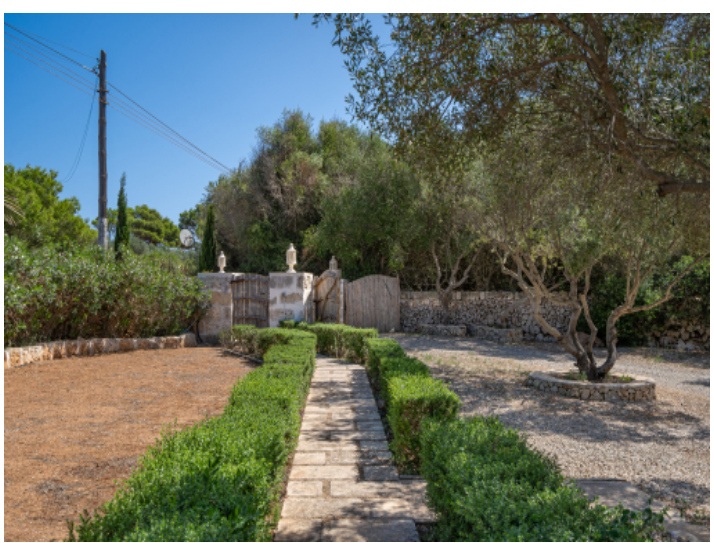
Access to the property