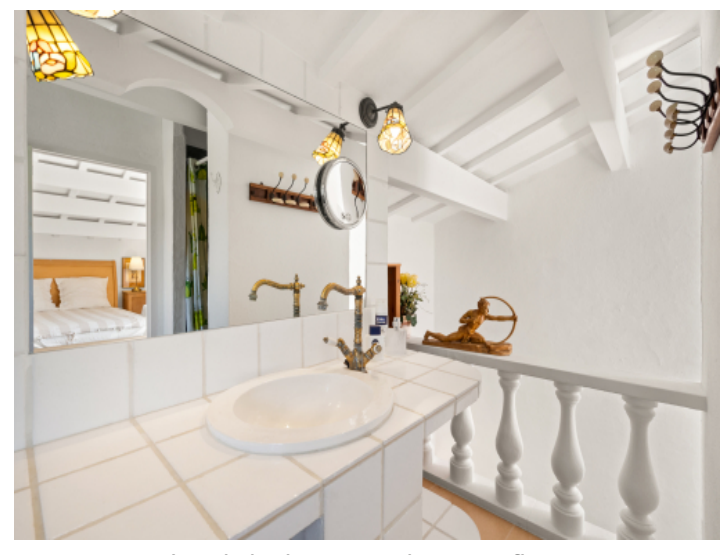
Lovely bathroom on the upper floor