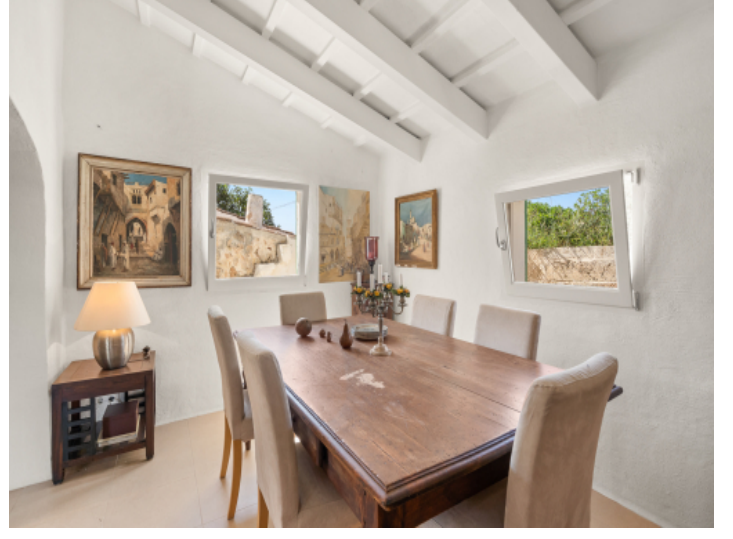
Bright and beautiful dining area

PORTA MONDIAL MENORCA • AVENIDA FORT DE L'EAU, 175, LOCAL 6, 07701 MAHÓN, MENORCA, SPAIN TEL.: +34 871 510 261 • MENORCA@PORTAMONDIAL.COM • WWW.PORTAMONDIAL.COM/EN/MENORCA/