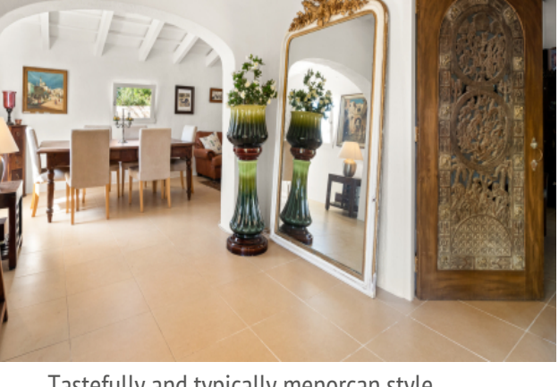
Tastefully and typically menorcan style