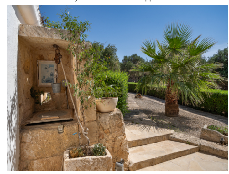
Original fountain next to the terrace