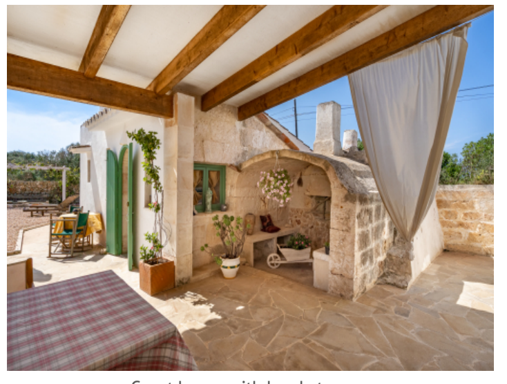
Guest house with lovely terrace

PORTA MONDIAL MENORCA • AVENIDA FORT DE L'EAU, 175, LOCAL 6, 07701 MAHÓN, MENORCA, SPAIN TEL.: +34 871 510 261 • MENORCA@PORTAMONDIAL.COM • WWW.PORTAMONDIAL.COM/EN/MENORCA/