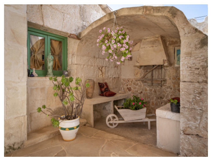
Beautiful wood-burning stove