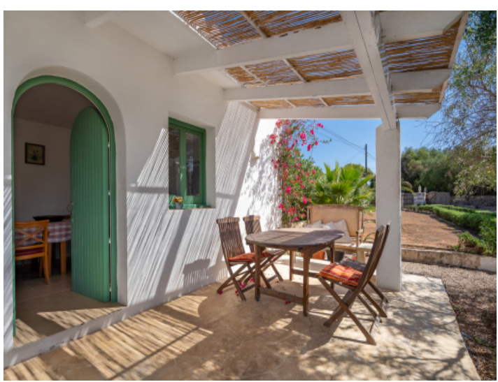
Further building with living and bedroom