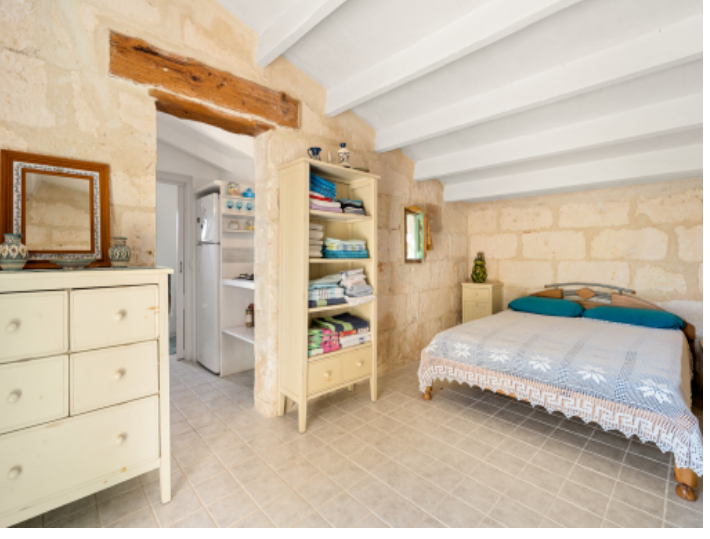
Double bedroom with sandstone walls

PORTA MONDIAL MENORCA • AVENIDA FORT DE L'EAU, 175, LOCAL 6, 07701 MAHÓN, MENORCA, SPAIN TEL.: +34 871 510 261 • MENORCA@PORTAMONDIAL.COM • WWW.PORTAMONDIAL.COM/EN/MENORCA/