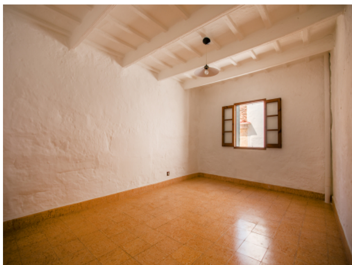
One of 6 rooms