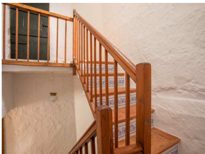
View of the floor