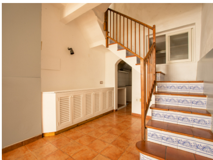
Open entrance area