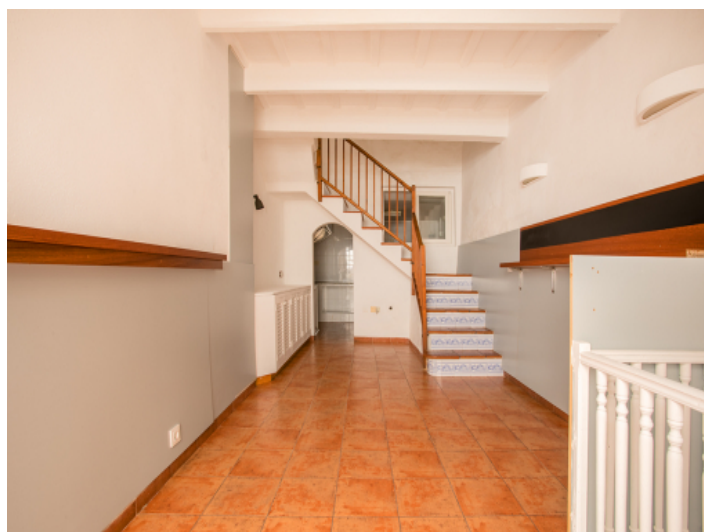
Open entrance area