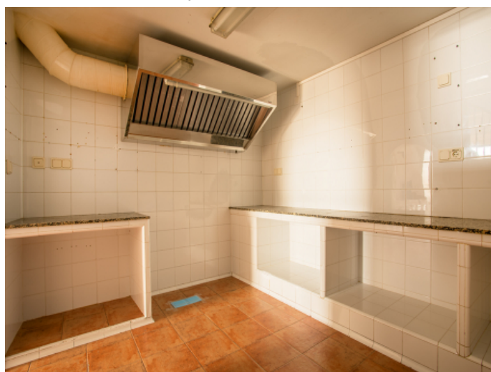
Rustic kitchen area