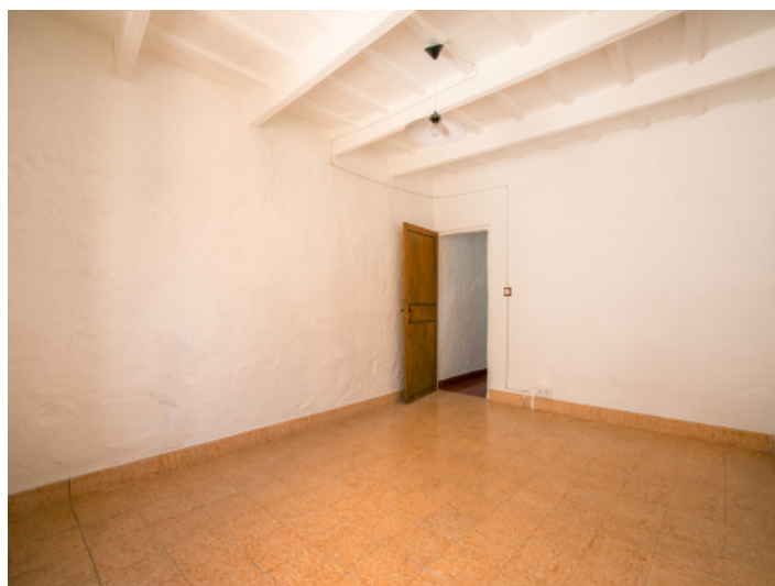
One of 6 rooms