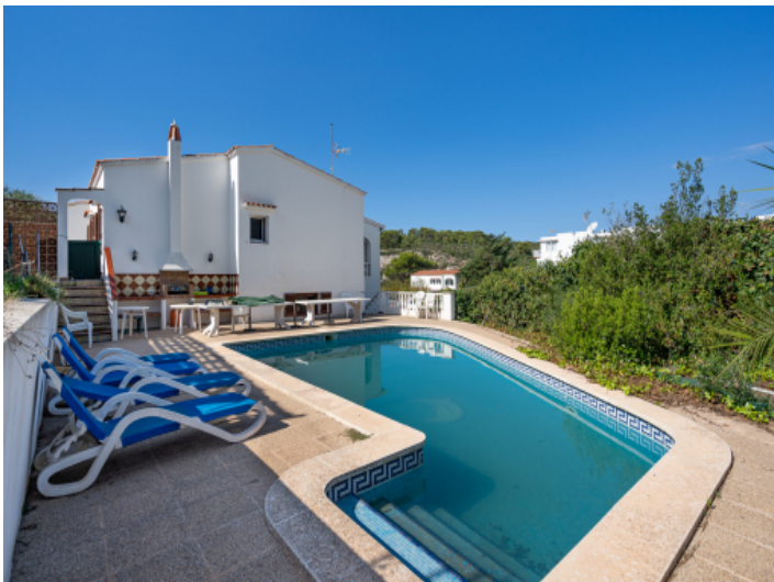
Pool area with many possibilities