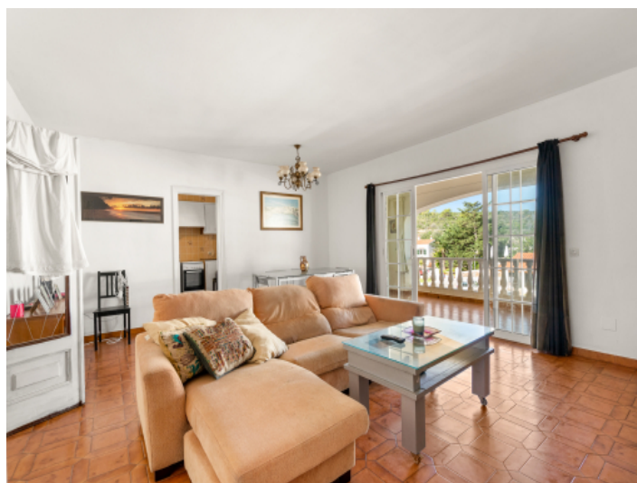
Lightflooded living and dining area