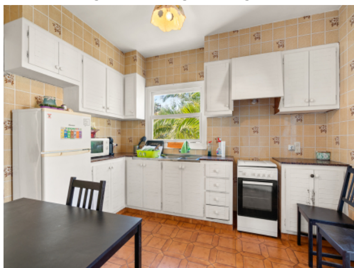
Bright kitchen with dining area