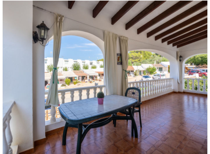
Large, covered terrace