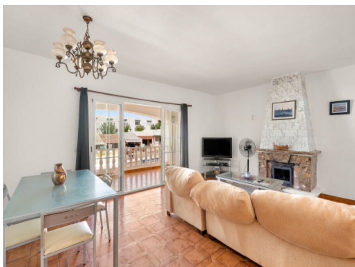
Direct terrace access