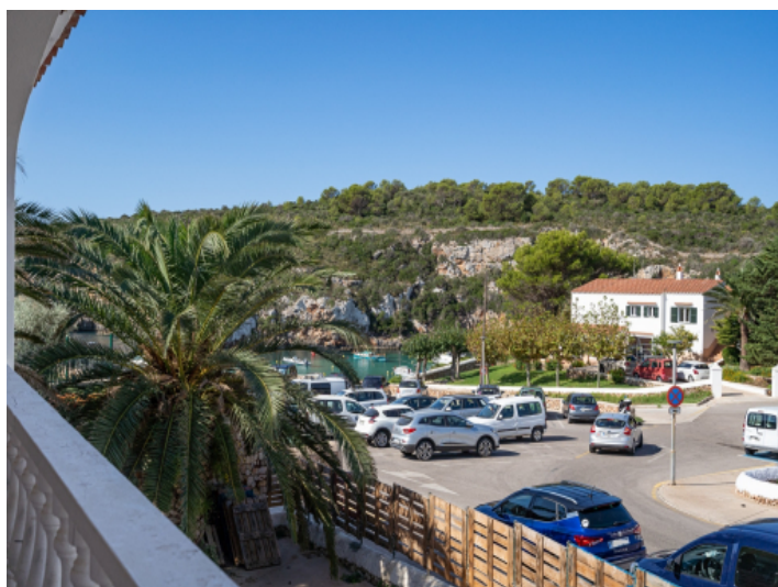
View to the sea from the terrace