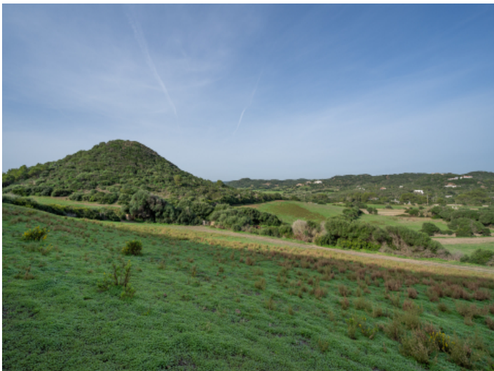
View over the plot and the countryside