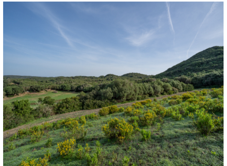
View over the plot and the countryside