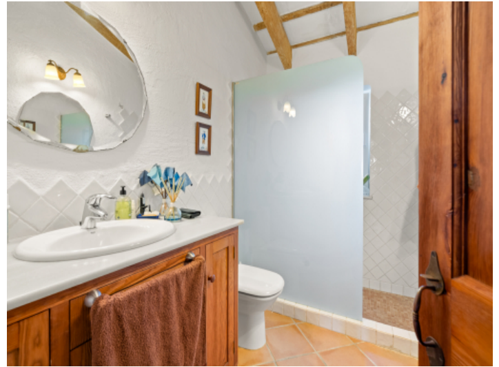
Beautiful shower bathroom