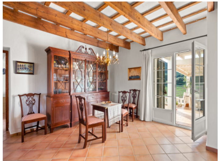
Access to the large, covered terrace