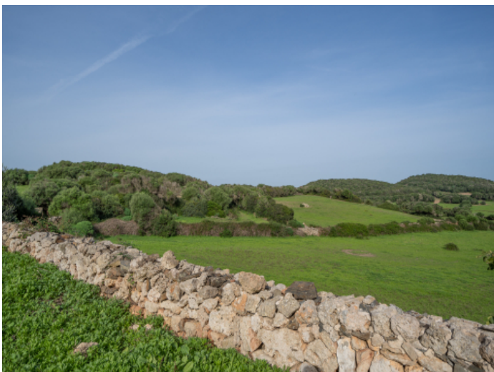
View over the plot and the countryside