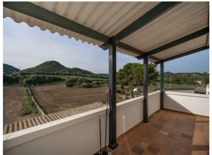
Upper terrace with views sweeping views