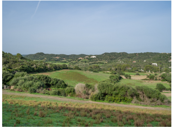
Large 44ha country estate