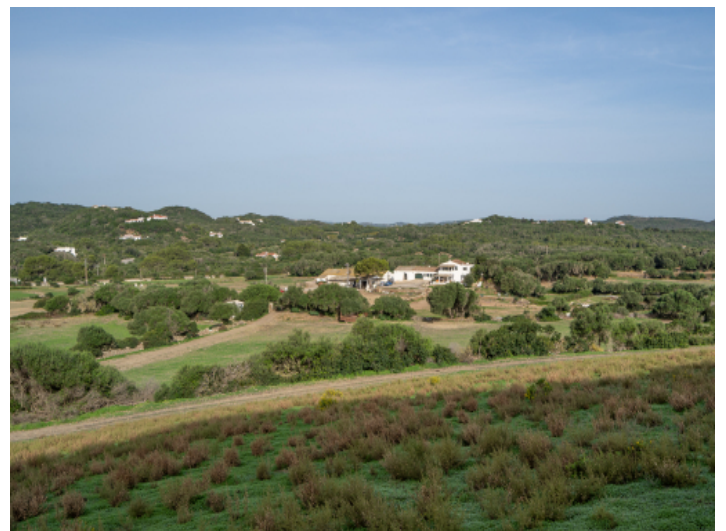
View of the finca