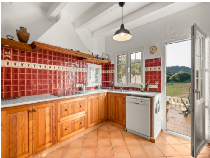
Beautifully country house kitchen with terrace access