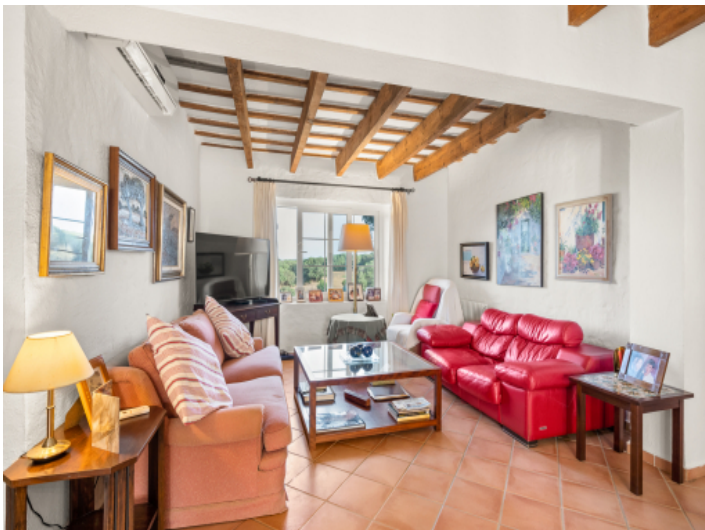
Cosy living room with wooden ceiling beams