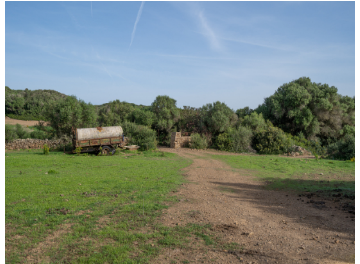
View over the plot