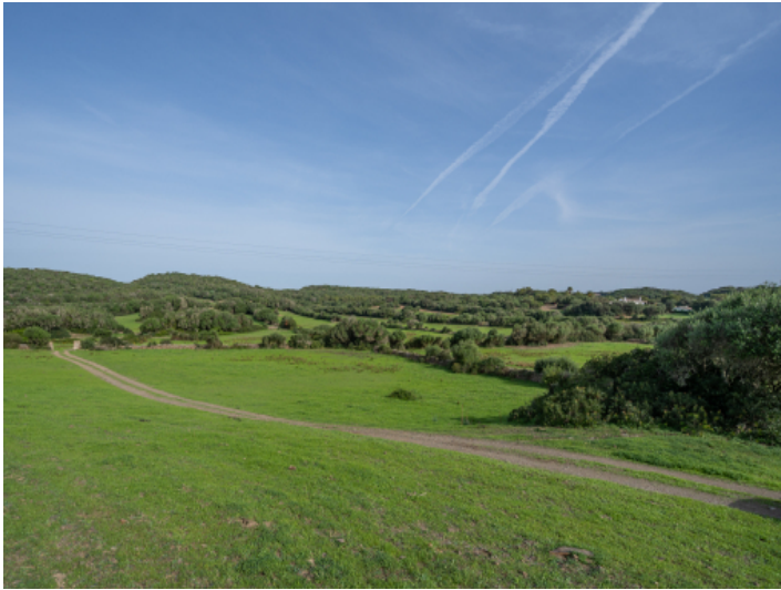
Driveway to the finca