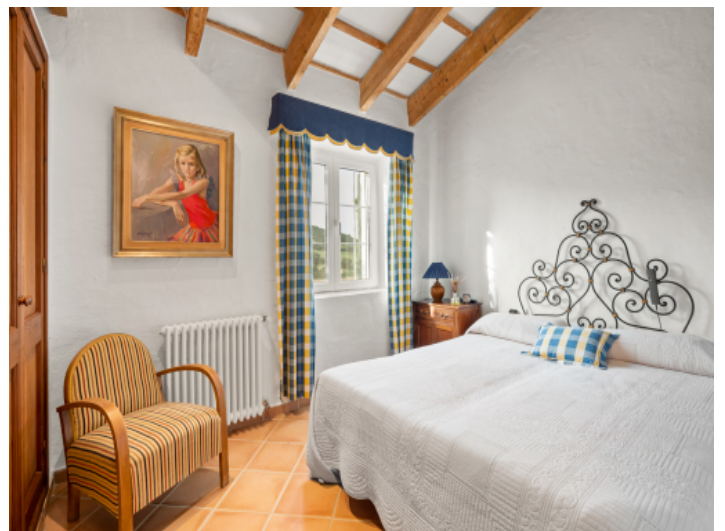
Lovely double bedroom