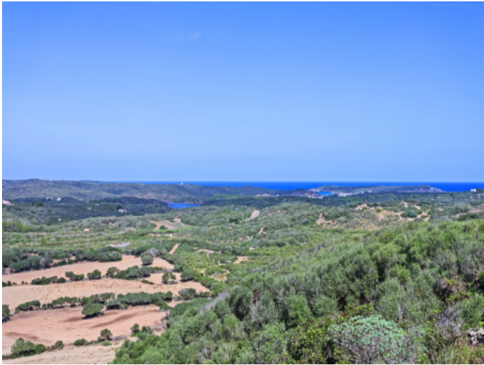
Panorama sea view