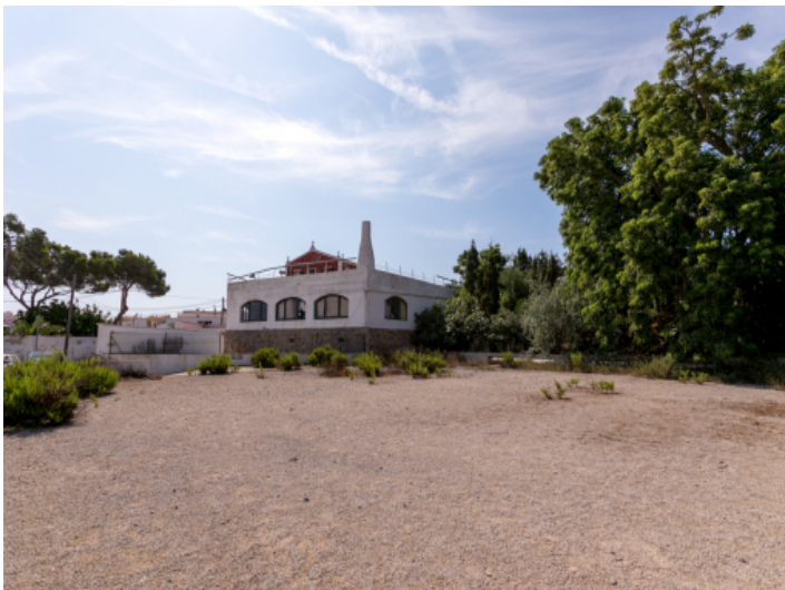
Access to the villa