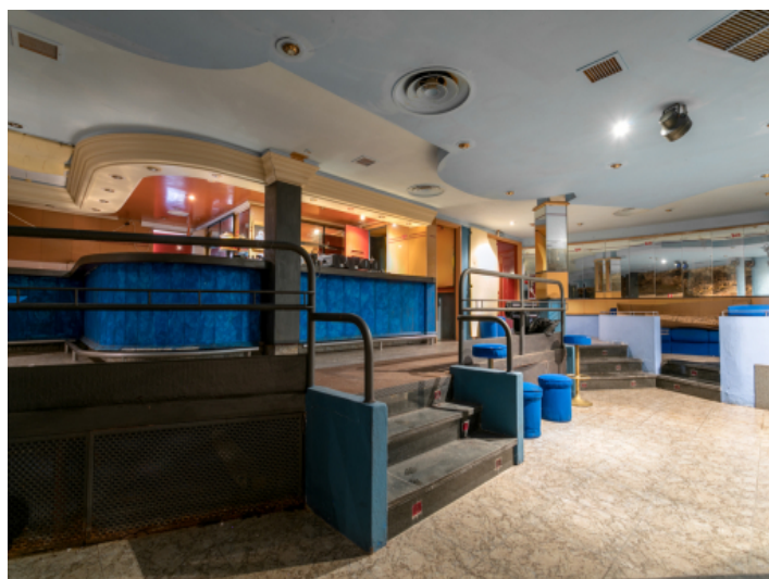
View of the bar area