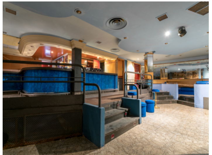
View of the bar area