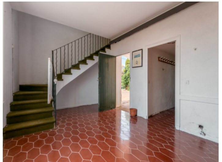
Entrance area with staircase