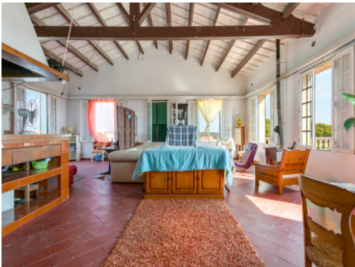
Living area with high ceiling