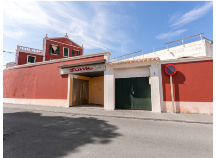
Access to the disco