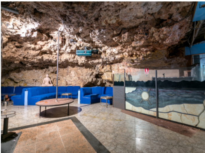
Disco in the cliffs