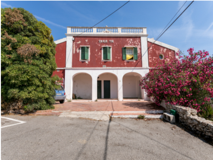
Front view of the villa