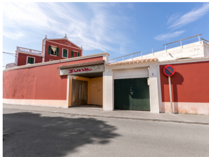
Access to the disco