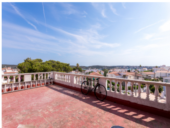
Roof terrace with fantastic views of the harbour