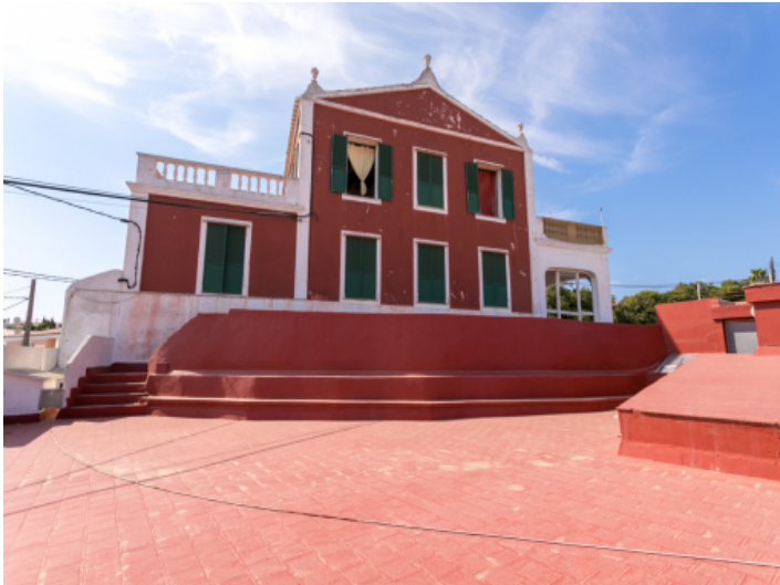
Rear view of the large villa