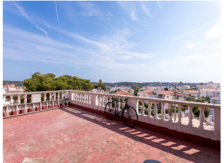
Roof terrace with fantastic views of the harbour