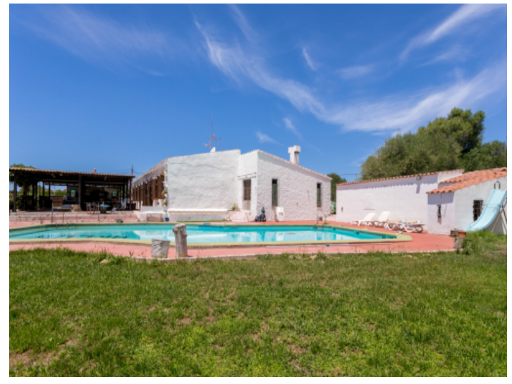
Garden and pool area