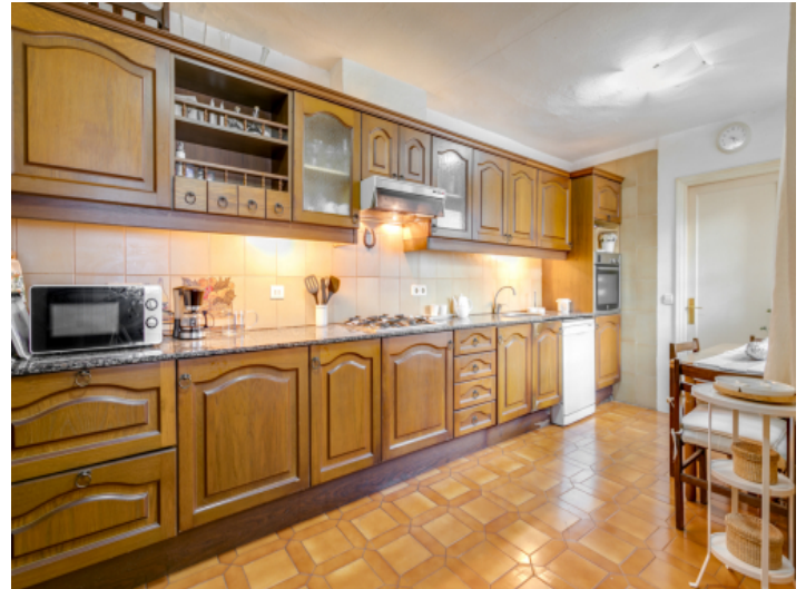
Dining area and fully equipped kitchen