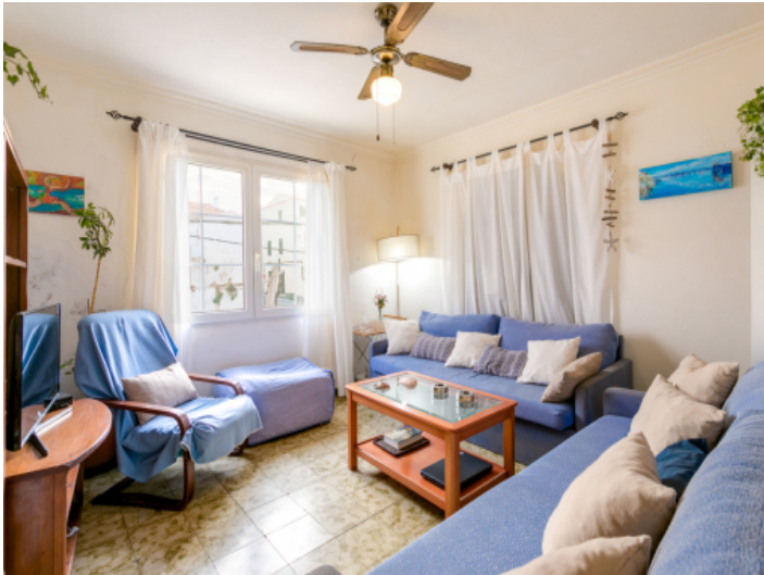
Friendly living area