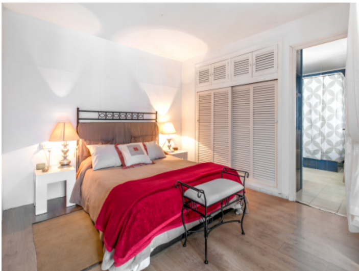
Bedroom flooded with light