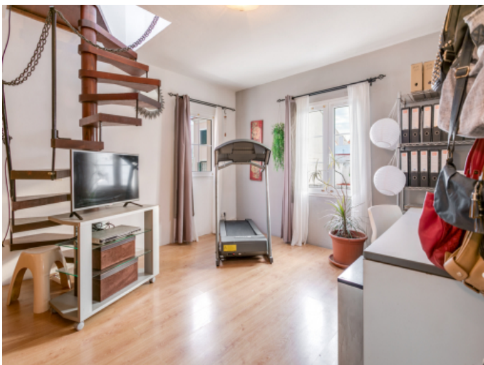
Bright suite on the second floor