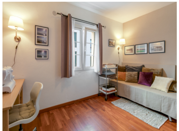
Quiet reading room