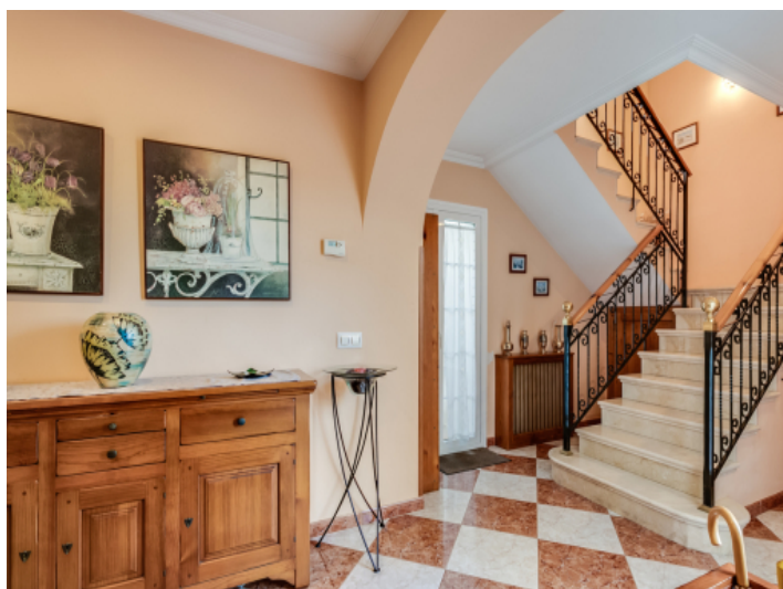
Inviting entrance area