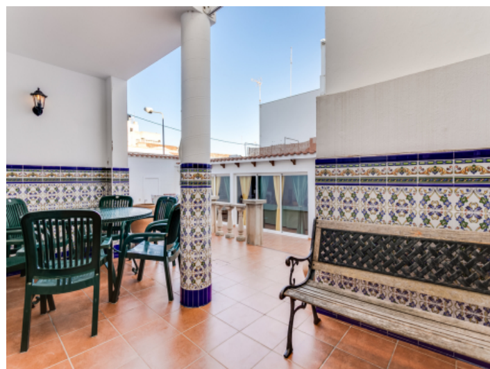
Terrace with beautifully tiled wall