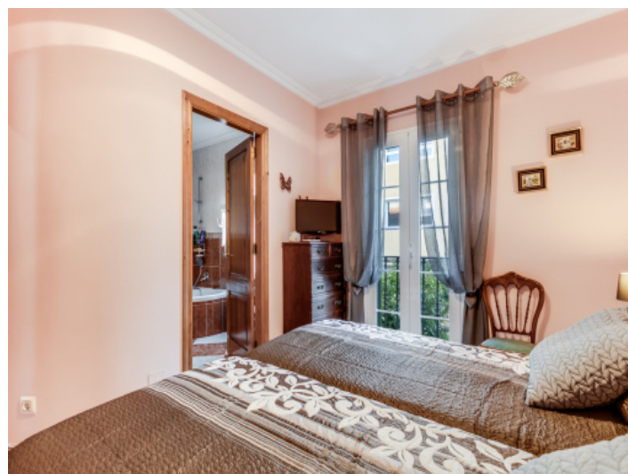
Bedroom with french balcony