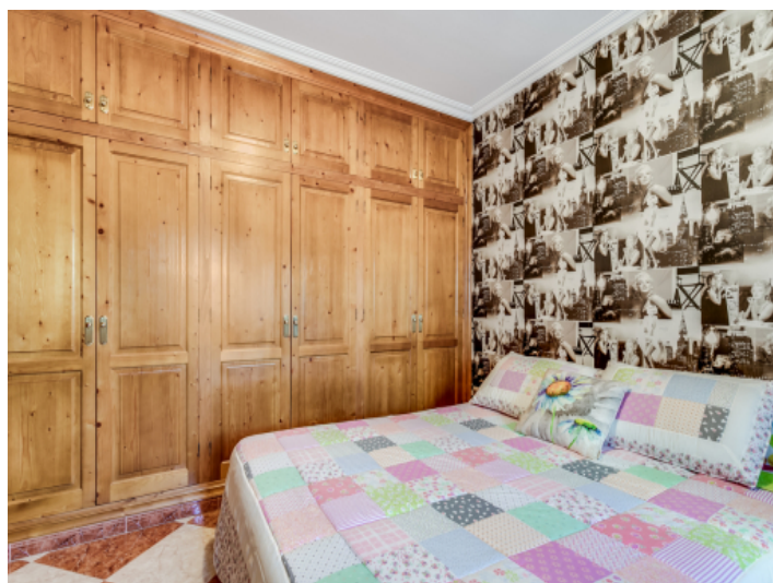
One of 5 bedroom