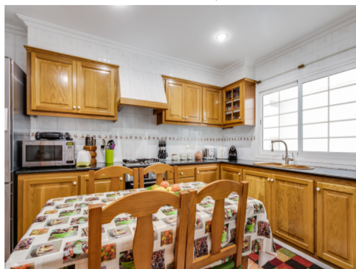
Kitchen with further dining area