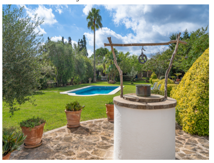
Own fountain in the garden