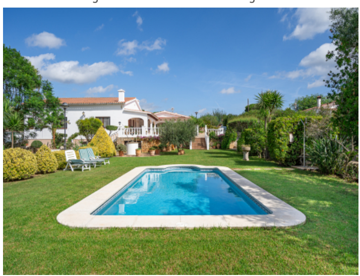
Very well-maintained garden