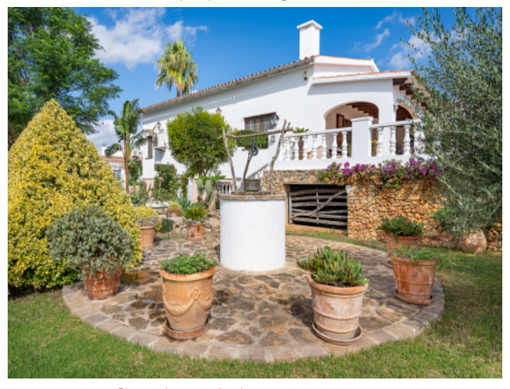
Charming typical menorcan property