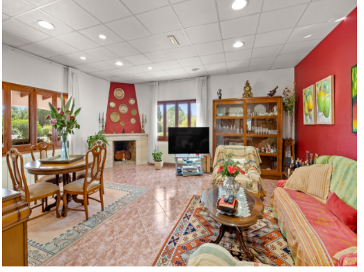
Living and dining area with fireplace

PORTA MONDIAL MENORCA • AVENIDA FORT DE L'EAU, 175, LOCAL 6, 07701 MAHÓN, MENORCA, SPAIN TEL.: +34 871 510 261 • MENORCA@PORTAMONDIAL.COM • WWW.PORTAMONDIAL.COM/EN/MENORCA/