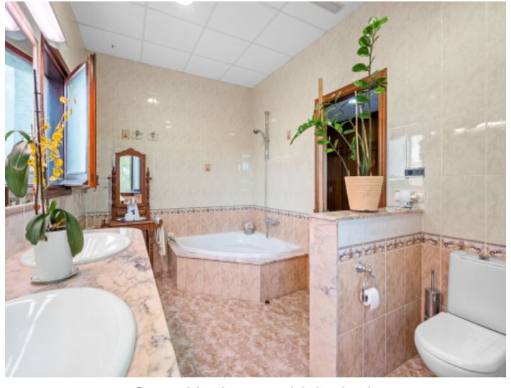
Second bathroom with bathtub