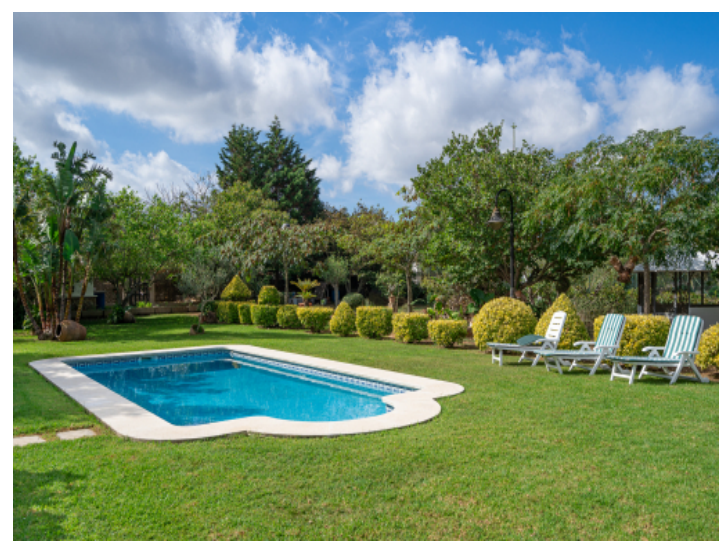
Tranquil pool and garden area