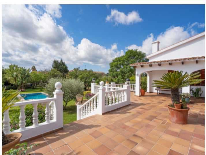
Large terrace with stairs to the garden