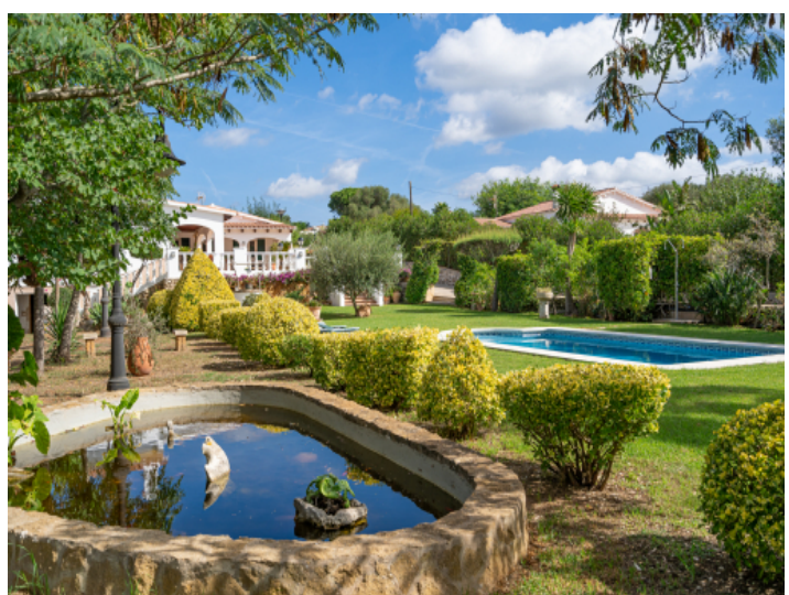
Lovely garden with pond and vegetation