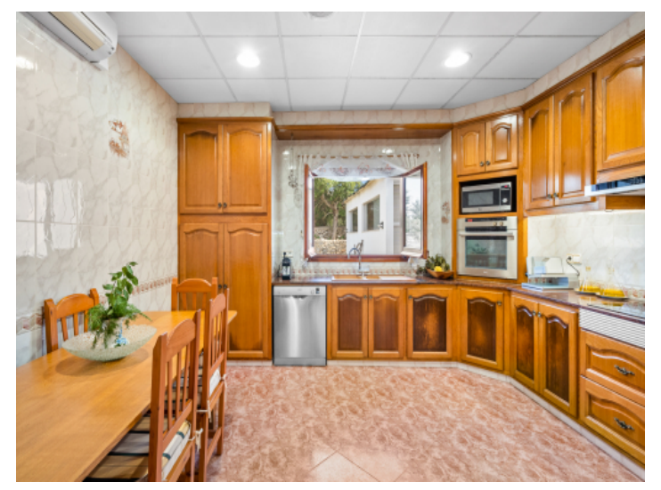
Rustic kitchen with ample space