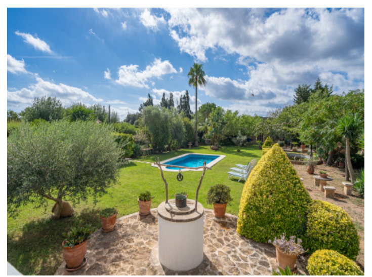
View over the wonderful plot