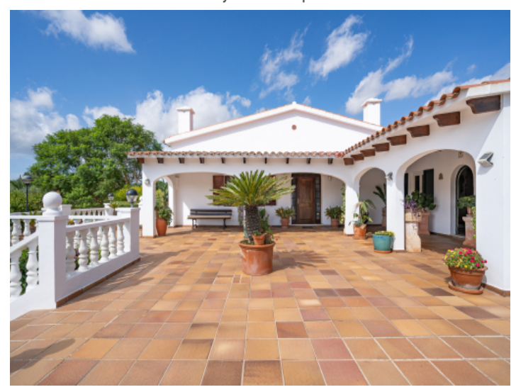
Terrace with partly covered areas