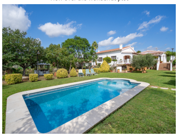
Beautifully laid-out pool area