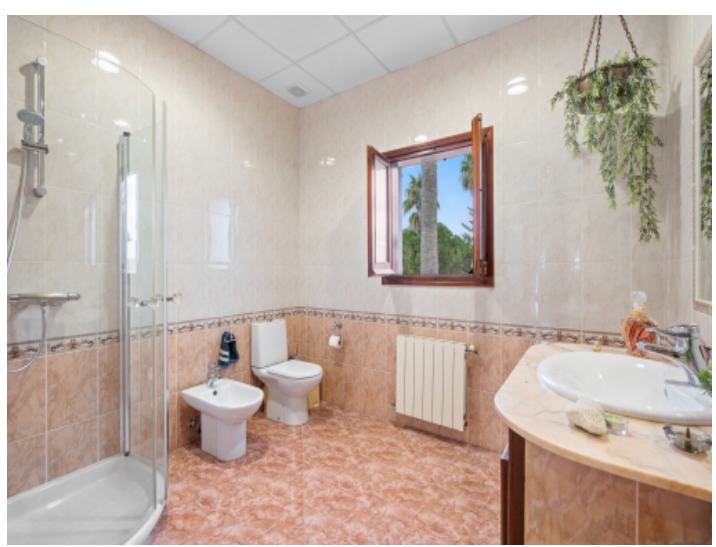
Bright shower bathroom