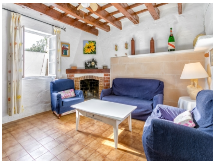
Cosy living area with fireplace