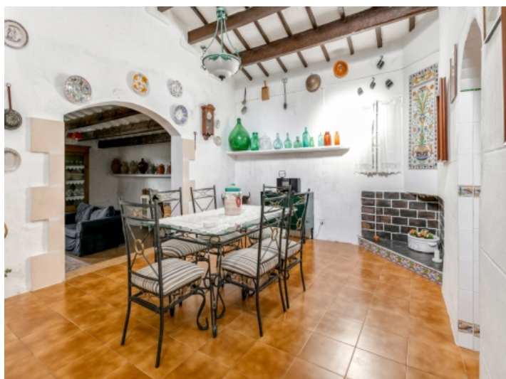
Dining area of the finca