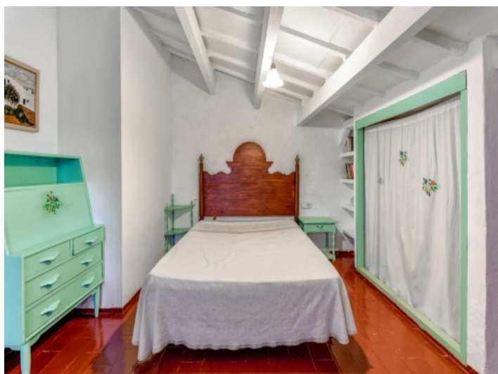
Second bedroom with built-in wardrobe