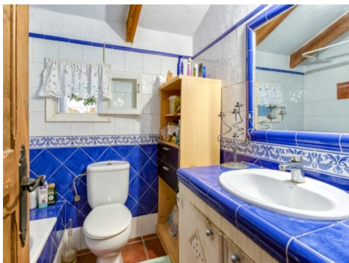
Bathroom of the guest house