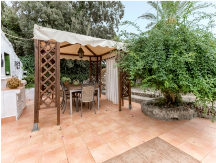
Exterior dining area