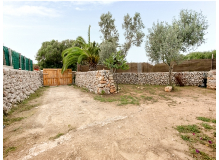
Large garden and entrance area