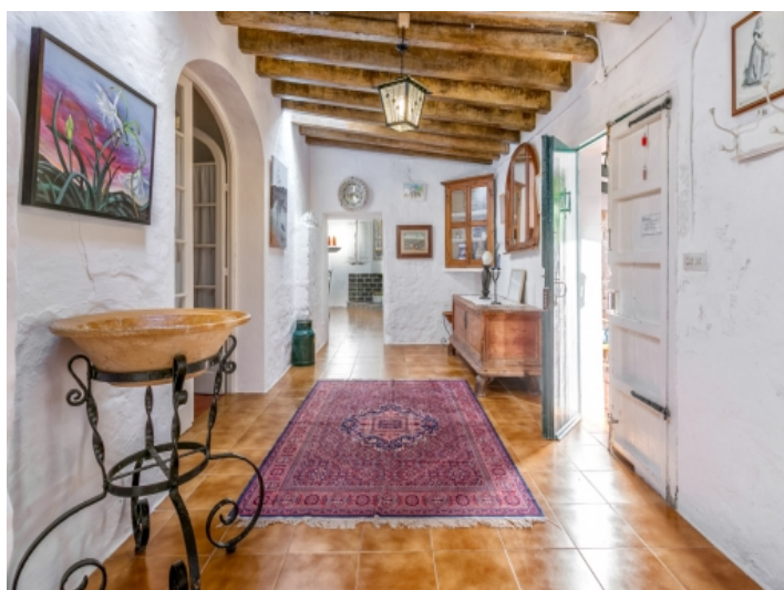
Bright entrance area of the finca