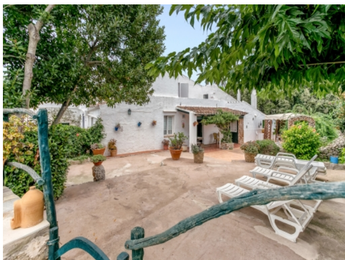
Exterior views of the finca