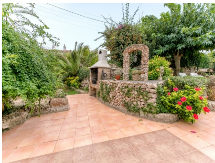
Well maintained garden