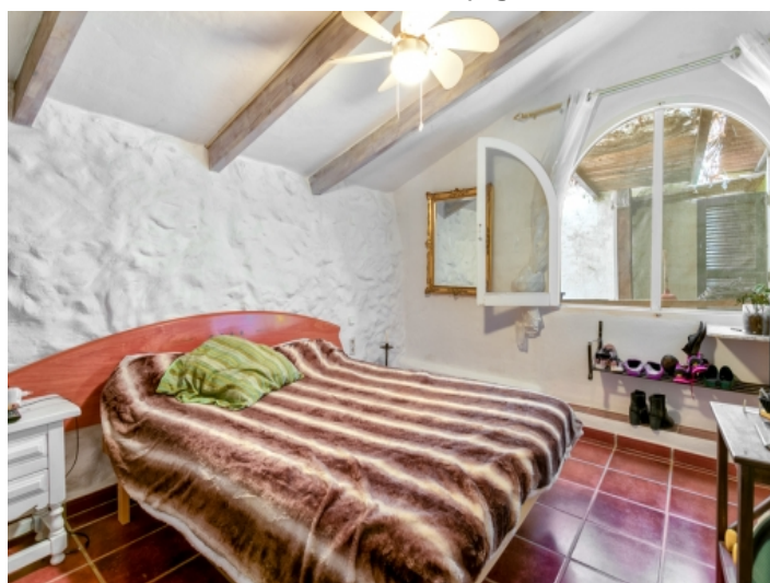
Bedroom of the guest house