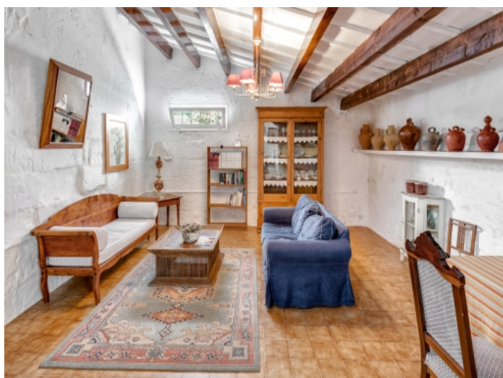
Alternative views of the living area