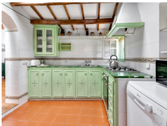
Fully equipped, rustic kitchen