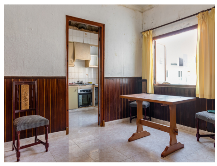
The town house needs a renovation