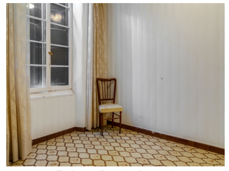
The house offers a lot of potencial