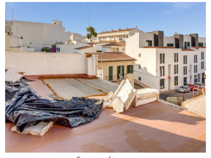
Sunny roof terrace