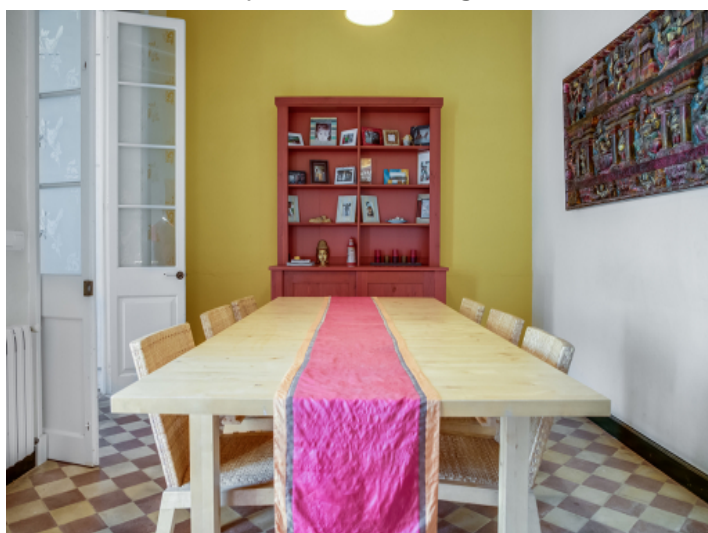
Beautiful dining area