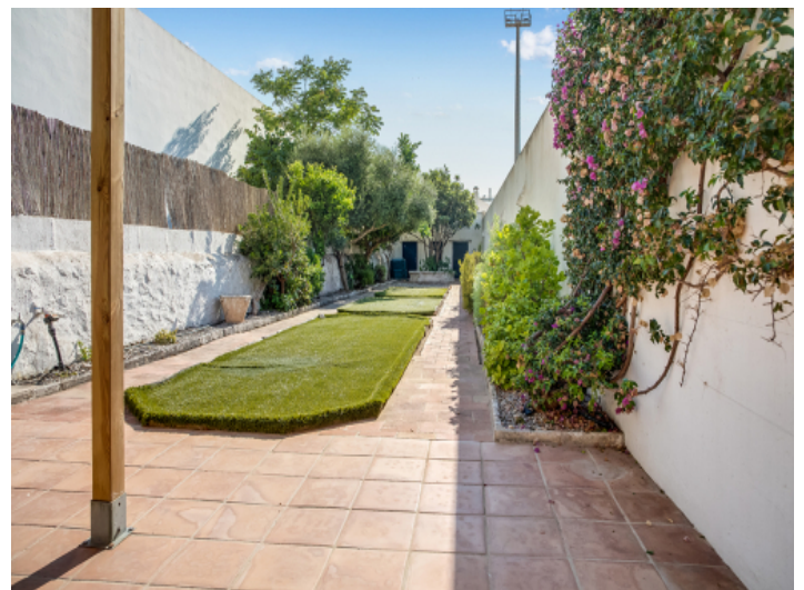
The large garden offers privacy