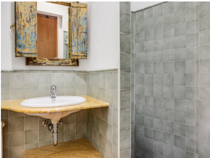
One of 4 unique bathrooms