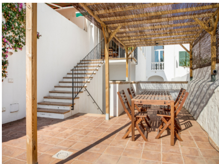
Sunny terrace with dining area