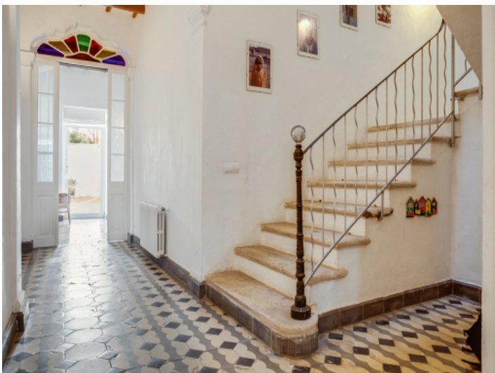
The colourful tiled floor gives the house a special charme