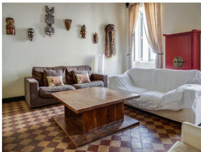
Spacious living area with heating