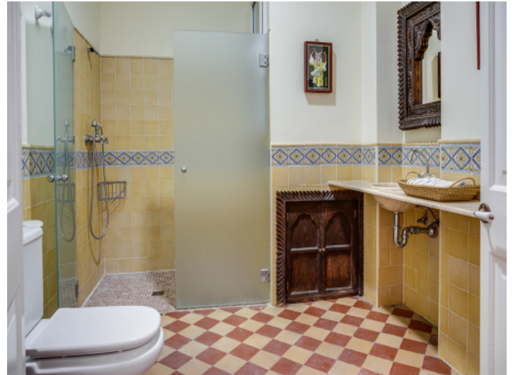
Bathroom in an authentic style