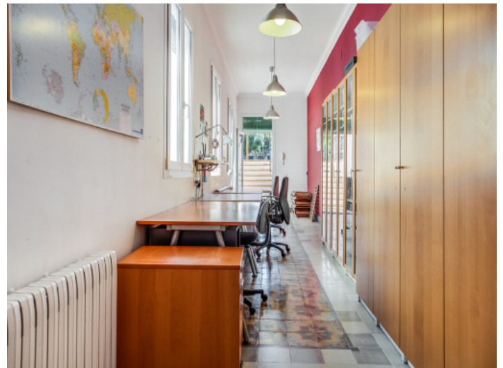
Long working room with terrace access