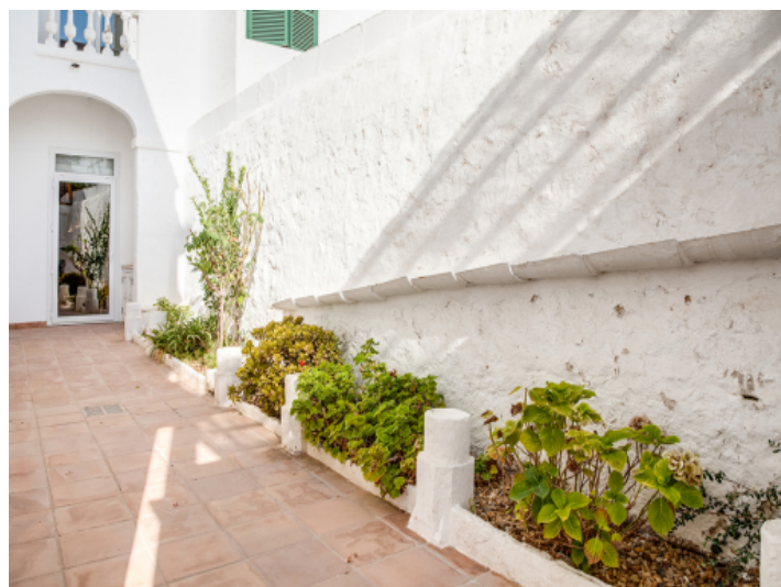
Access to the town house