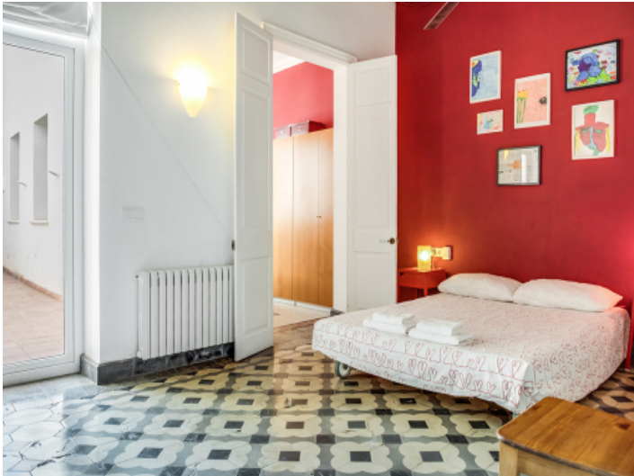
One of 5 charming bedrooms