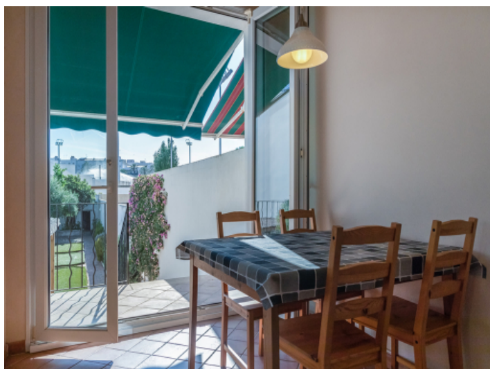
Further dining area with direct access to the garden