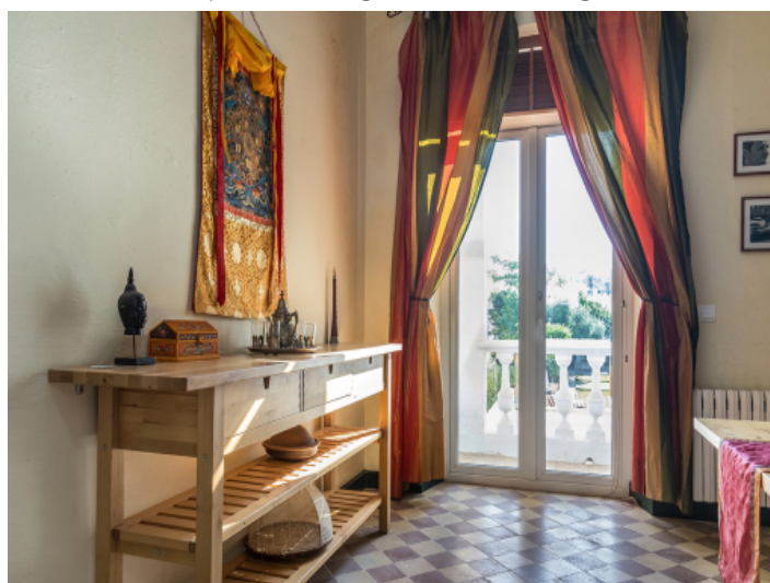
The dining area offers access to the outside area