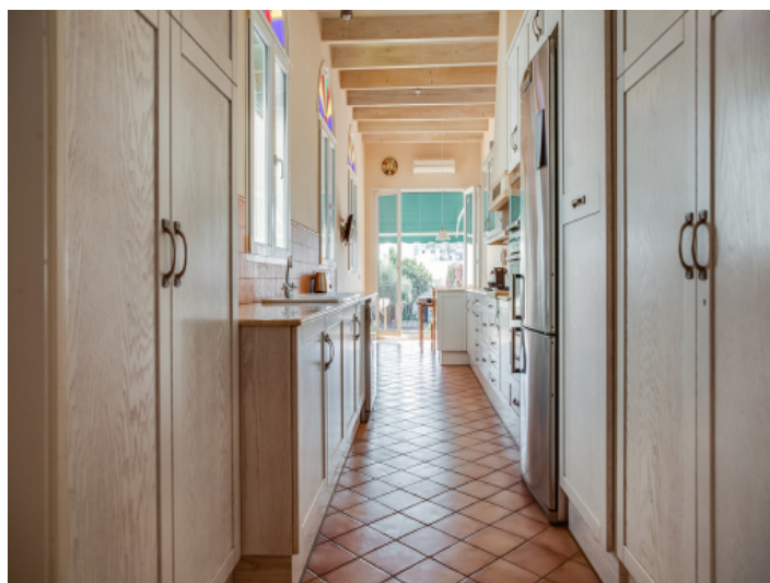
Light-flooded kitchen with terrace access