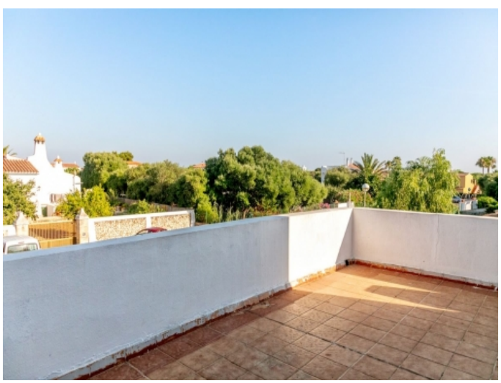
Spacious rooftop terrace with stunning views