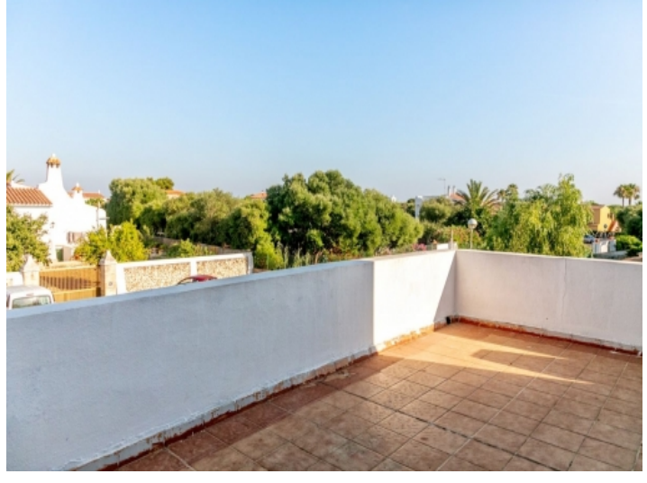
Spacious rooftop terrace with stunning views