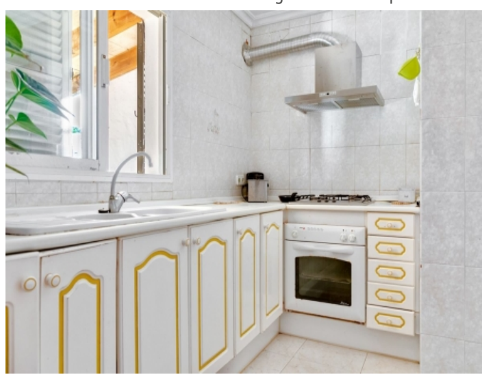
Bright and fully equipped kitchen