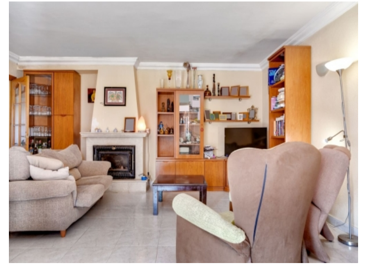
Alternative view of the living area with fireplace