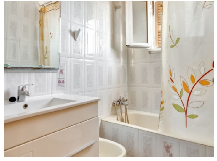
Bathroom with bathtub and daylight