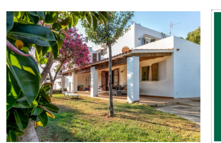
Ciutadella search for property MEN-100232