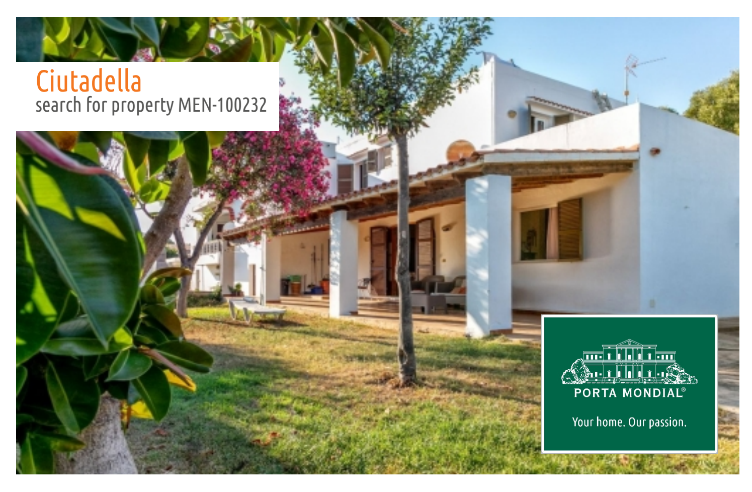
House in Cala'n Blanes requiring renovation