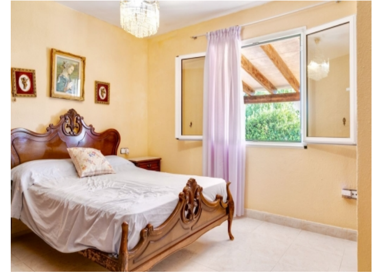
Homey bedroom with double bed