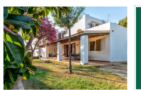
Ciutadella search for property MEN-100232