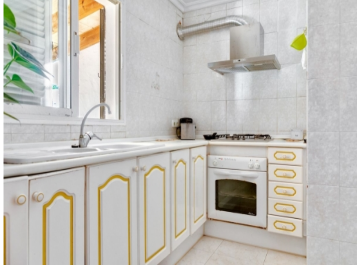
Bright and fully equipped kitchen