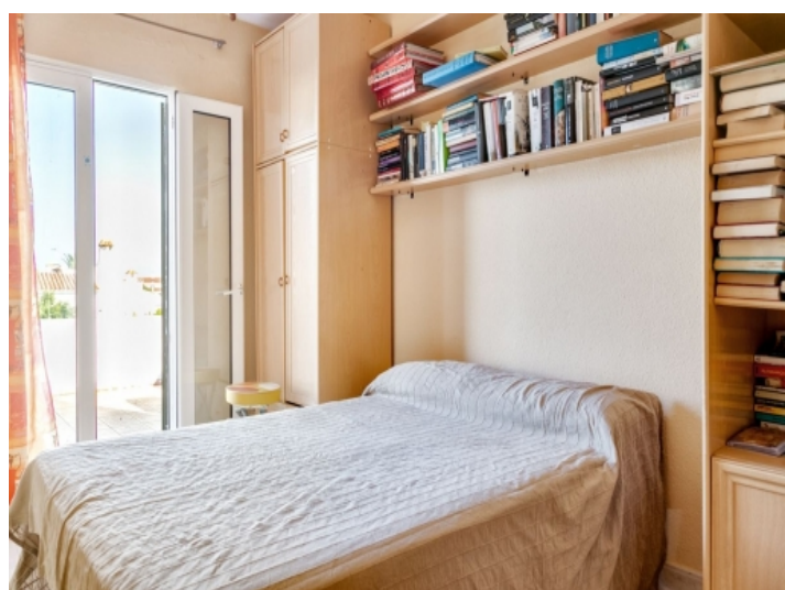
Another bedroom with access to the outdoor area