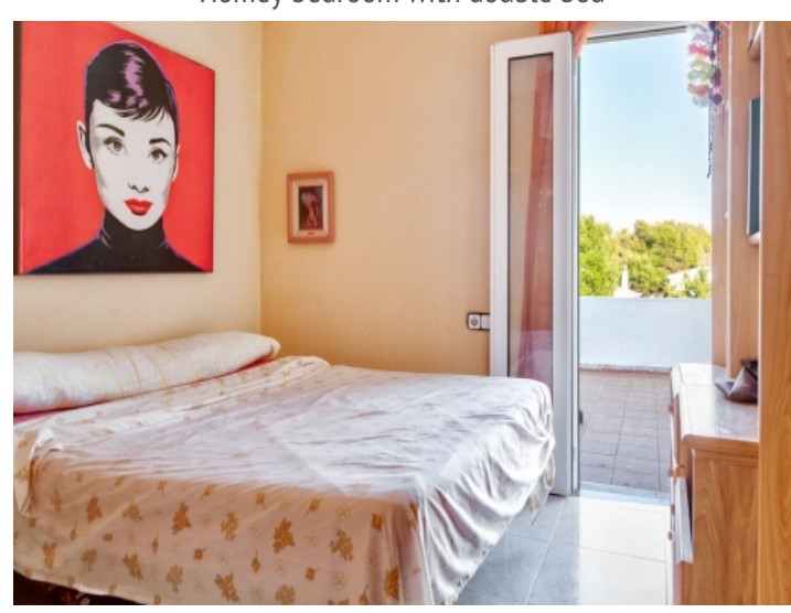
Bedroom with direct access to the terrace

PORTA MONDIAL MENORCA • AVENIDA FORT DE L'EAU, 175, LOCAL 6, 07701 MAHÓN, MENORCA, SPAIN TEL.: +34 871 510 261 • MENORCA@PORTAMONDIAL.COM • WWW.PORTAMONDIAL.COM/EN/MENORCA/