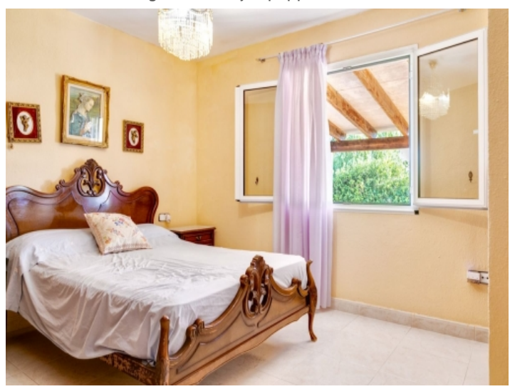
Homey bedroom with double bed