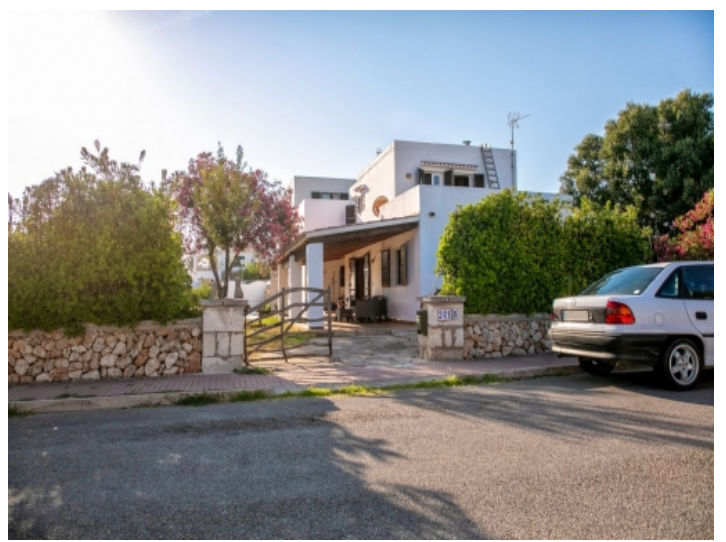
Driveway to the property