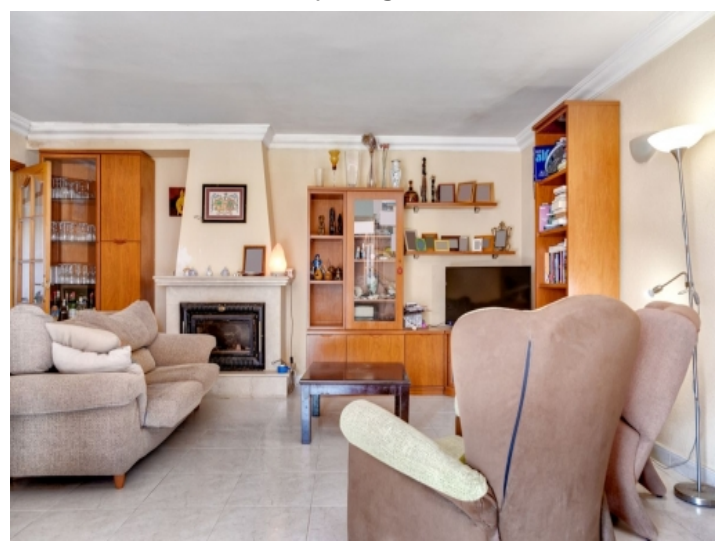
Alternative view of the living area with fireplace

PORTA MONDIAL MENORCA • AVENIDA FORT DE L'EAU, 175, LOCAL 6, 07701 MAHÓN, MENORCA, SPAIN TEL.: +34 871 510 261 • MENORCA@PORTAMONDIAL.COM • WWW.PORTAMONDIAL.COM/EN/MENORCA/