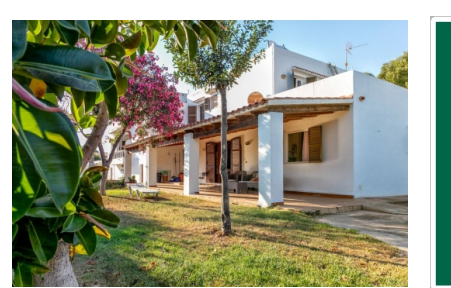
Ciutadella search for property MEN-100232