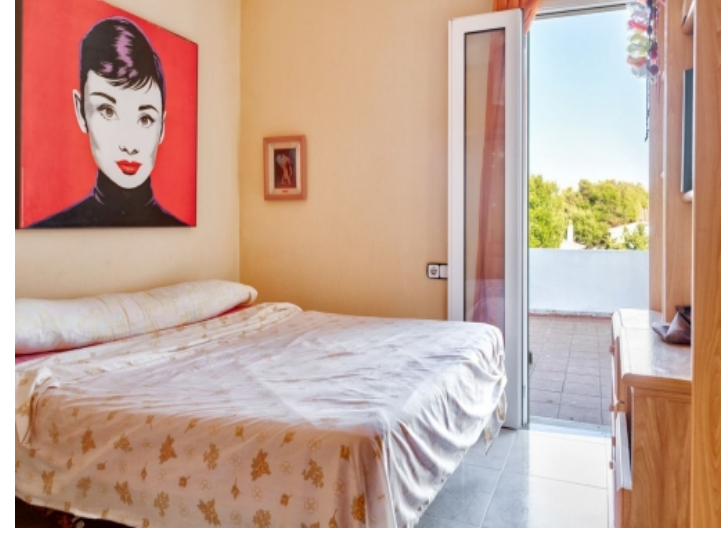
Bedroom with direct access to the terrace