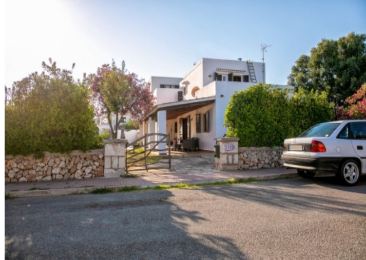
Driveway to the property