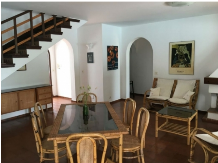
Living room with dining area