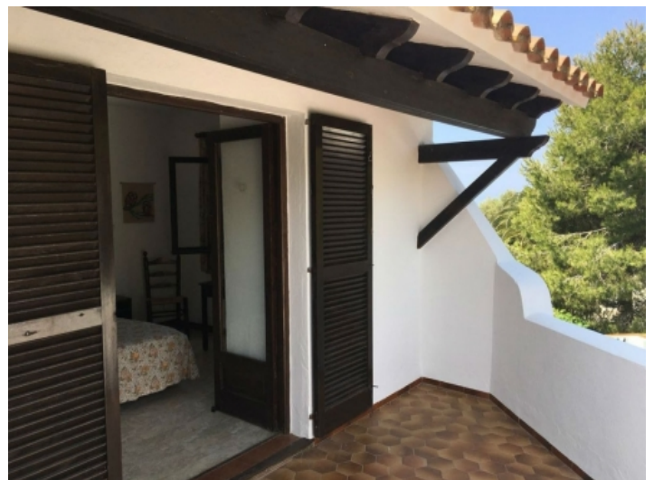
Bedroom with direct access to the balcony