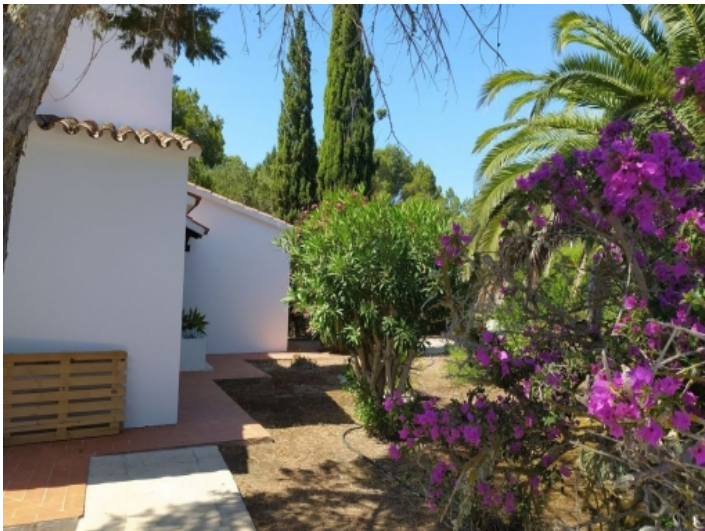
Idyllic garden area