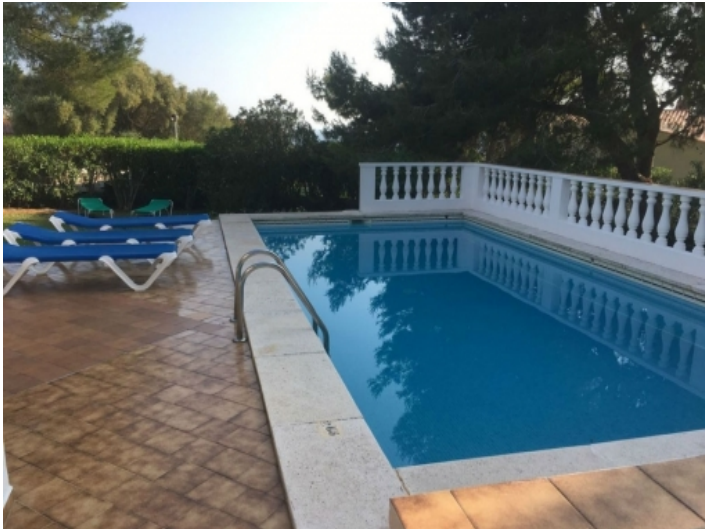
Spacious pool area