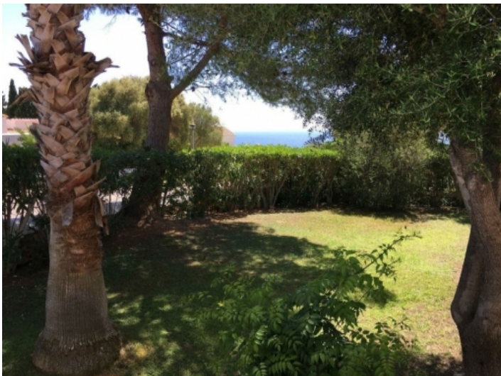
Backyard with sea views