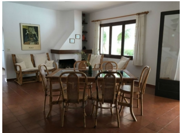
Dining area with chimney