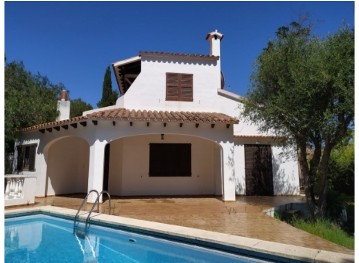
Alternative view of the Pool