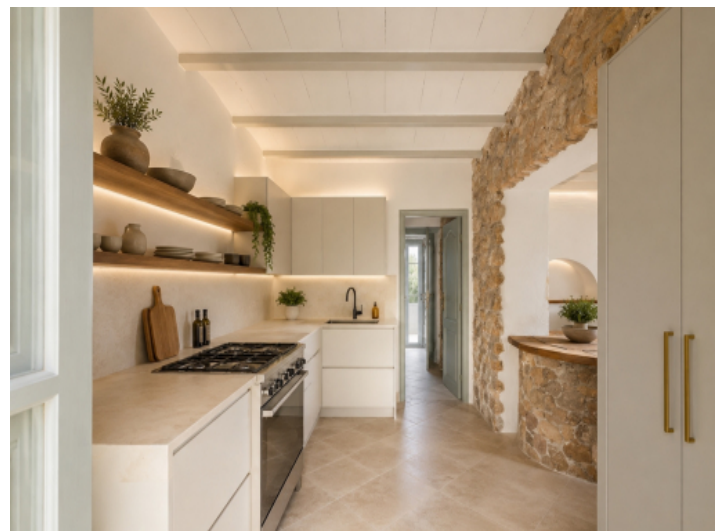
Concept Image (AI)