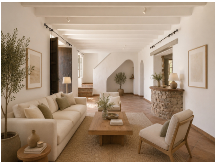
Concept Image (AI)