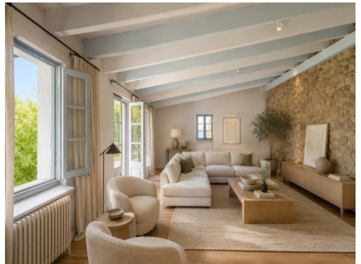
Concept Image (AI)