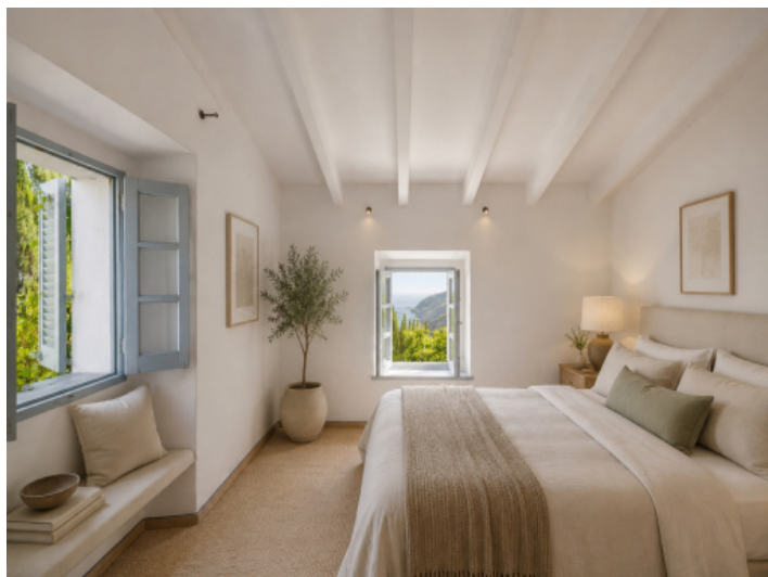
Concept Image (AI)