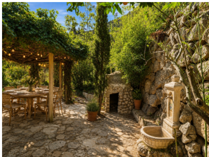
Concept Image (AI)