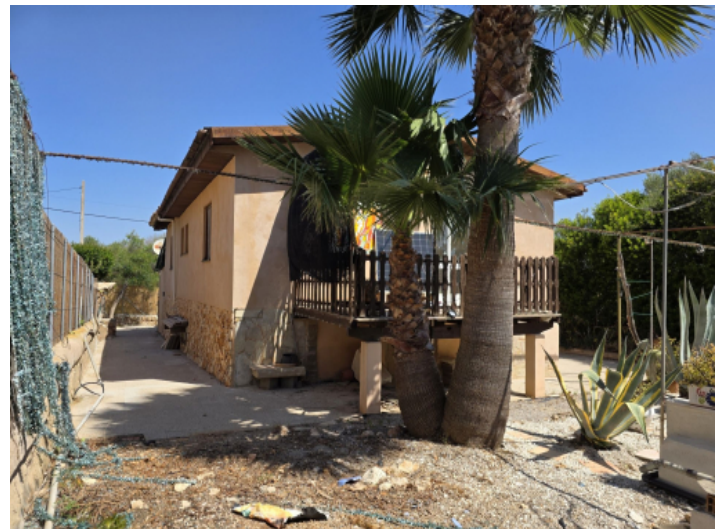
Single family house