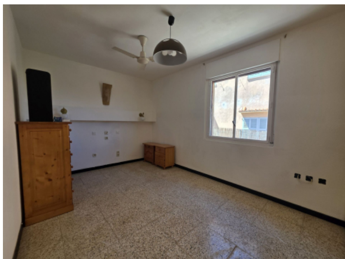
One of three bedrooms