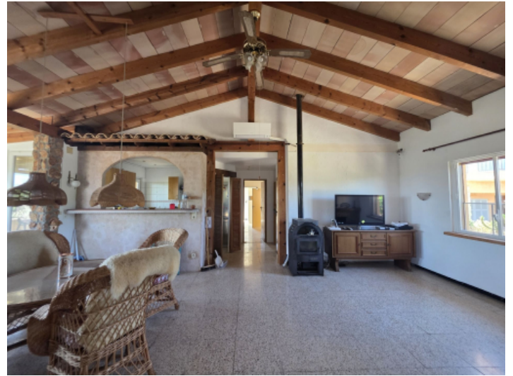
Open living concept