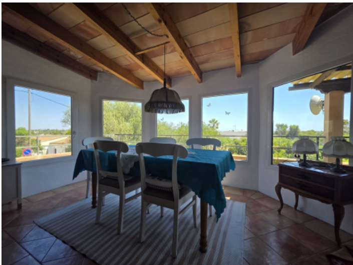
Dining area with views