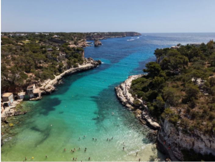
Beach from Cala Llombards