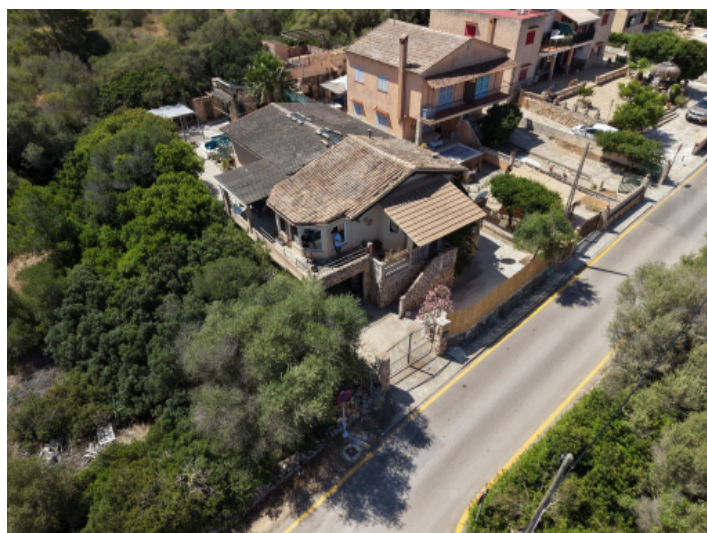
Single family house