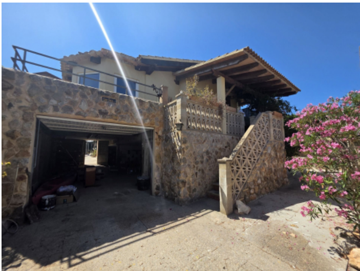
Front Yard with garage