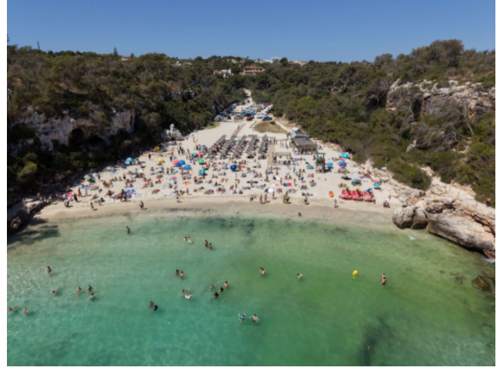
Beach from Cala Llombards