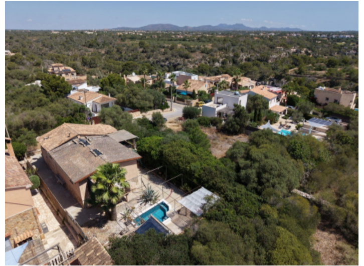
just a few meters from the beach