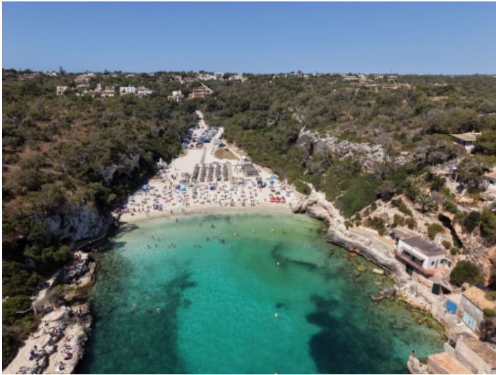
Beach from Cala Llombards