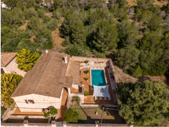
Directly adjacent to a non-buildable forest plot