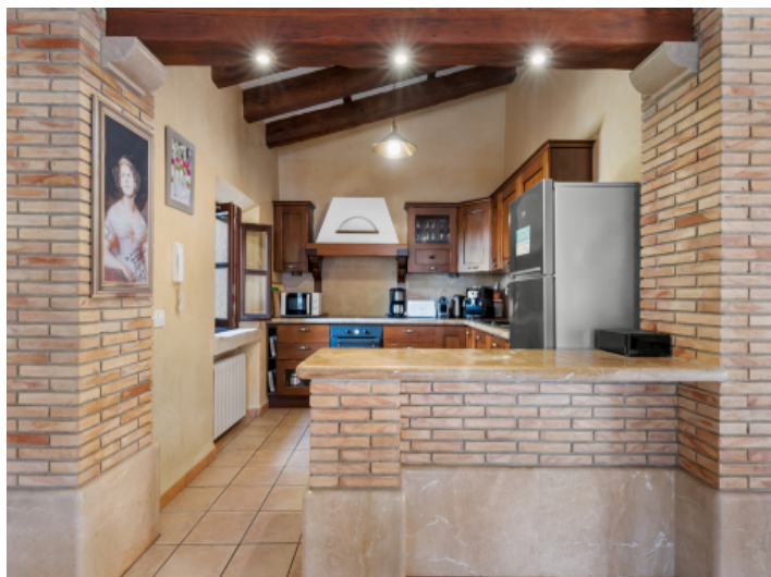
Kitchen adjoining the living area