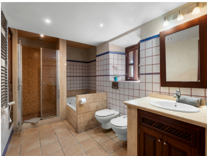
Master bedroom bathroom