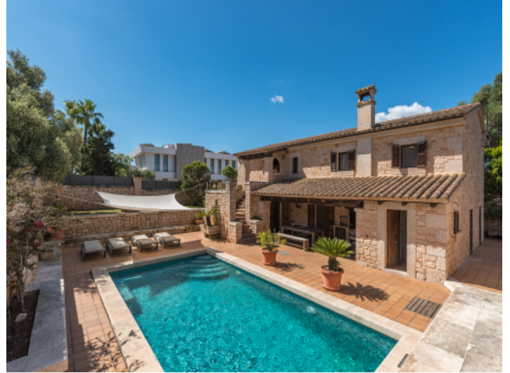
The terrace and pool are situated on a slightly lower level