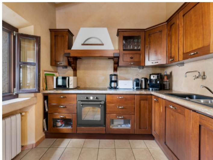
Fully equipped fitted kitchen