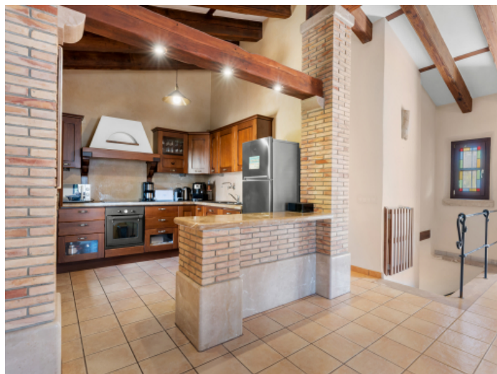
Kitchen adjoining the living area