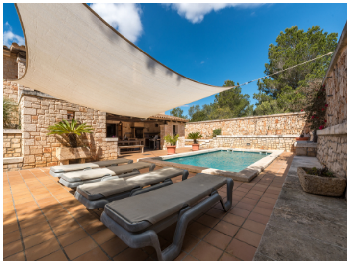
Sun terrace by the pool