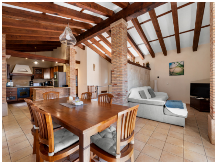
Open-plan living and dining area