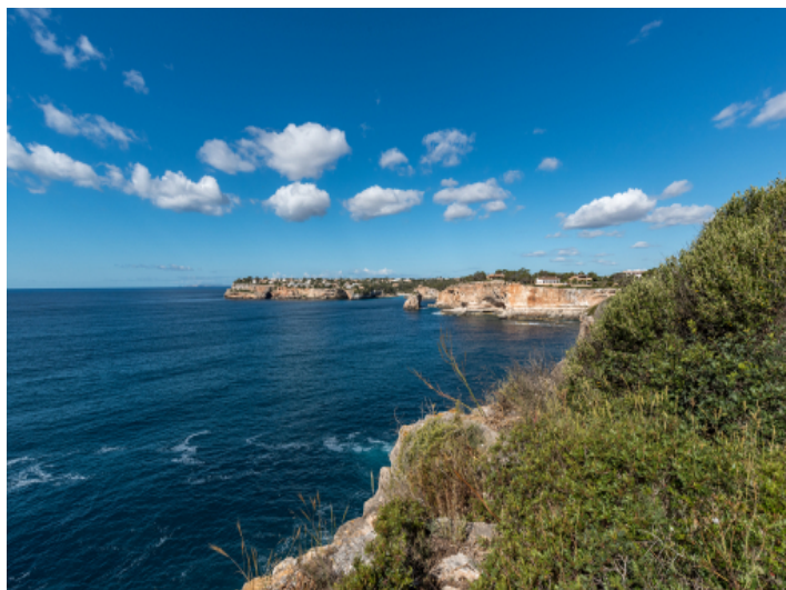
View towards Es Pontàs