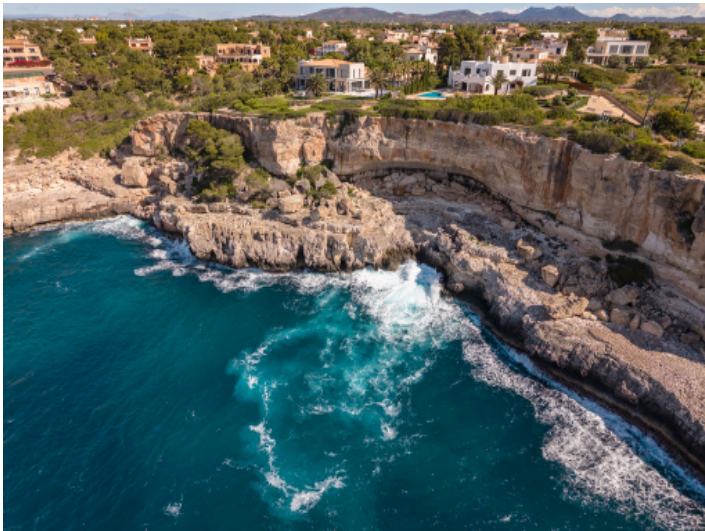
Coastline of Cala Santanyi