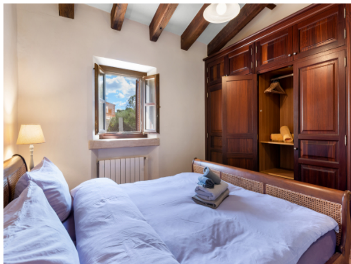
First guest bedroom on the upper floor