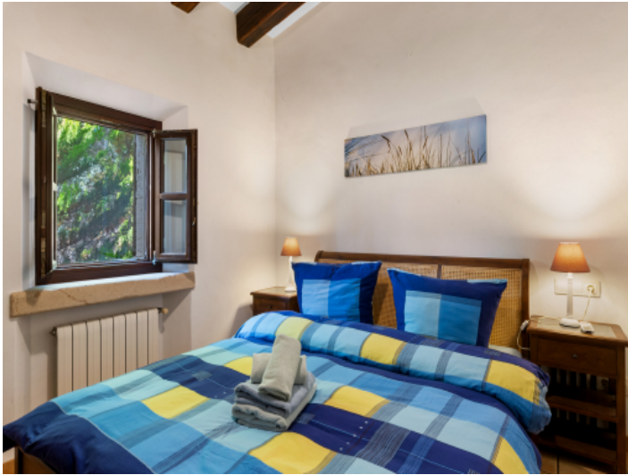
Second guest bedroom on the upper floor