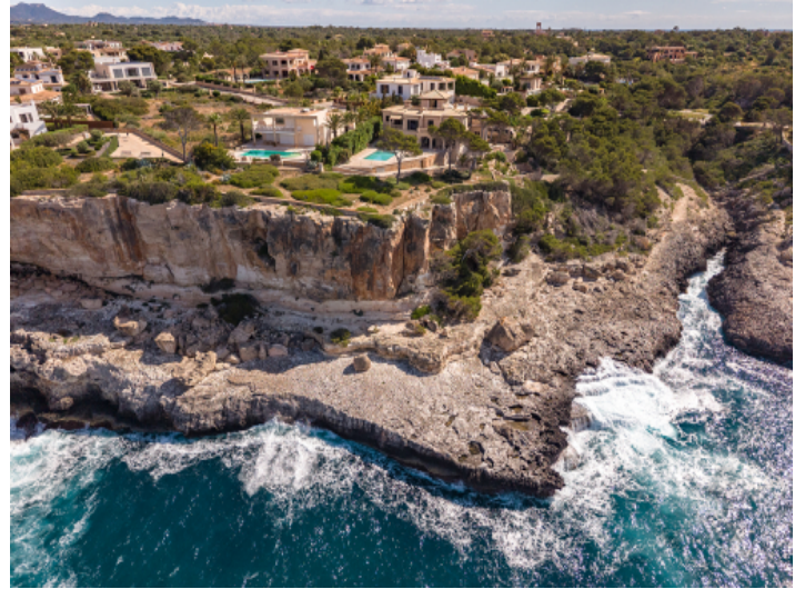
Coastline of Cala Santanyi