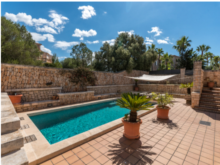
Pool with integrated built-in seating area