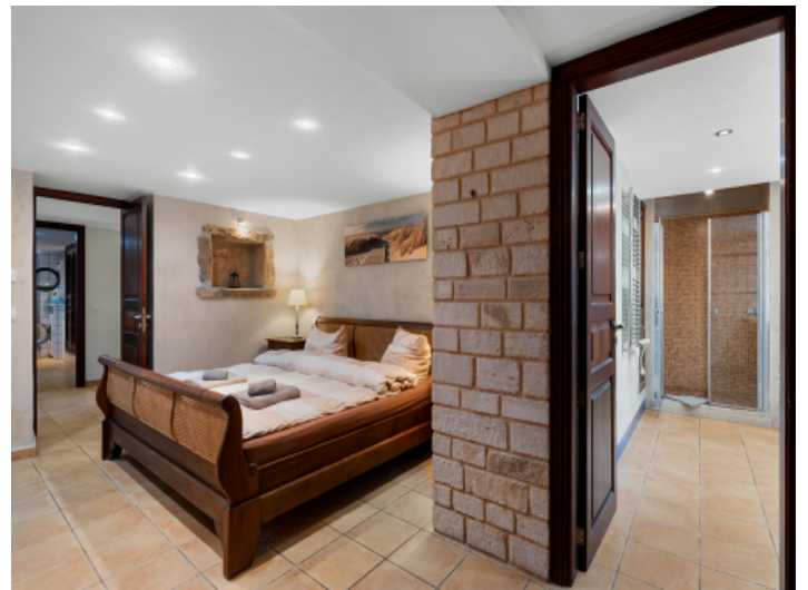
Master bedroom with en-suite bathroom