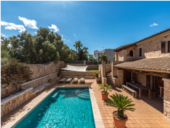
The terrace and pool are situated on a slightly lower level