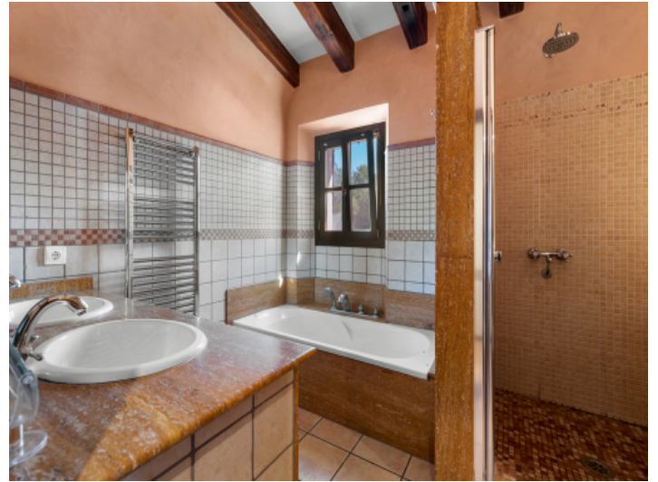
Bathroom on the upper floor