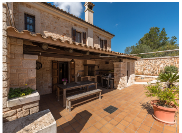
Covered terrace directly adjacent to the house with access to the ground floor

PORTA MALLORQUINA • C./ COLOM 20 2º, 07001 PALMA, SPAIN