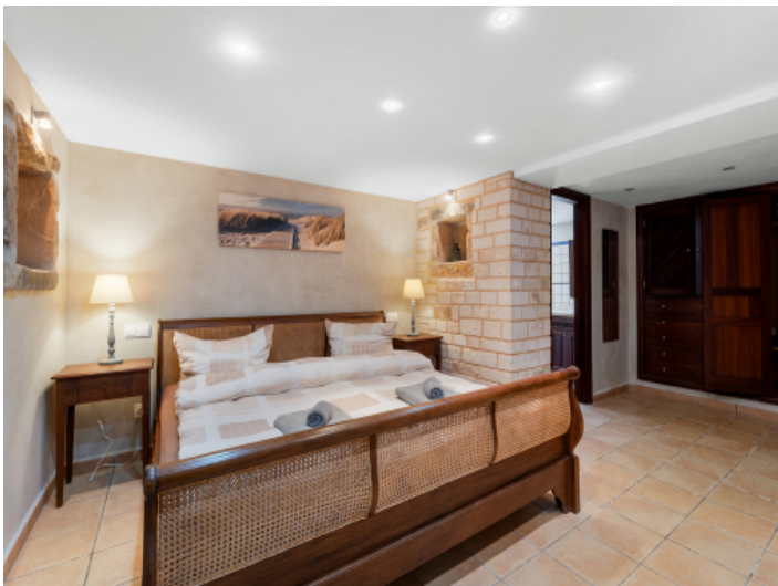
Master bedroom on the ground floor with direct level access