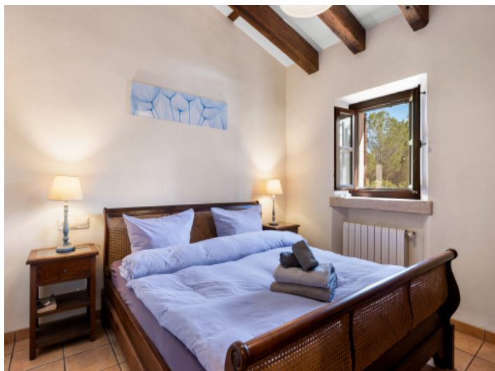
First guest bedroom on the upper floor