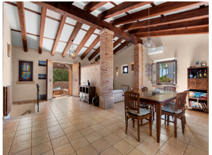
Entrance area flowing seamlessly into the open-plan living area