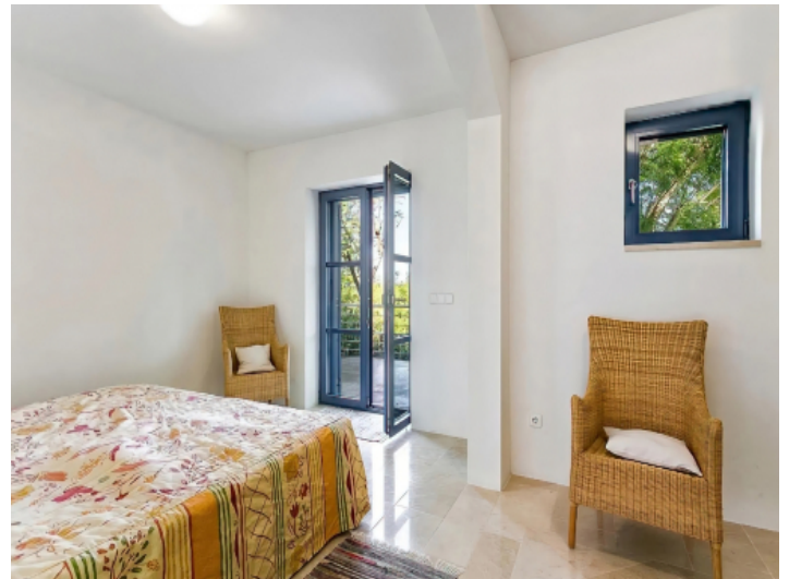
Second guest bedroom