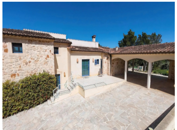
Entrance area and parking spaces