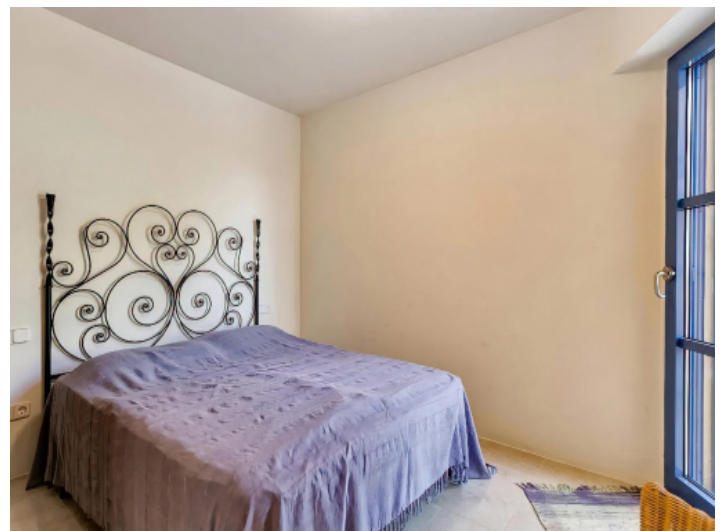
First guest bedroom