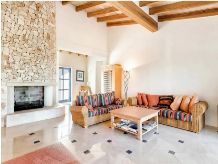
The living room combines rustic and modern style