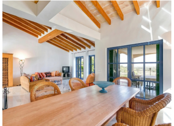
Dining area with access to the covered terrace