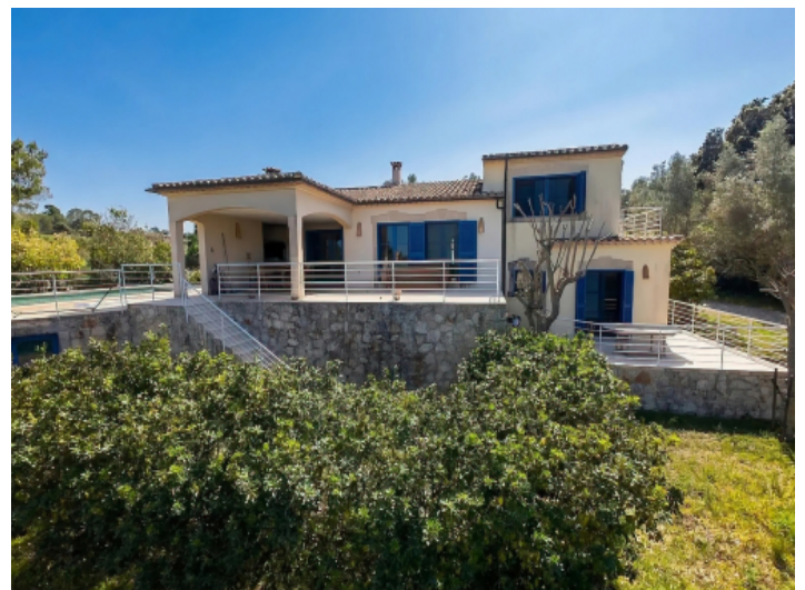
View of the house from the garden