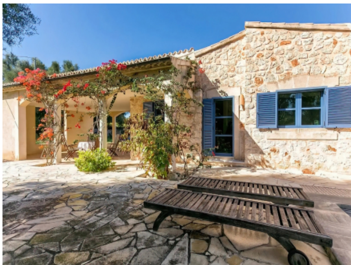
View of the house from the pool deck