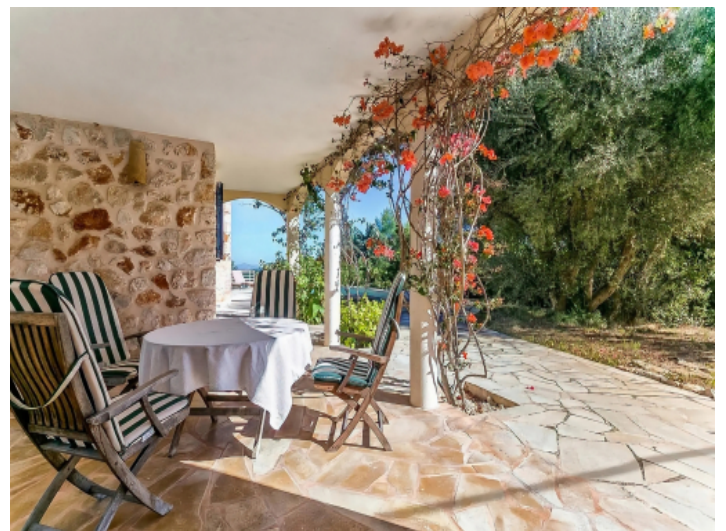
Covered seating areas