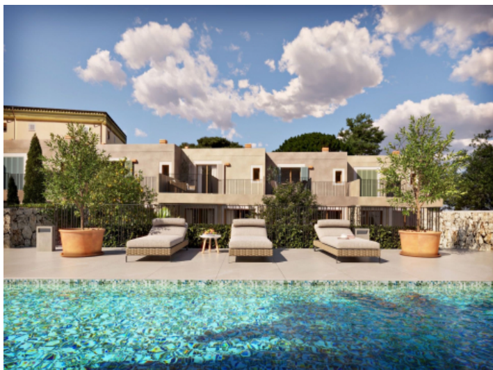
Community pool area