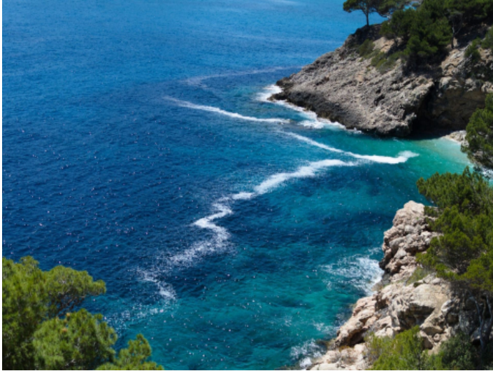
Coast of Arta