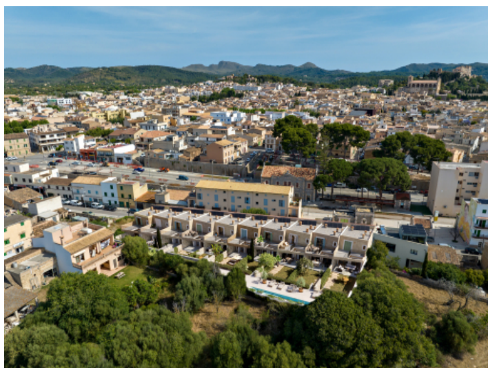
Location in Arta