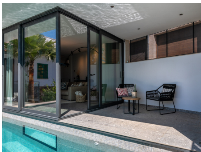
Open-plan living area with seamless transition to the pool