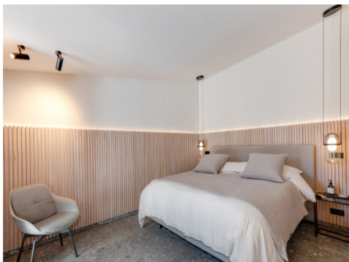
Bedroom on the ground floor