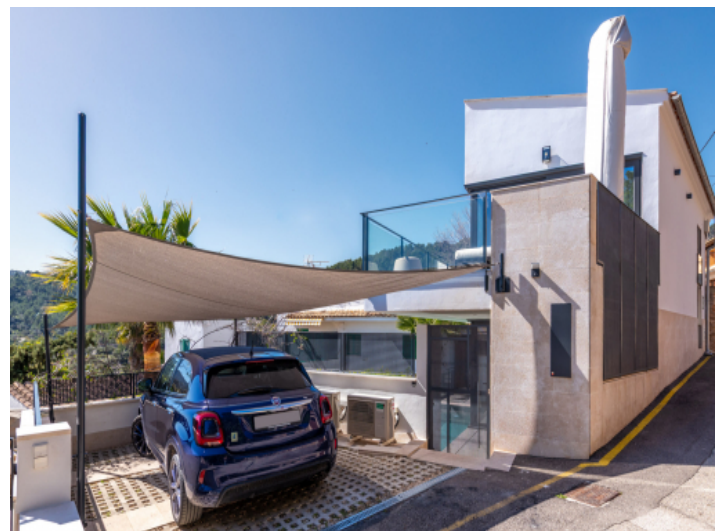
Parking space for one vehicle