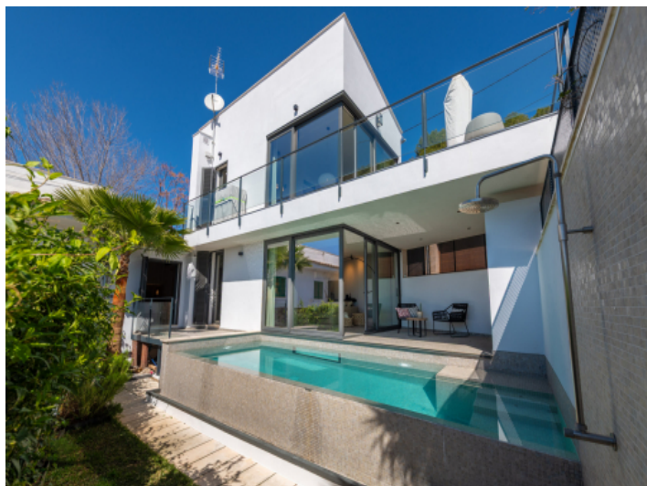
Exterior view of the modern villa with pool