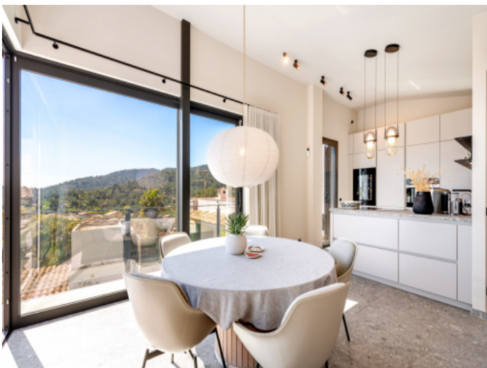
Modern kitchen and dining area on the upper floor