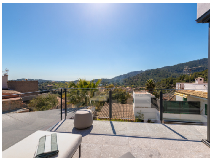
Open views of the landscape