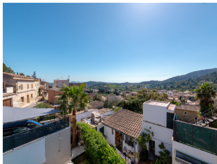
Open views of the landscape