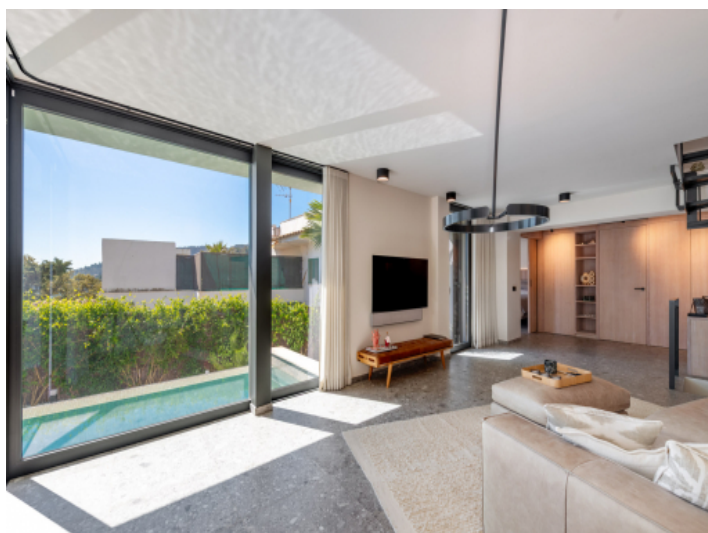
Light-filled living area with large window fronts