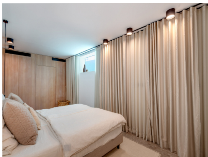
Bedroom in the basement