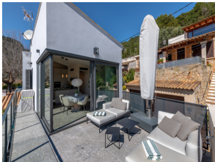
Modern rooftop terrace with seating area and access to the