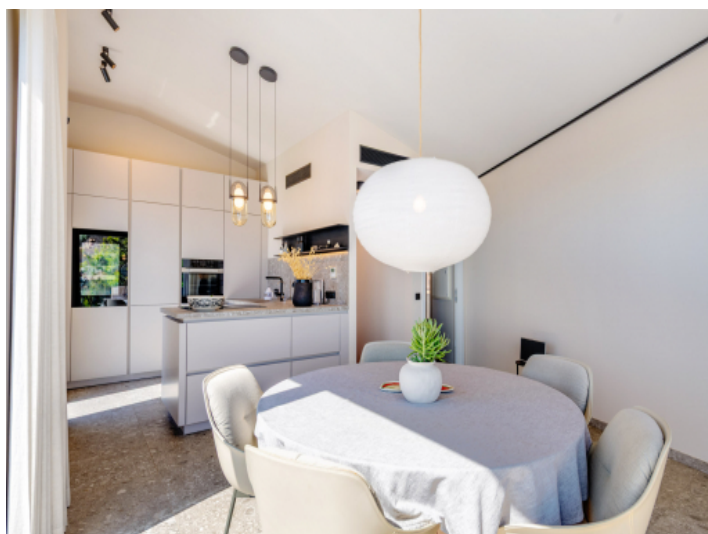
Dining area with panoramic windows and views