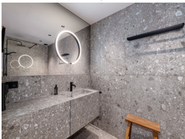
One of the two bathrooms