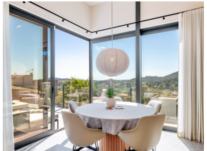
Dining area with panoramic windows and views