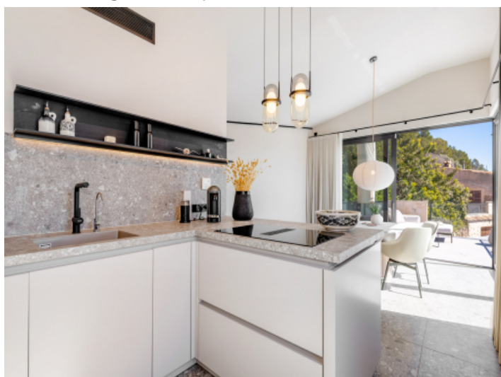
Modern kitchen with high-quality appliances