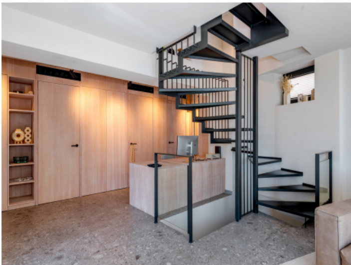
Modern villa architecture