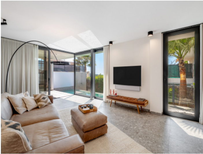
Open-plan living area on the ground floor