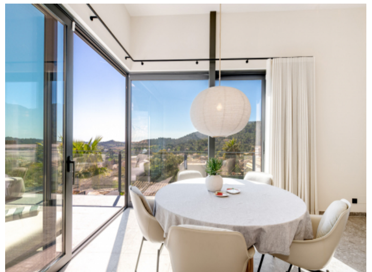
Dining area with panoramic windows and views

PORTA MALLORQUINA • C./ COLOM 20 2º, 07001 PALMA, SPAIN