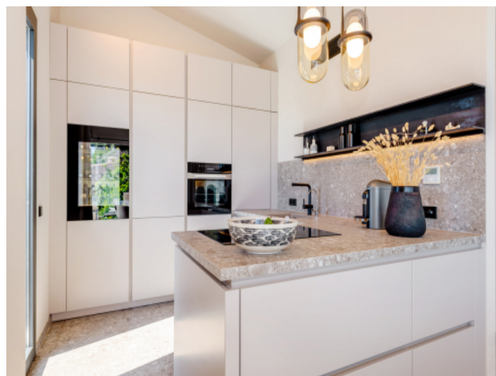
Modern kitchen with high-quality appliances