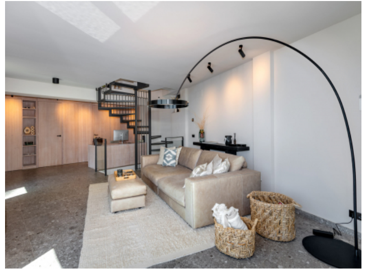
Open-plan living area on the ground floor