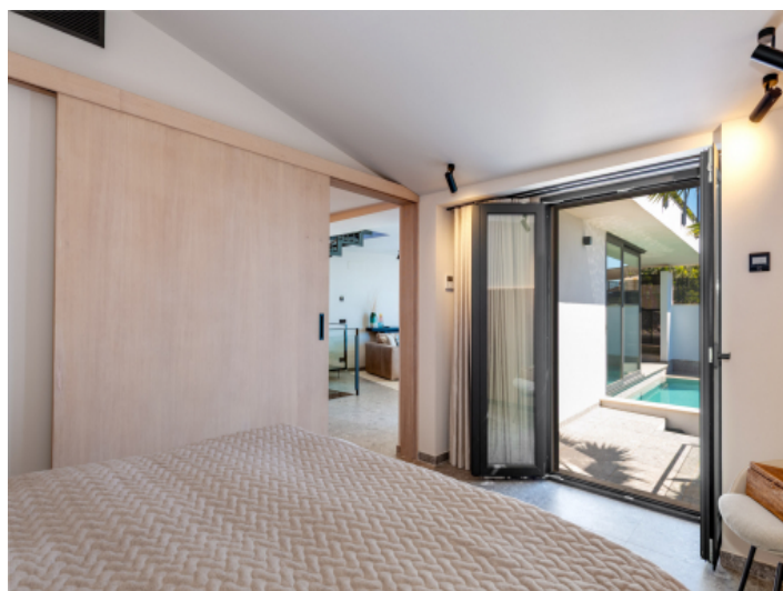
Bright bedroom with access to the outside