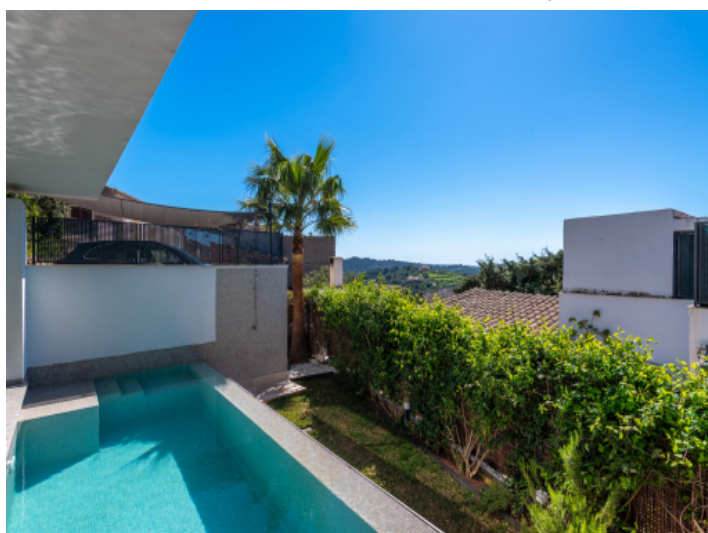
Pool area with sun terrace