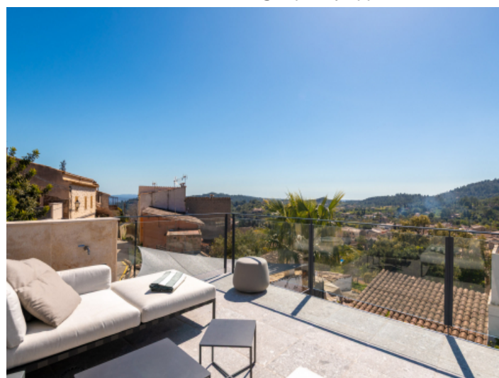
Rooftop terrace with wide views over Alaró and the