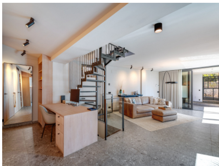
Open-plan living area on the ground floor