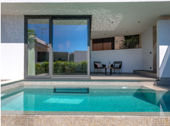
View of the pool terrace