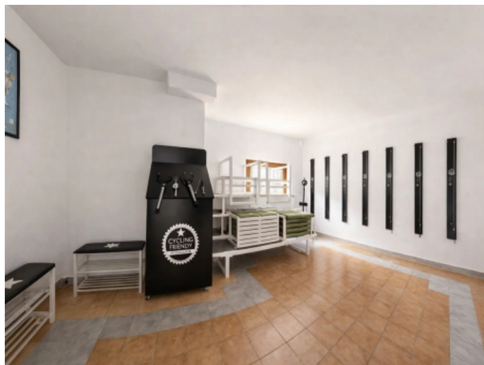
Bike storage area