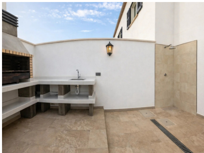
BBQ area and shower