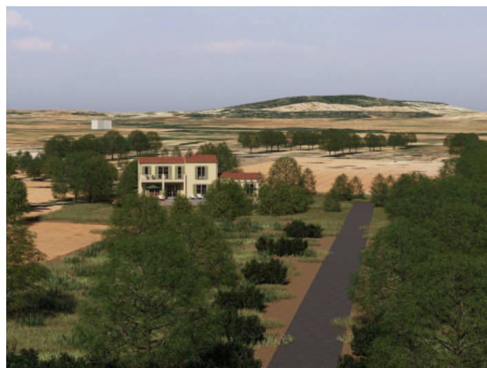
Slot with house