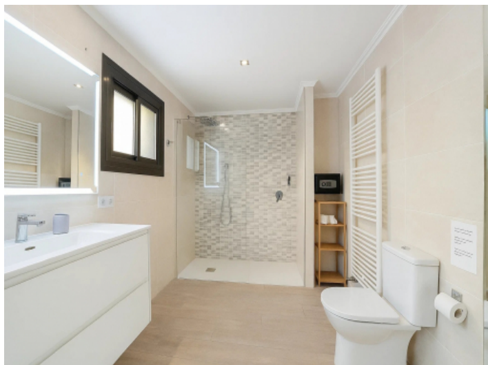
Bathroom of the first double bedroom