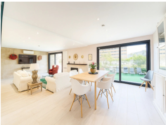
Bright dining room with open access to the living area