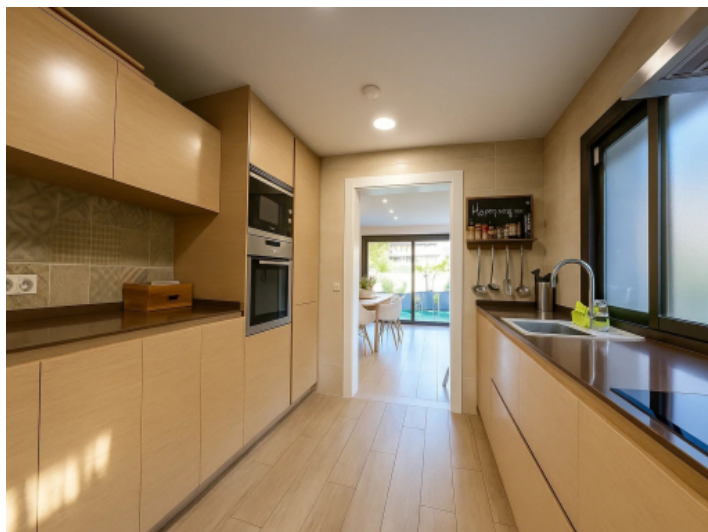
Alternative view of the fitted kitchen