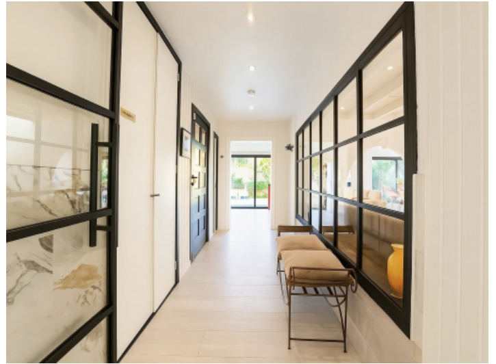
Bright entrance area