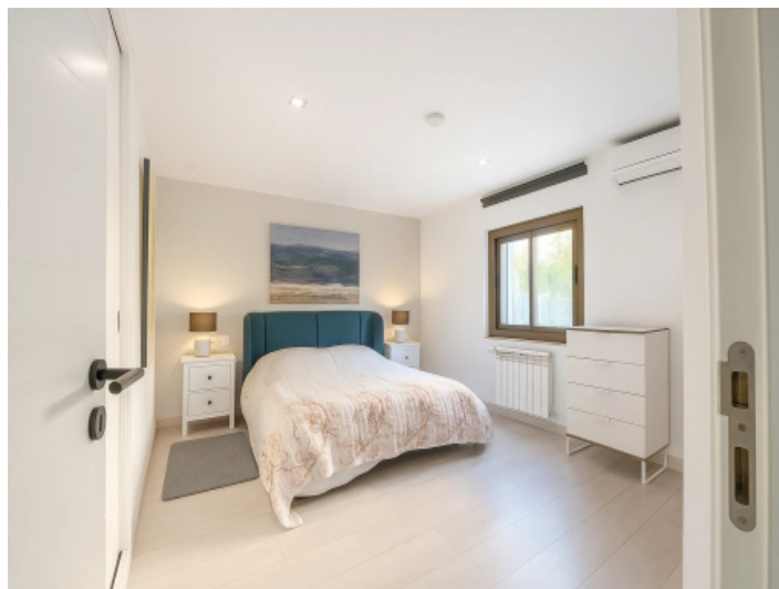
First double bedroom