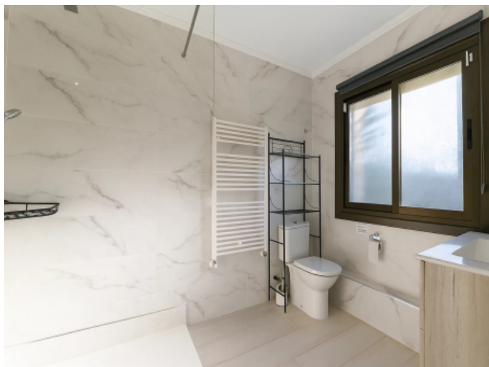
Bathroom of the second double bedroom