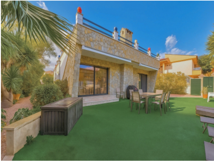
Spacious terraces in front of the living room