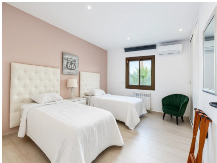
Third double bedroom