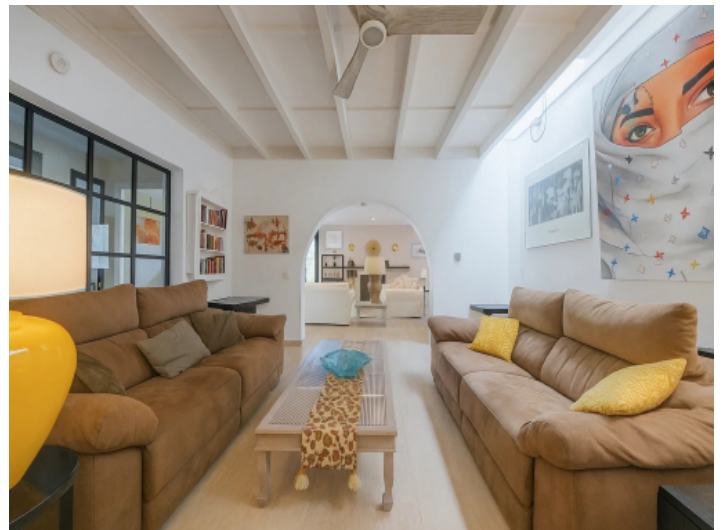
Cozy lounge area