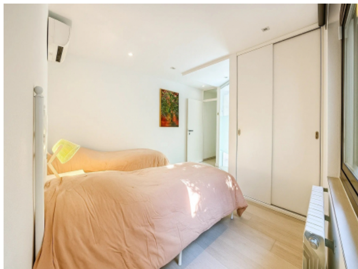
Second en-suite bedroom