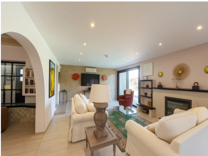
Living room with fireplace