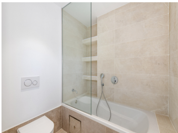
Bathroom en suite