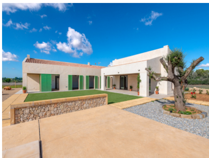
View form the garden