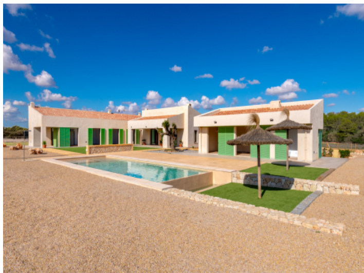
Garden and pool