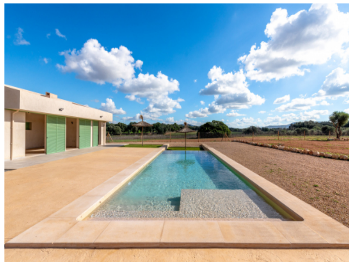
Pool with views to San Salvador