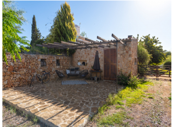
Separate guest apartment with its own terrace