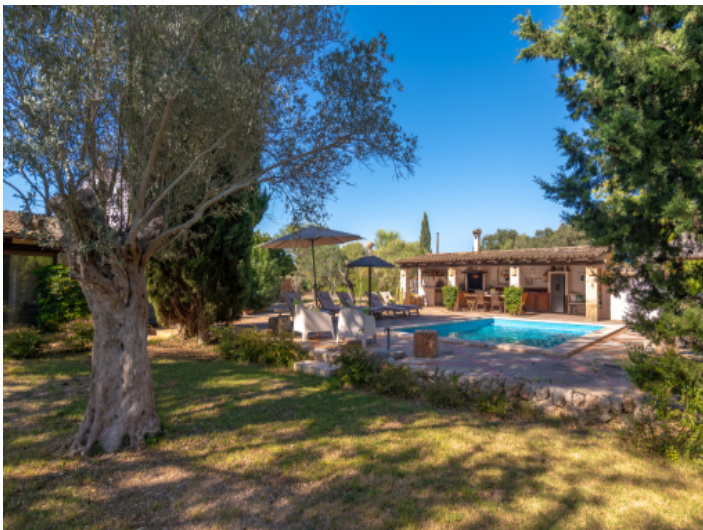
Green surroundings and extensive plot with plenty of privacy