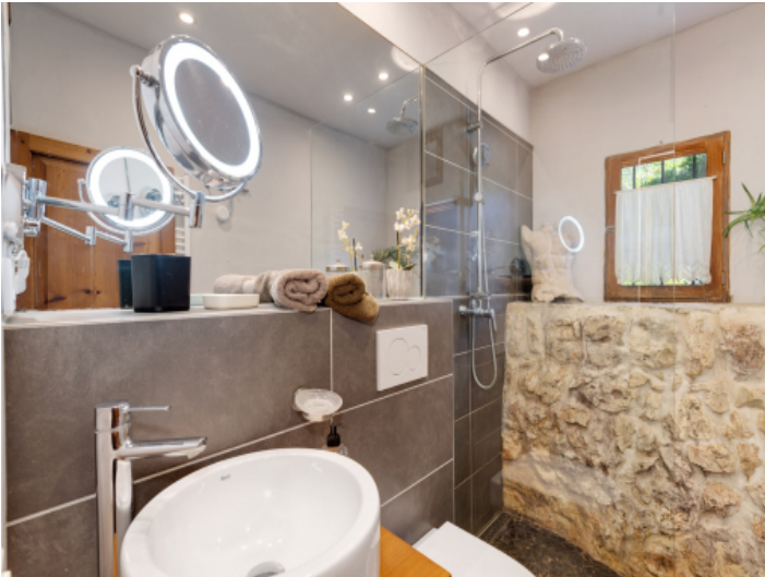
One of the three bathrooms