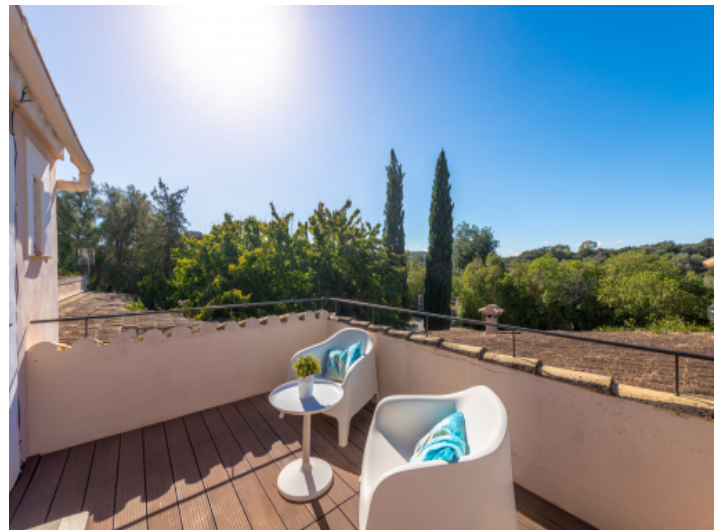
Private terrace on the upper floor