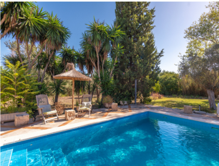
Swimming pool surrounded by spacious sun terraces