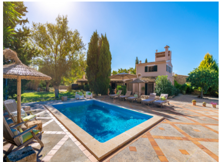
Swimming pool surrounded by spacious sun terraces