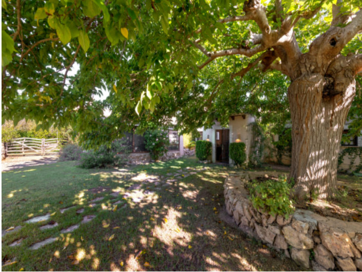
Surrounded by lush greenery and Mediterranean nature