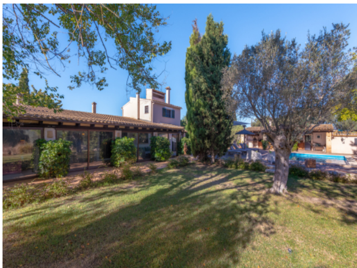
Large glass front connecting living space and nature