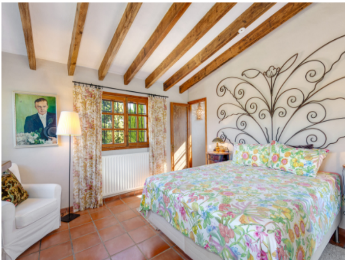
One of the three bedrooms