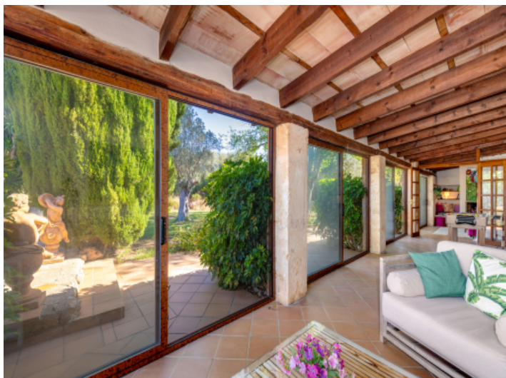
Conservatory with views of the garden and pool