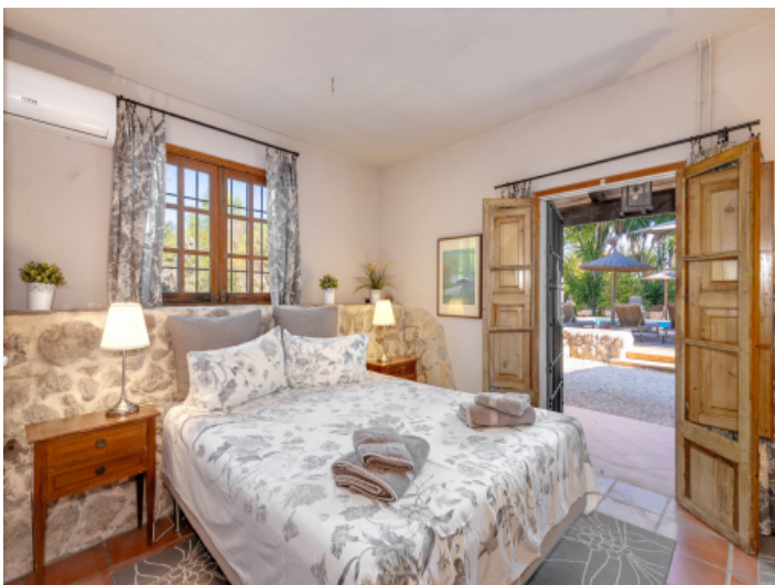
One of the three bedrooms