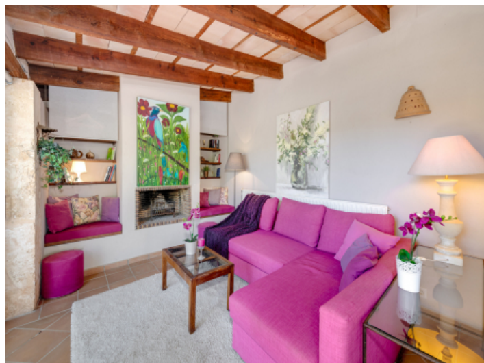
Cosy living area with plenty of space to relax