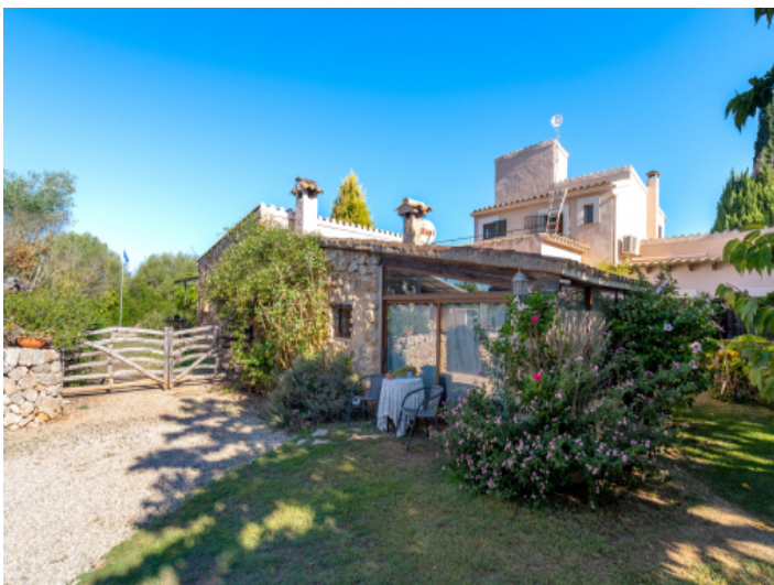
Finca in Costitx with ETV licence