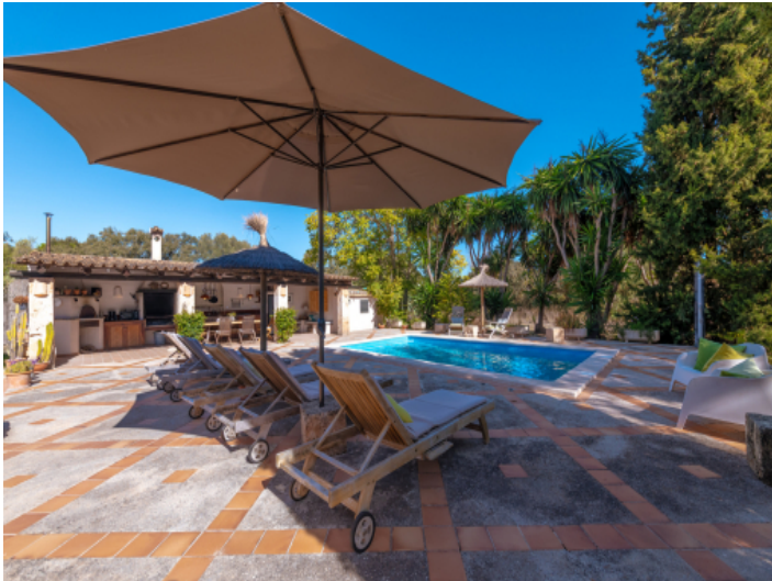
Swimming pool surrounded by spacious sun terraces