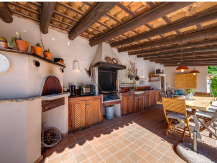
Summer kitchen for enjoyable evenings outdoors (stone oven, barbecue)