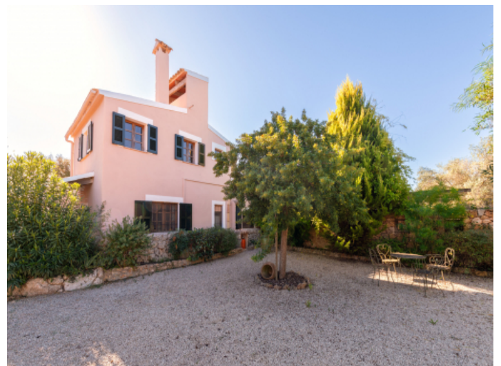
View of the well-kept finca in a quiet location near Costitx