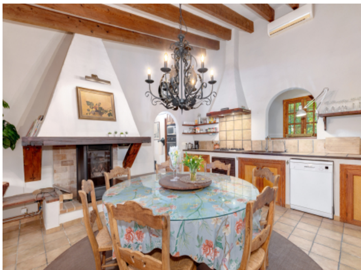
Open kitchen with dining area