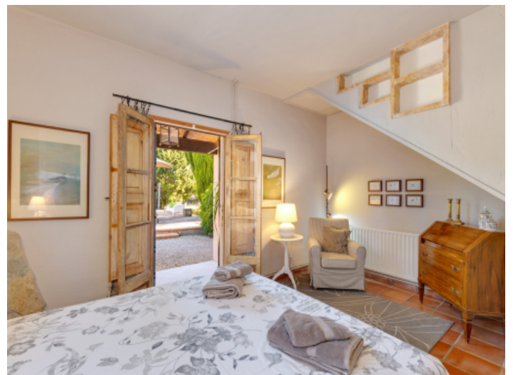
One of the three bedrooms