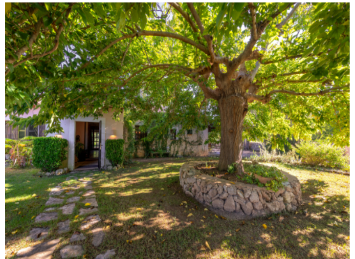
Large garden with Mediterranean flair