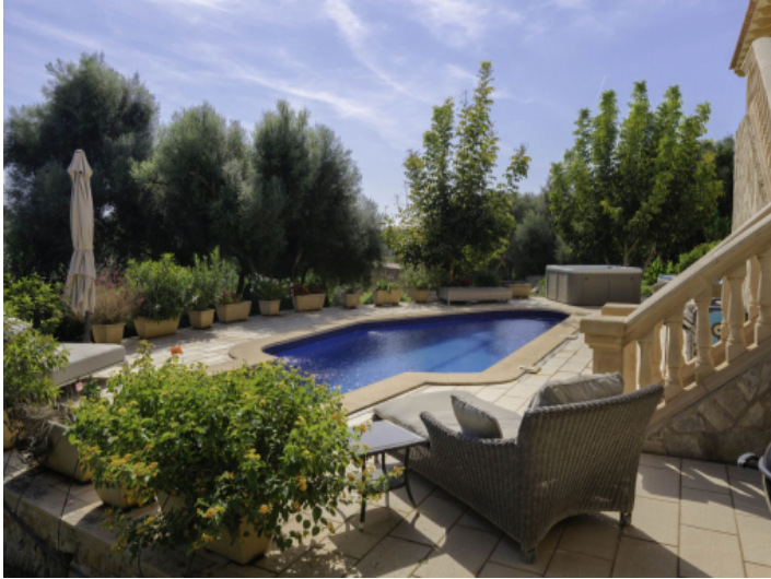
Private Pool Area