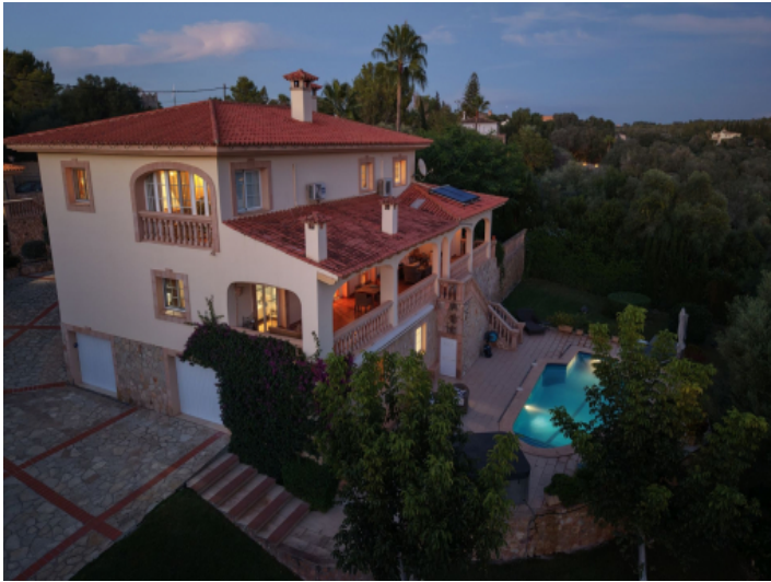
Luxury Villa in S'Aranjassa