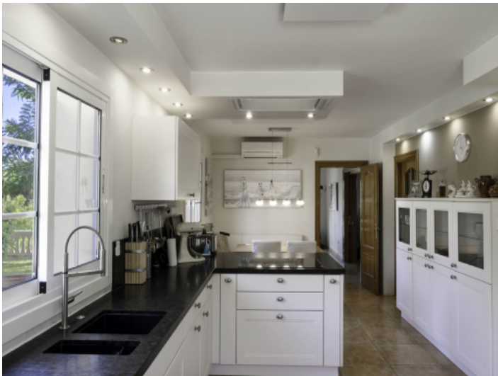
Big rustic kitchen