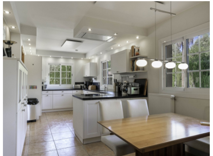
Kitchen with dining place