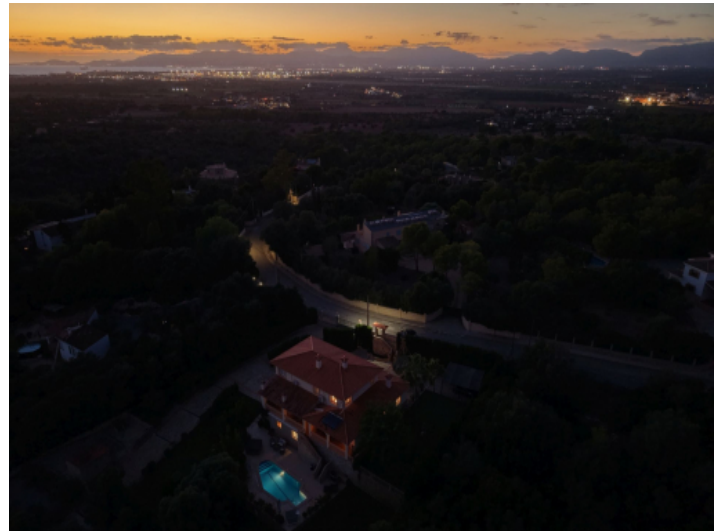
Palma Bay at Night