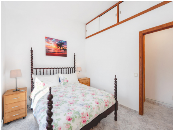
Bedroom with Storage